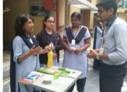
Demo on importance of whole grains