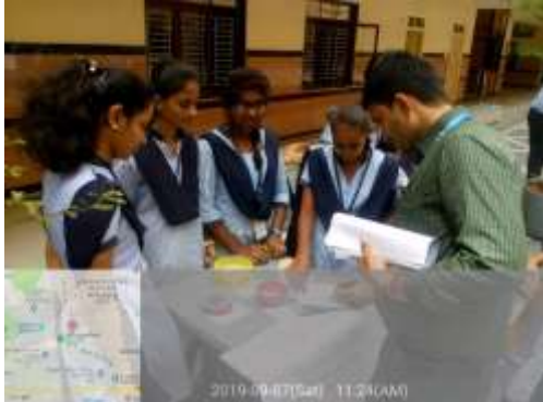
Food stall at Nutrition Day celebration

Managed by Brothers of St. Gabriel Educational Society