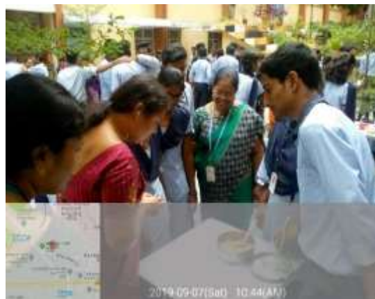
National Nutrition week celebration