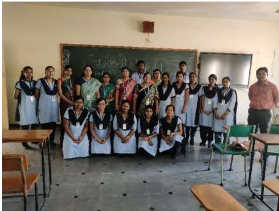
Johann Mendel club members