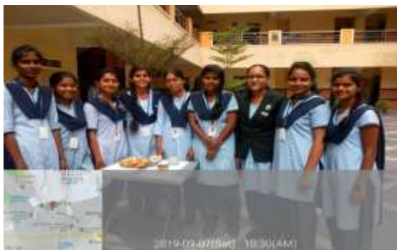
Food stall at Nutrition Day celebration

Students had actively participated by putting up food stalls. They displayed nutritious and explained the nutritious values also. They gained a lot of knowledge about the importance of nutrition and the vitamins present in them which helps us to build up the immunity and fight against diseases during illness.