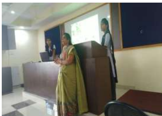
Session on home remedies