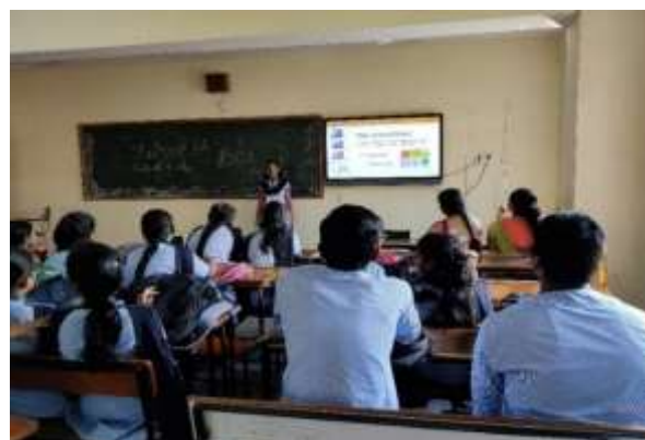
Students' seminar on significance of mental health