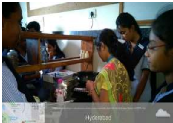
Workshop on Lozenges preparation

The department of Botany had organised a workshop for Johann Mendel Club on 29 th August 2019. The program was on preparation of homemade capsules for cough and cold. A PowerPoint presentation was also shown which dealt with the natural painkillers of the kitchen. The health benefits of Ginger, Honey, Guduchi, Turmeric, Tulsi, Aloe vera was also explained. The procedure for Lozenges preparation was demonstrated. Students also shared their own different ideas about various kitchen items & natural ingredients that help to improve health.