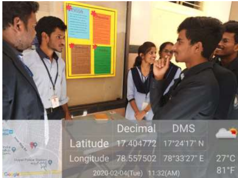
Posters on different fermented food

Managed by Brothers of St. Gabriel Educational Society