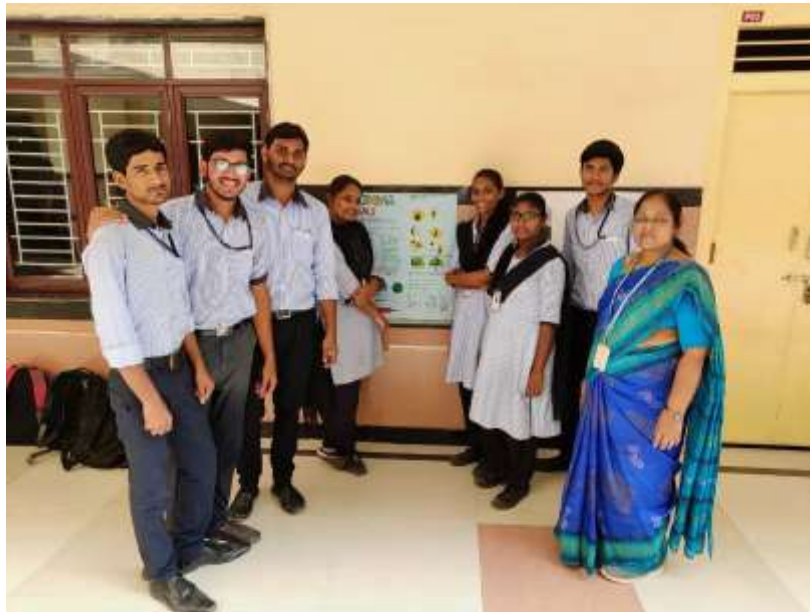
Model & Poster presentation on Role of women