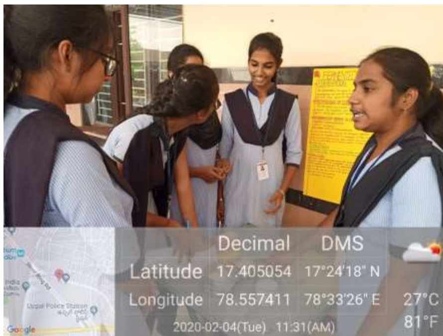
Student's interaction on fermented food