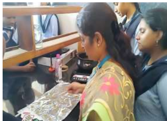
Demo on Lozenges preparation for home remedies