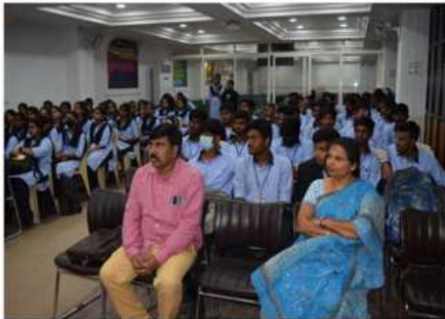
Students listening to Devotional Song