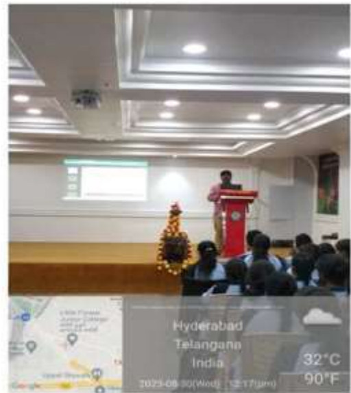
Guest lecture Presentation