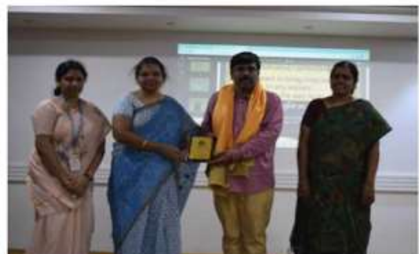
Felicitation of the Guest