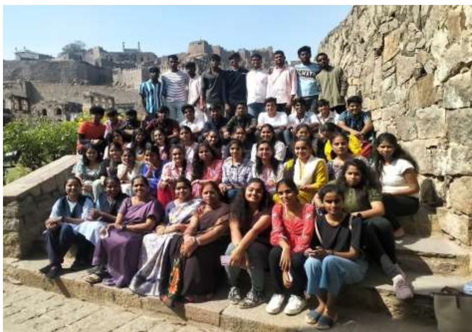
Field trip to Golconda

The field trip left a lasting impression, evoking a sense of awe and appreciation for Golconda's historical significance, architectural splendour, and cultural heritage. It was a journey through time, igniting a profound curiosity and admiration.