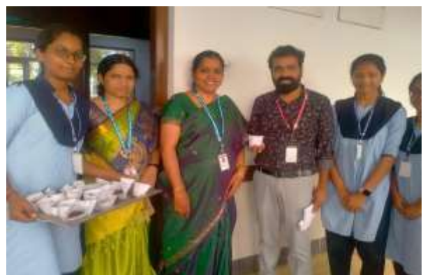
Distributing seeds pouches to LFJC staff