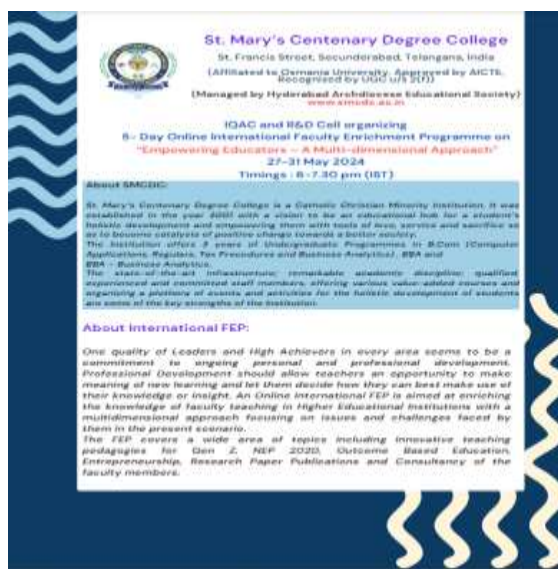
FLYER OF FEP ST. MARY'S DEGREE COLLEGE