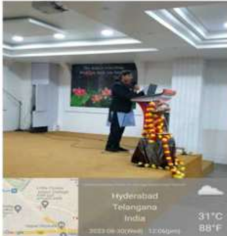
Introduction to Sanskrit Divas

Managed by Brothers of St. Gabriel Educational Society