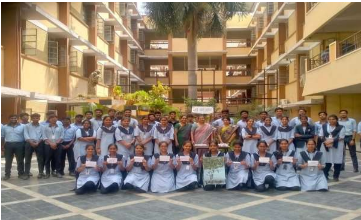
A Group photo with the students on Green Extension Day