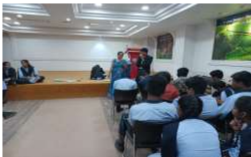
Conducting Sanskrit Tambola in Montfort Hall