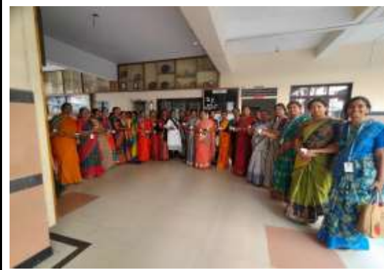
Distributing seeds pouches to LFDC staff

Managed by Brothers of St. Gabriel Educational Society