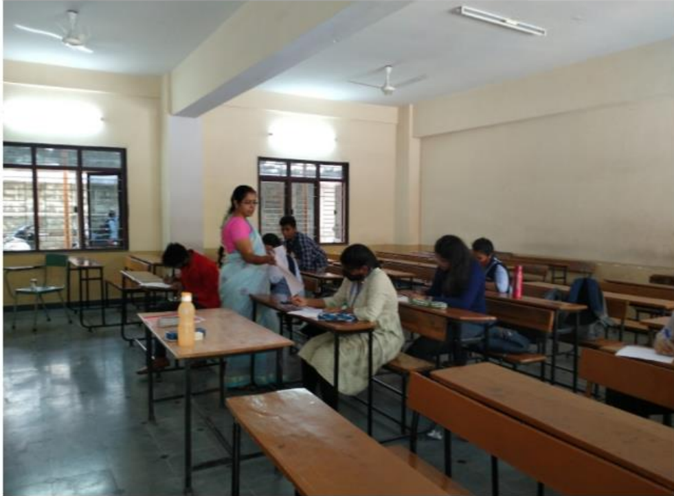
STUDENTS PARTICIPATING IN COMPETITIONS

Managed by Brothers of St. Gabriel Educational Society