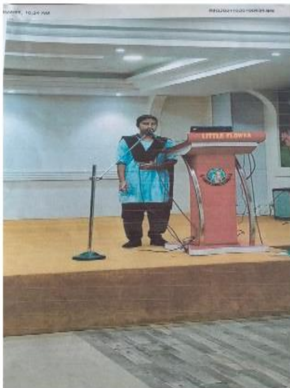
Students participating in the program

To Celebrate the Gita Jayanti. The Department of Sanskrit has conducted a program in Montfort Hall to celebrate the Geetha Jayanthi. On the day of Geetha Jayanthi, the slokas recitation was done by students and they enjoyed it a lot, the ppt presentations and dance performances were also done by the students.