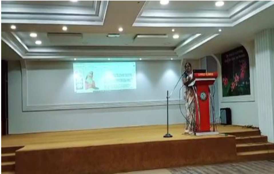
PPT PRESENTATION ON VALMIKI JAYANTHI