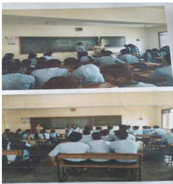
Students participating in shabda ranjani

REPORT: The Department of Sanskrit has given a project to final year Sanskrit students shabda ranjani. Students have to prepare clues for the project they take up and have to show it to the other students in order to solve the puzzled questions to complete the project. BTMC, BZC, BCOM, CA, BBA, GEN, MPCs, MSCs, study had made the projects & displayed them on the board. It was a good experience for all the students of Sanskrit to improve the language skills as a brainstorm game that made every student involved and participate actively in the game Shaba ranjani.