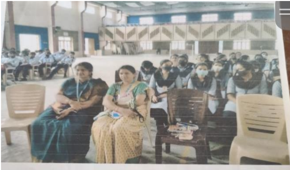
Slokas Competition in progress

Both the Sloka and Tambola Competitions were resounding successes, showcasing the diverse talents and interests of our student body. While the Sloka Competition celebrated our cultural heritage and linguistic traditions, the Tambola Competition provided a lively platform for recreational enjoyment and social bonding. Such events not only enrich the school experience but also instil valuable skills and values in our students. We look forward to organising more such events in the future, nurturing creativity, camaraderie, and cultural appreciation among our students.