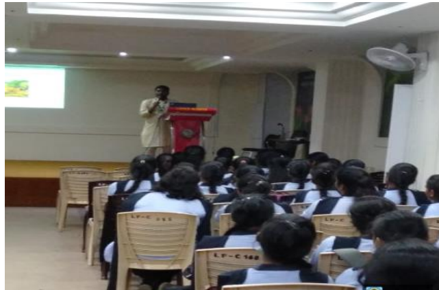
INTERACTIVE SESSION WITH PG STUDENT

The speaker also conveyed about the importance of great scholars of Sanskrit language and their contribution in the development & growth.