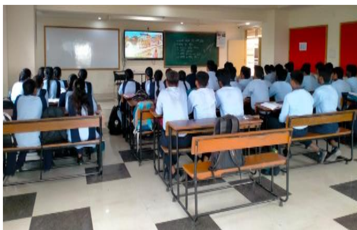
STUDENTS WATCHING MOVIE

Ganesh Chaturthi Movie Screening for Students. Screening a movie on Ganesh Chaturthi is a cultural celebration and educational opportunity for students. Celebrates the birth of Lord Ganesh, offering insight into Hindu customs. Films provide a window into Hindu mythology and contemporary relevance. Fosters unity and celebration among students. Offers enjoyment while connecting with the festival's spiritual aspects. Promotes discussions on themes and cultural insights post-screening. A Ganesh Chaturthi movie screening provides students with cultural enrichment, educational engagement, community bonding, entertainment, and opportunities for reflection.