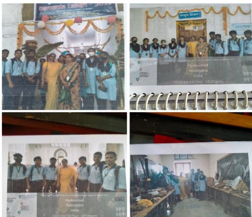
OU open day Book Exhibition

The Sanskrit Department along with students visited. OU open day on 24/03/22 Book Exhibition Was held for the benefit of the students to know about the famous writers Samsisit and journals basic Sanskrit grammar books. Professor explained the importance of Sanskrit language to Students and encouraged them to do masters in Sanskrit studies. They were excited to see the old models of the Indian culture & tradition flexes with valuable quotes that gave the inspiration to all improve their language skills.