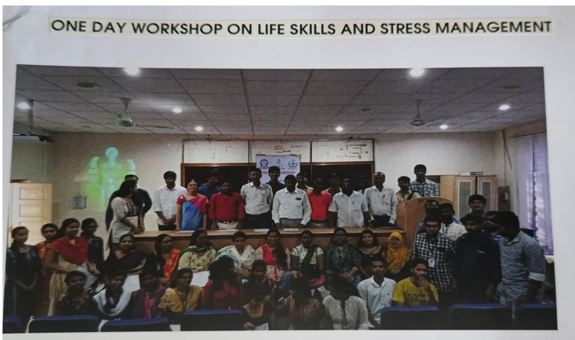
Student interacting with the resource person