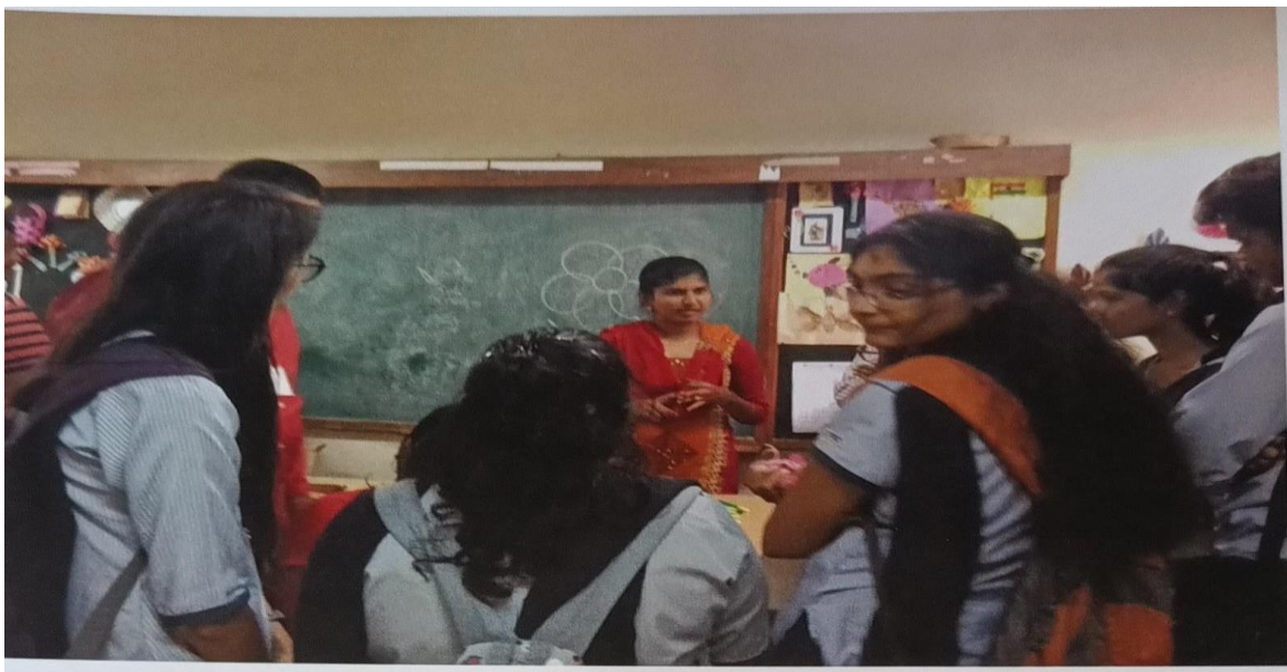
Students interacting with NIEPID students

The Faculty of Psychology conducted a field trip Students to NIEPID- HYDERABAD to draw connections among the theory and practice of learning and identifying the factors that cause intellectual disability and how they can be managed through practical exposure. By the end of the field trip Students learned that there could be hope in mentally retarded life as they are taught skills to be independent in their personal work.