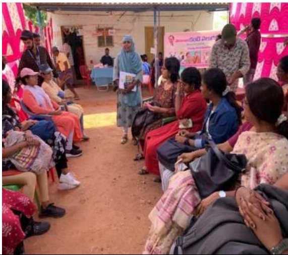
Gram Sabha meeting

The event aimed to teach about social responsibility and Gram Sabha functions. Participants learned about village infrastructure and the panchayat system. They understood how Gram Sabha works, fostering community involvement and local governance awareness. The event successfully met its goal of promoting social responsibility and educating about village governance.