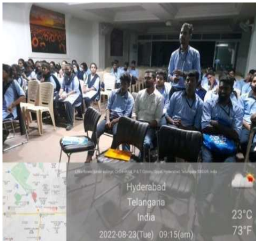
Student interacting post presentation.

The event aimed to educate students on the sole pathway to military service through the scheme. Students learned that participation in the scheme offers a unique opportunity to serve the nation for four years. Through presentations and discussions, attendees gained a deeper understanding of the scheme's significance in national service. The event successfully achieved its objective of enlightening students about this exclusive route to military service, emphasizing the importance of the scheme in serving the nation.