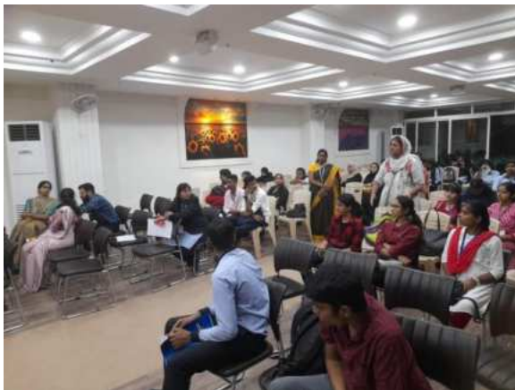
Students participating in a debate on “Impact of Social Media”

The event aimed to challenge students with illogical questions, fostering their ability to respond creatively. Participants learned that absurd comments often serve as comic relief. This helped them grasp the purpose of humor in different situations. Through debates, they practiced defending their viewpoints in unconventional scenarios, enriching their communication skills and critical thinking.