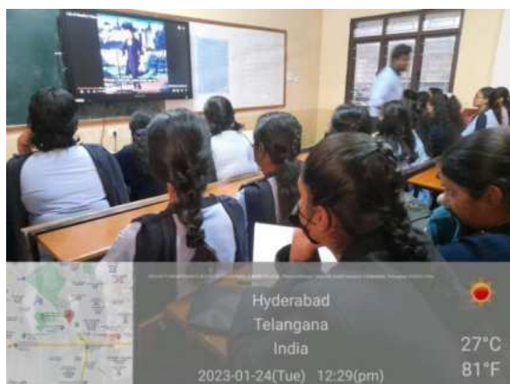
Students watching a video of St. Montfort Life

The event sought to introduce students to the life and legacy of the founder of Montfort school. Through activities like watching a video on St. Montfort's life and participating in a skit based on his story, students gained valuable insights. They learned to believe in themselves and their ideas, as well as the importance of helping others in need. The event provided inspiration and encouraged students to embody the values exemplified by St. Montfort.