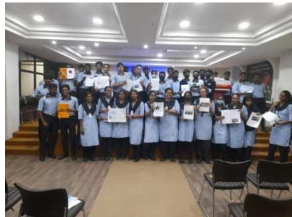
A group picture of the participants and their reports.