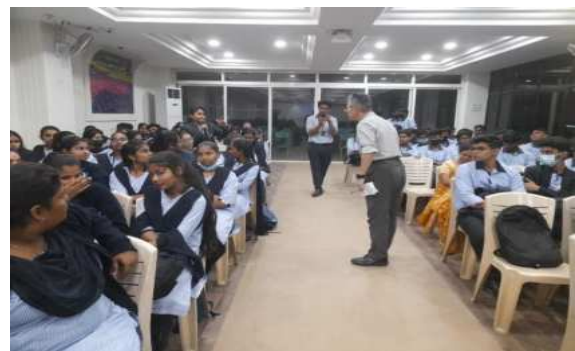
Interaction with the students