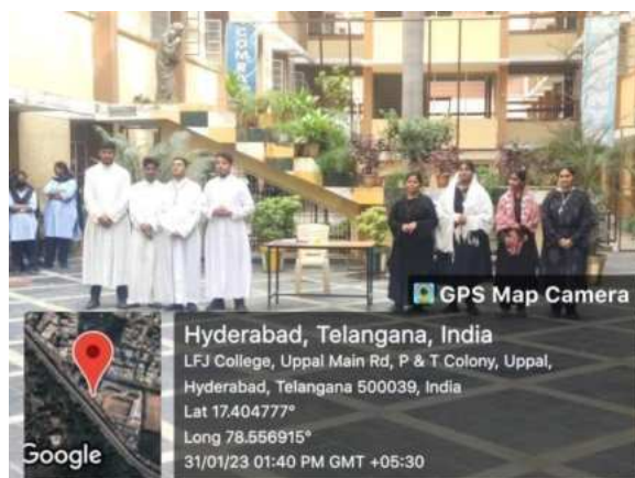
Skit based on the life of St. Montfort