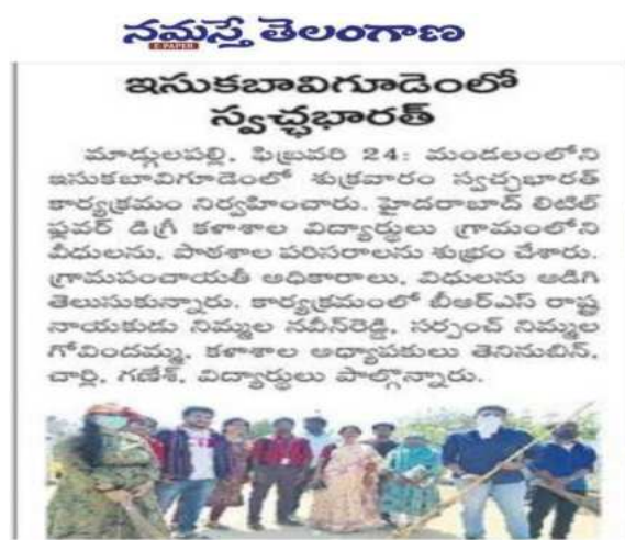
Newspaper clip of students engaging in Swachh Bharat Abhiyan.