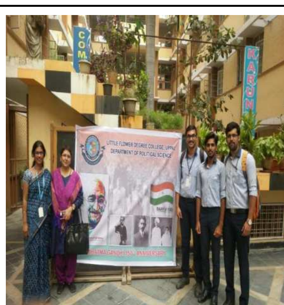
A team picture of the students with the guest.