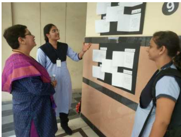
Students explaining their poster to the guest.

Managed by Brothers of St. Gabriel Educational Society