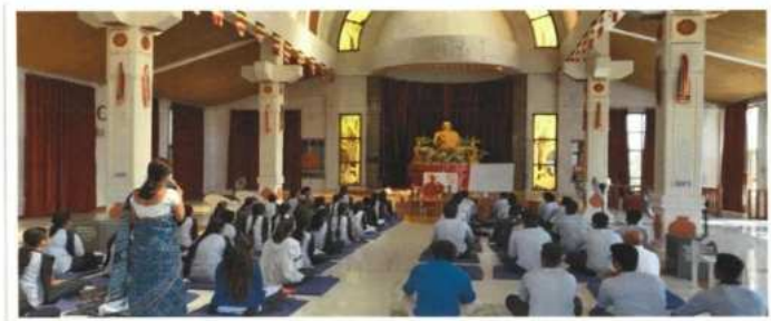
QUESTION AND ANSWER SESSION.

The Department of Political Science, undertook a field trip to Buddha Vihara situated at Mahindra Hills with the students of BA-2 and BA-3. The main motive of this visit was to provide a firsthand experience to the students with regard to Buddhism and its place of worship. As it was a part of the syllabus, it was necessary for the students to gain more knowledge about Buddhism, a religion born in India. All procedures were followed, right from making students aware of the rituals to be followed in the monastery to paying respect to the monk. The students had spiritual experience and also learned about the life and times of Lord Buddha. The monk made the students meditate as it was a part of the monks' daily rituals. Later the students were invited to a simple but delicious lunch by the monastery. The students also donated essential groceries to the monastery which was duly appreciated by the Monk.