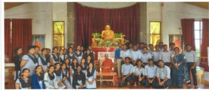
A GROUP PHOTO OF STUDENTS WITH BANTHEJI.