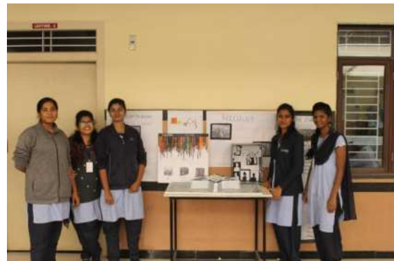
Students displaying their posters.