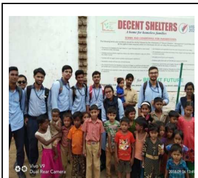
Students with Children in Camp

When the students left the camp, they were filled with empathy for the refugees and understood how fortunate they were to have a country of their own as well as understood the feeling of being unwanted.