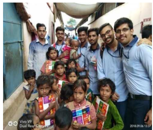
Students distributed stationery to children