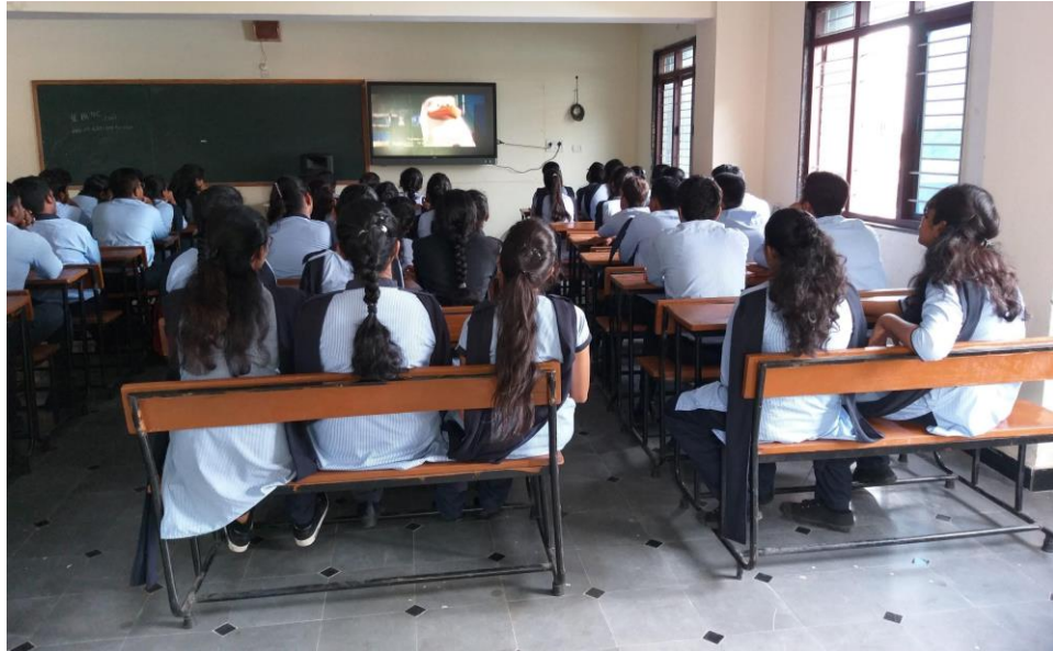
French Students enjoying French movie - Storks

Managed by Brothers of St. Gabriel Educational Society