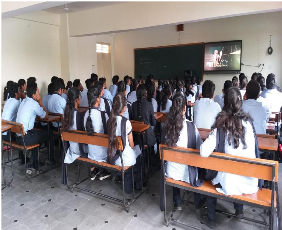
French Students enjoying French movie - Storks