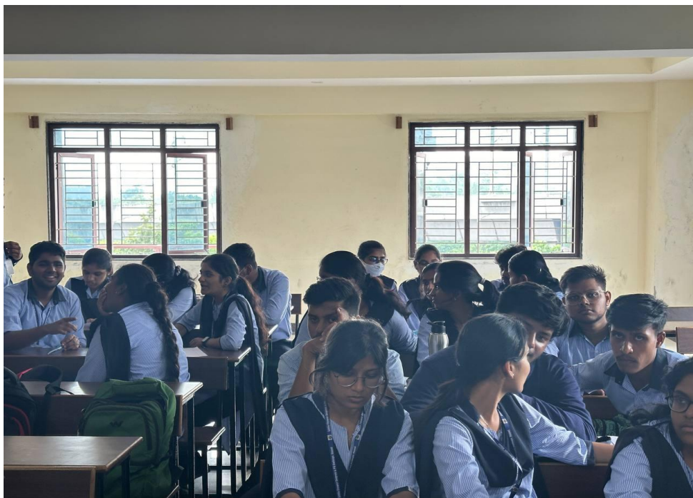
French Quiz - participants