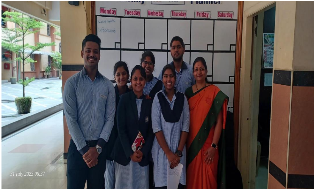
French Prayer team - Bastille Day Celebrations

Managed by Brothers of St. Gabriel Educational Society