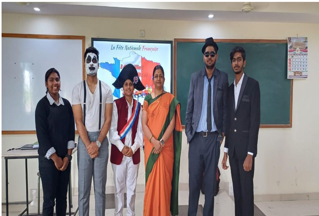
Group photo with the famous French Personalities - Bastille Day Celebration