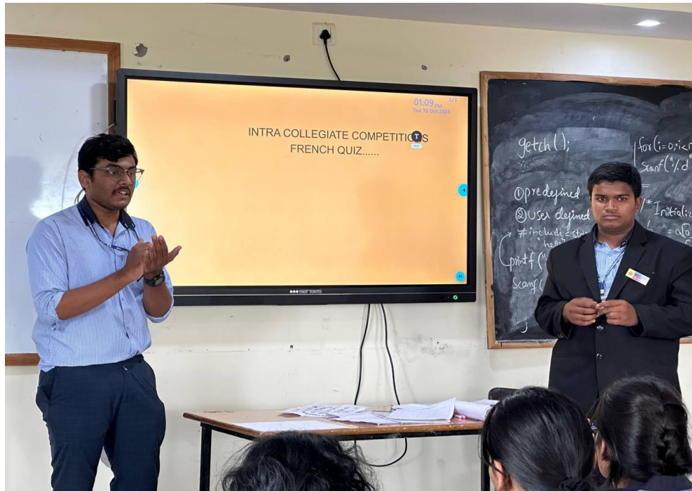
French Quiz Competition - Intra collegiate competitions 2023-24

Managed by Brothers of St. Gabriel Educational Society