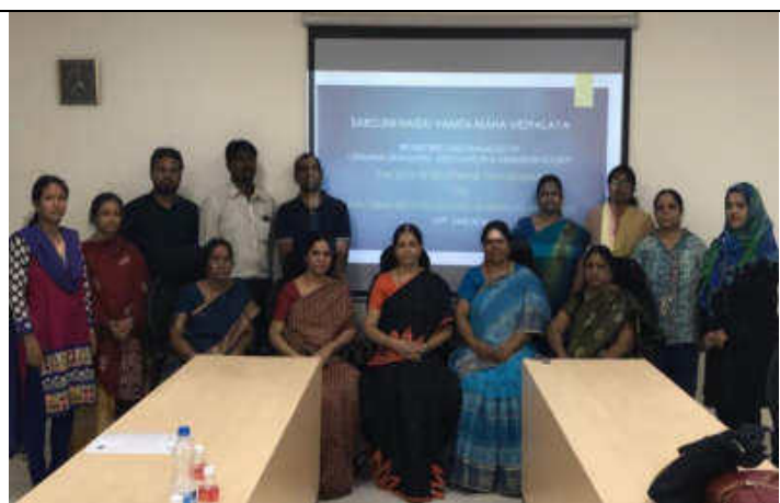
Group Photo of lecturers who attended FDP