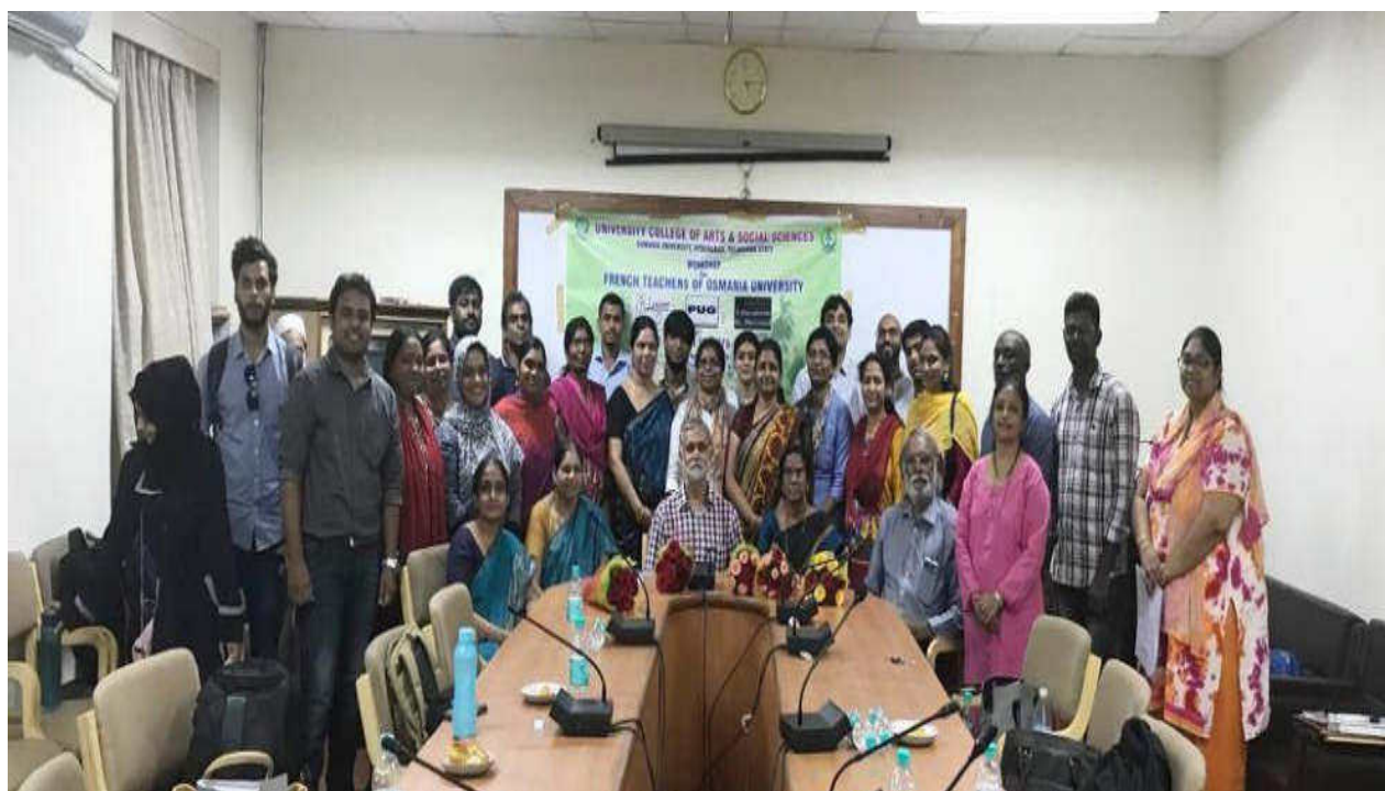
Group Photo of the participants who attended the workshop

Managed by Brothers of St. Gabriel Educational Society