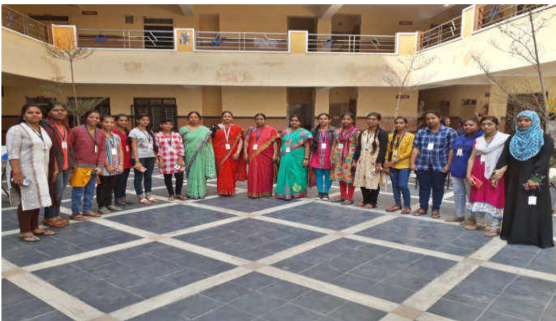
Group Photo with the students & the lecturer from St Pious Degree College

The second languages department has organized a Model and Charts Exhibition based on the theme “Languages and their Diversity”. The students have made models and charts like Les Monuments – La Tour Eiffel, Le Château de Versailles, Une Église; A boutique showing about French fashion; Le Théâtre – about French movies; models of different types of cheese and wines; La salle de classe – Le système éducatif en France; La Rue – les directions et les magasins français; La maison françaises; Les Bandes – Dessinées – Les Smurfs, Asterix et Obelix. The students prepared the models and charts very enthusiastically in groups and by this activity they learned new vocabulary, culture and civilisation of France. The students of the college, Vice-principal and Principal visited and appreciated the works done by the students. Other College “St Pious Degree and PG College ” lecturers and students have visited the exhibition and appreciated the work and were inspired by the work done by the students. They had an interactive session with the students also.