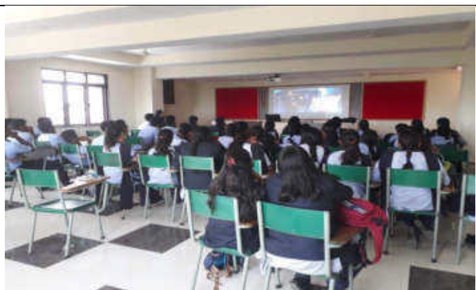
Students enjoying Coco Movie