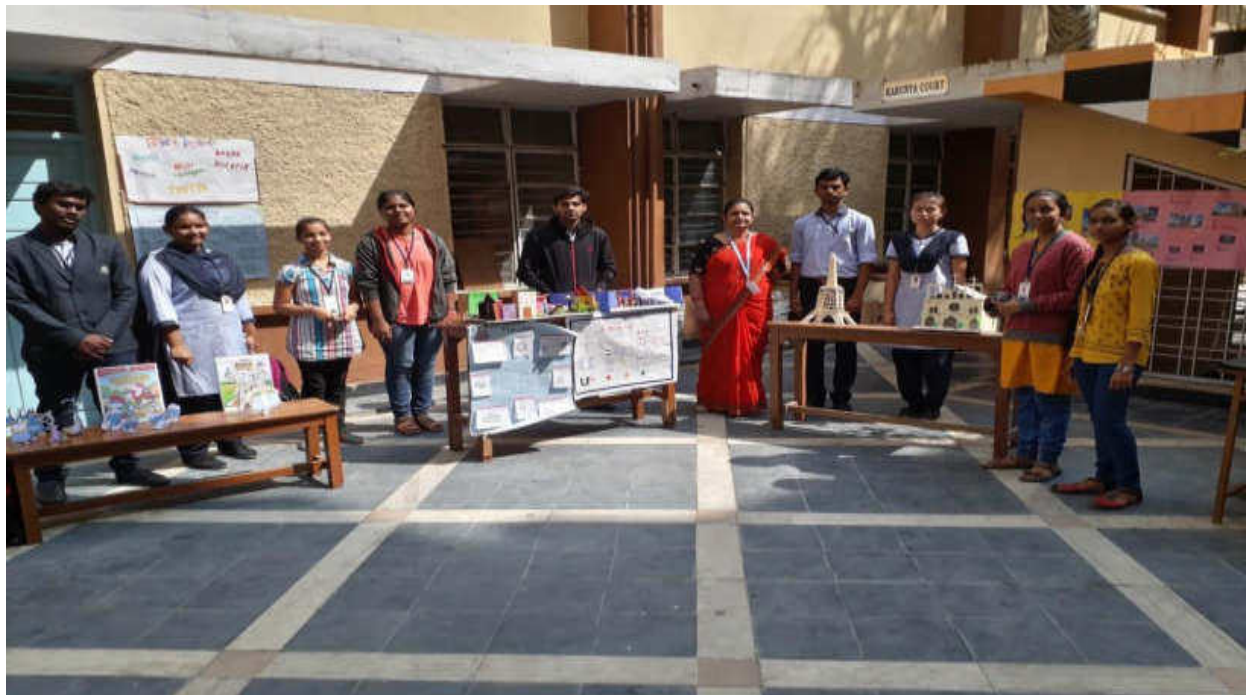
Photo with St Pious & LFDC Students