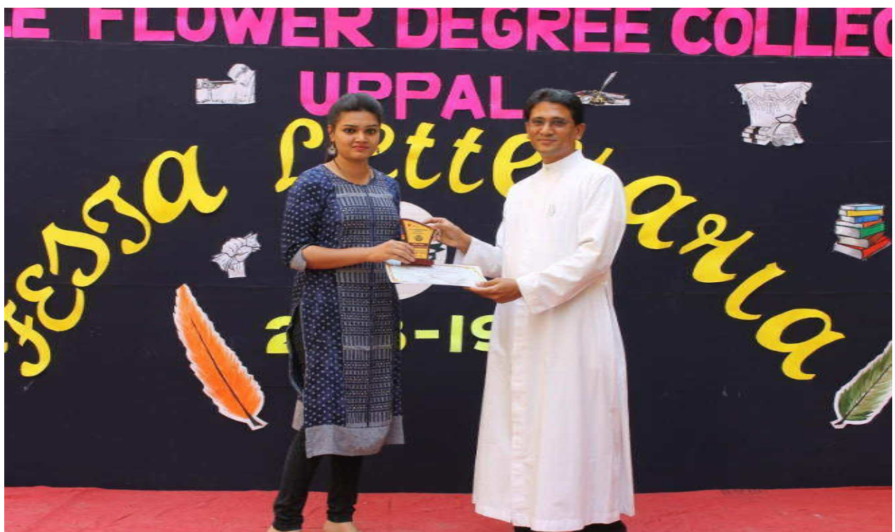
French Solo Singing 2nd prize winner