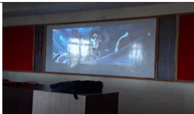
Screening of Le Coco Movie

This was an overwhelming experience for the students as they enjoyed the film.