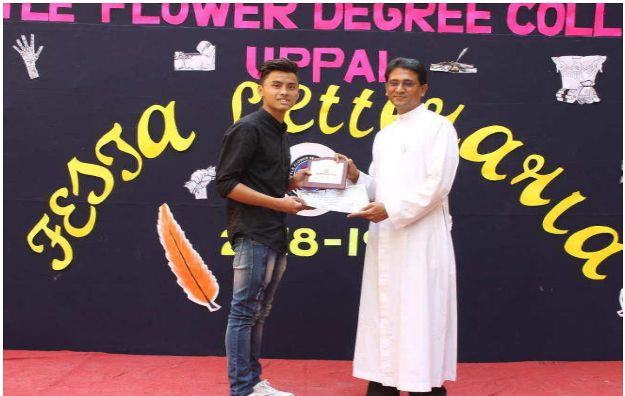
French Solo Singing 1st prize winner

Managed by Brothers of St. Gabriel Educational Society