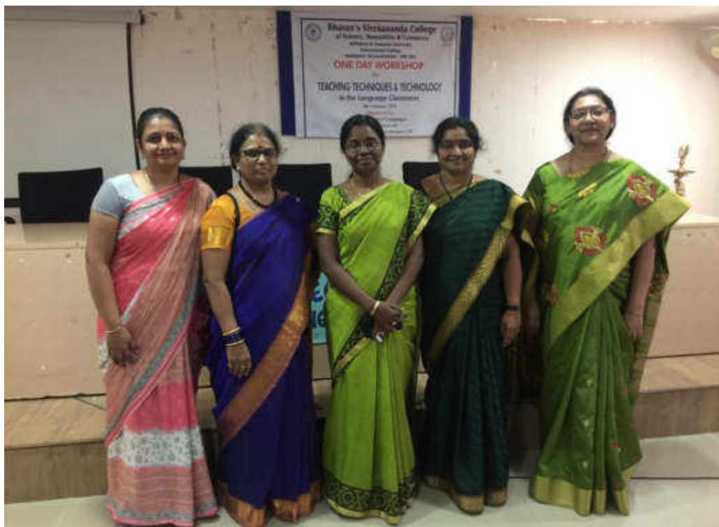
Photo with the language lecturers & VP of Bhavans Vivekananda College

Managed by Brothers of St. Gabriel Educational Society