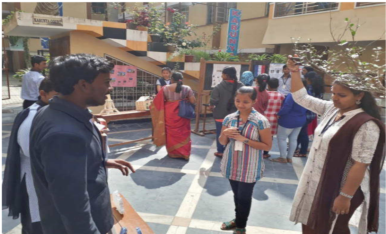
Lecturer & students observing the models in the exhibition