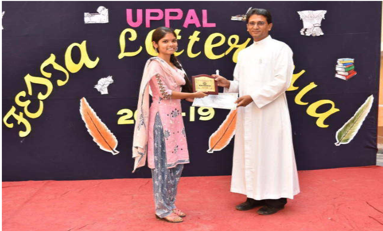
Memory Word Building 1st prize winner

Managed by Brothers of St. Gabriel Educational Society