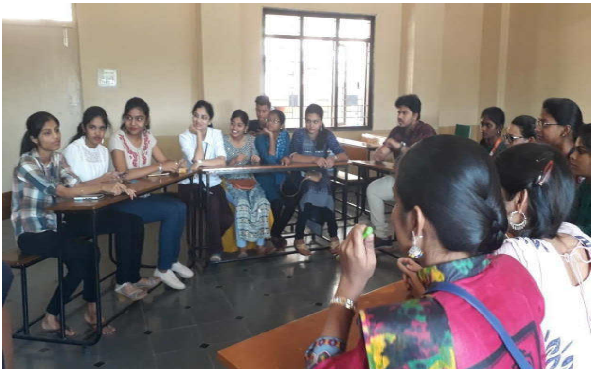
Memory Word Building Competition