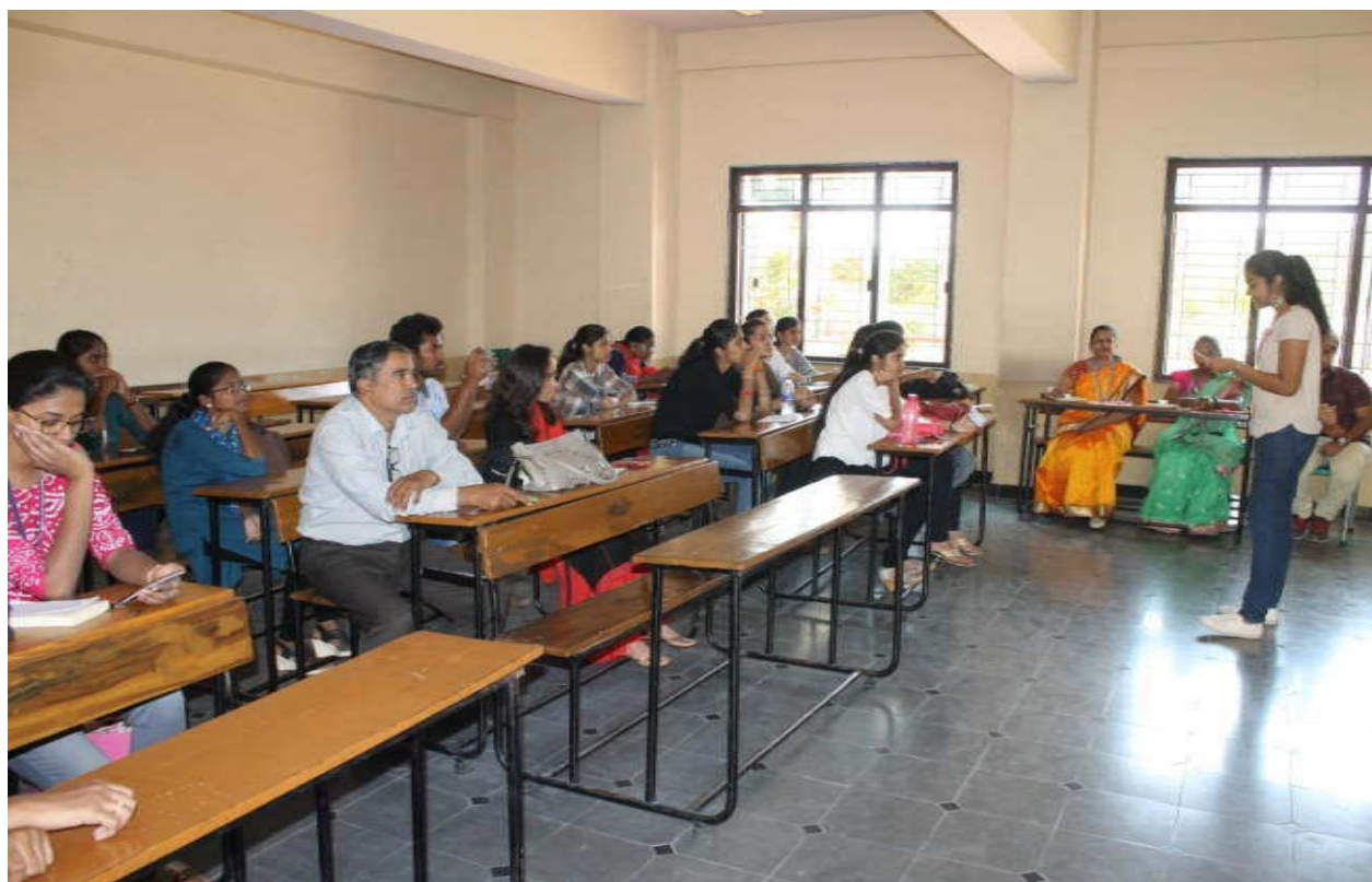
French Solo Singing Competition