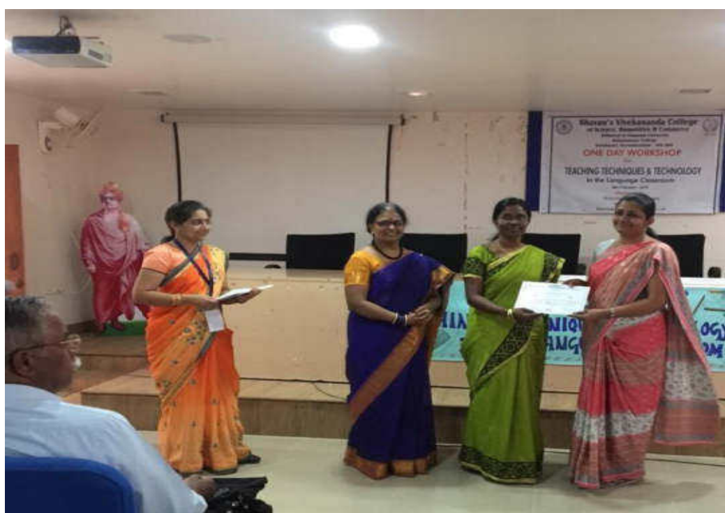
Ms Harini receiving certificate for attending one day workshop