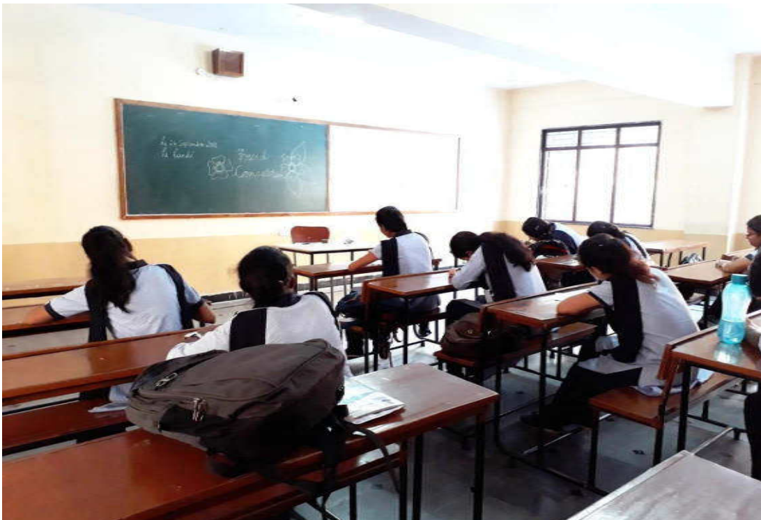
Students Actively Participating in The Intra Collegiate Competitions