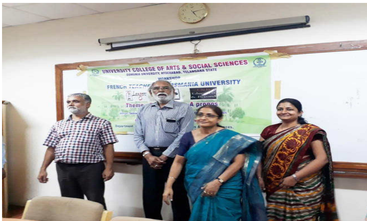
Photo with resource persons

Managed by Brothers of St. Gabriel Educational Society