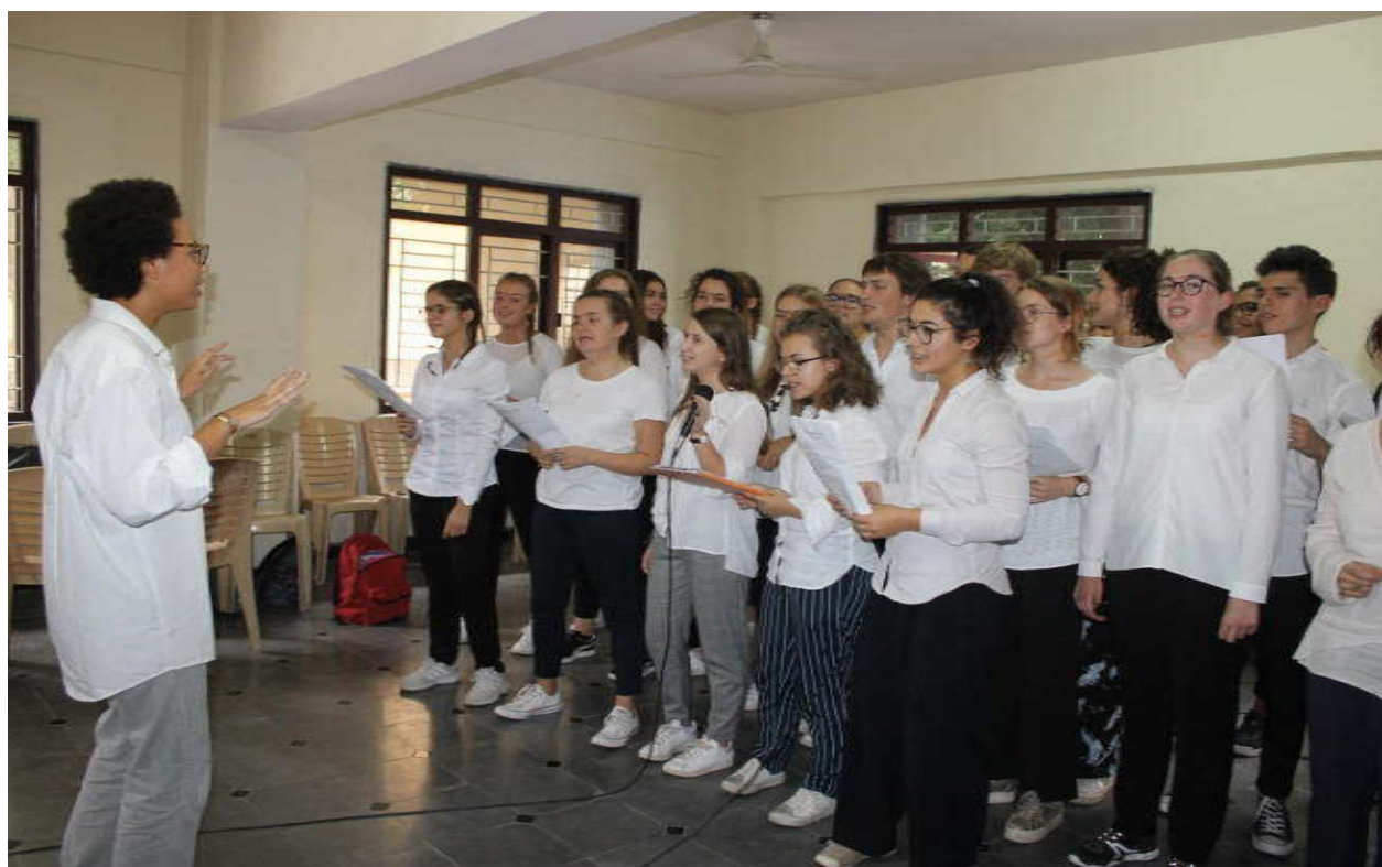
France Students Performing French Group Song

Little Flower Degree College had invited and welcomed a batch of students who had come from France on 2 nd November 2018 at 10: 30 AM. With warm greetings and love the students welcomed them and entertained the guests with a plethora of events like traditional dance, singing and fun games. The event started with a prayer song and a prayer in French. Later on, a traditional folk dance was displayed to the guests. Moving on, few songs were sung by the students in regional languages which were applauded by the guests. After that, many fun and challenging games were conducted by the students to entertain and also, to test the capabilities of students. The students had a brief interactive session with guests about the culture and diversity of respective nations. Finally, the female guests were provided with Mehendi and nail art of Indian origin.