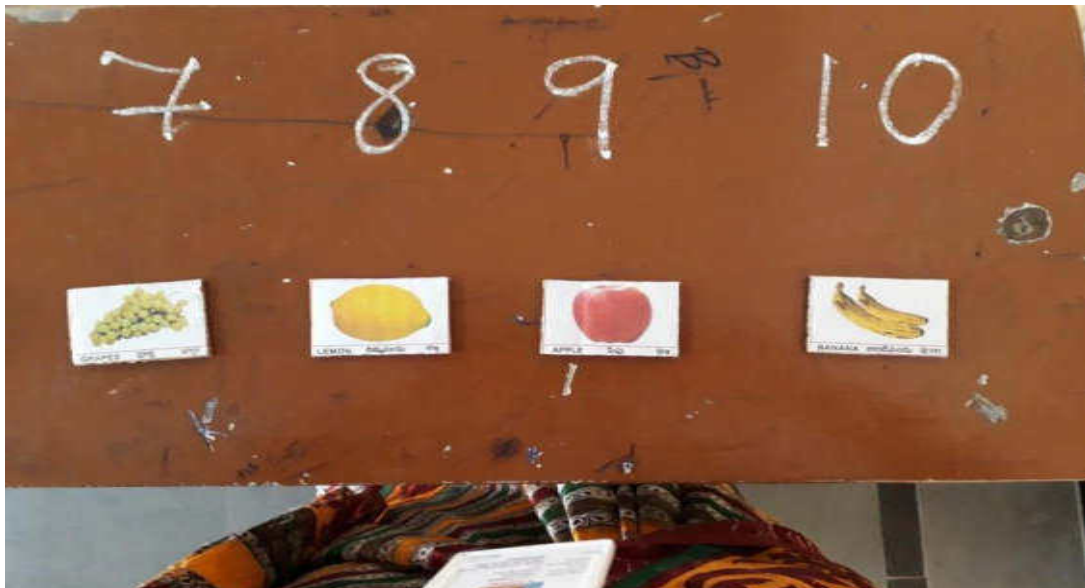
Pictures Displayed to students for The Picture Recognition Competition