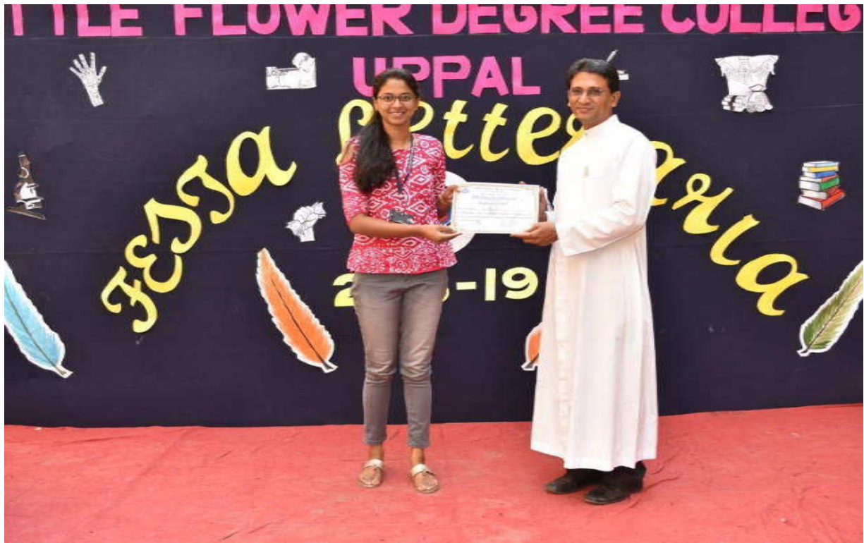
Memory Word Building 3 rd prize winner

Managed by Brothers of St. Gabriel Educational Society