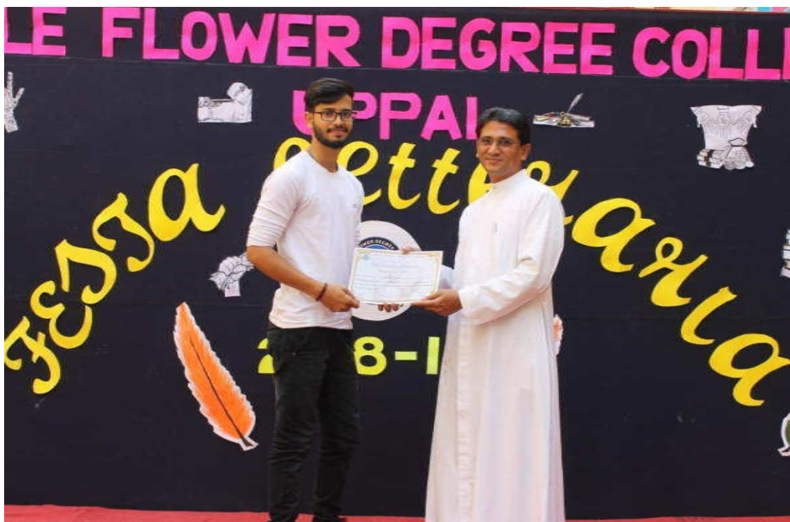
French Solo Singing 3 rd prize winner

Managed by Brothers of St. Gabriel Educational Society