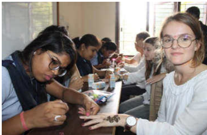
France Students enjoying mehndi and nail art

Managed by Brothers of St. Gabriel Educational Society