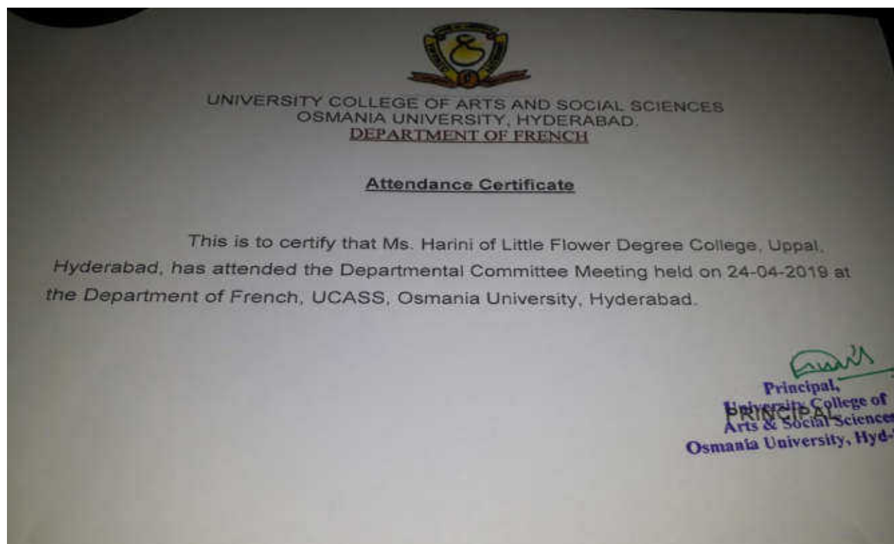
Attendance Certificate for attending departmental meeting

A departmental meeting was conducted by Ms Chira Sri Bandopadhyay (HOD French, OU) which was attended by all lecturers of OU affiliated colleges having French to discuss about the syllabus and evaluation of the viva – voce and semester examinations papers, and also about the allotment of duties to the lecturers as external examiners to all the affiliated colleges. The dates of the examination for different colleges were allotted.