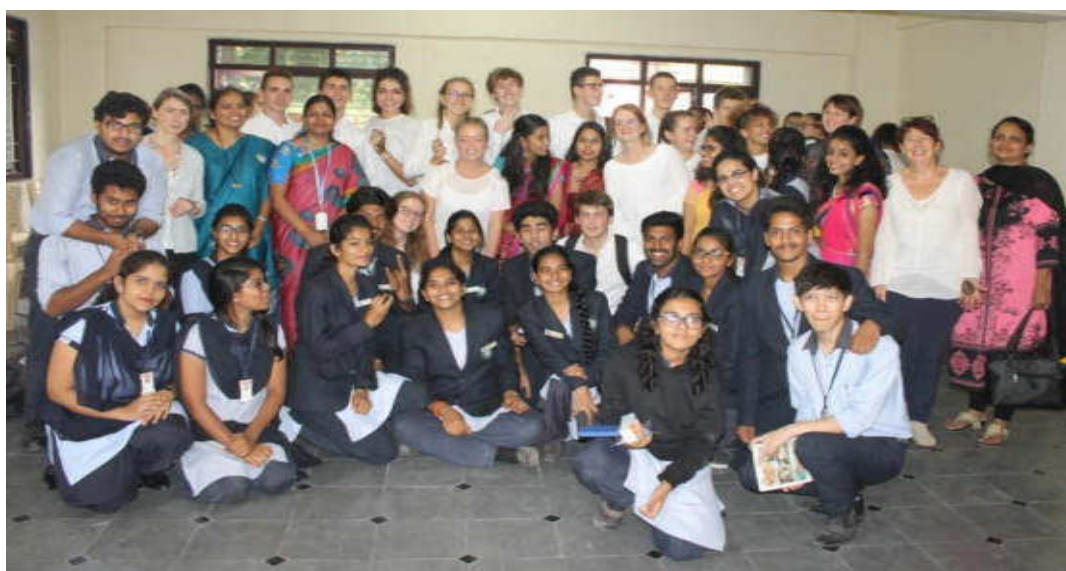
Group Photo taken during the visit of students from France