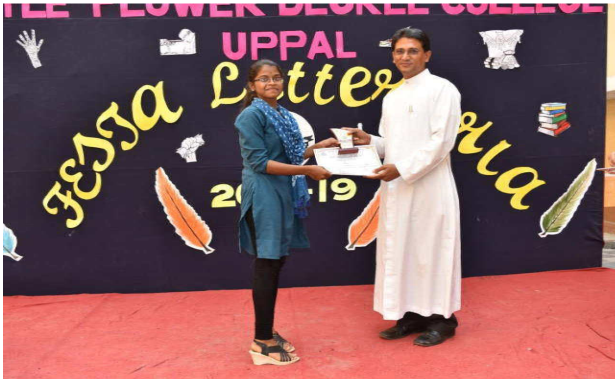
Memory Word Building 2 nd prize winner