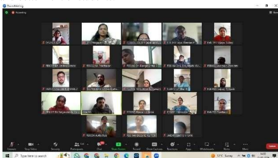
Screenshots of the webinar

The faculty members attended the online program and understood the importance of holistic education, within the purview of India-centric ethics and human values. They understood the significance of how the Indian Knowledge System can be applied in real life for the advancement and betterment of students.