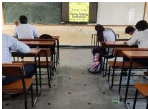
Poetry Day Competition