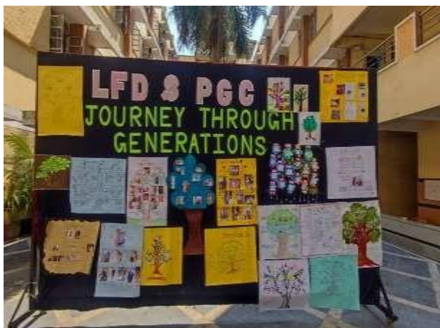
Ancestral histories exhibited by the students

On October 12th, the Faculty of English hosted "Journey Through Generations" at Karunya Court, featuring a Family Tree Exhibition. Students presented meticulously crafted family trees, showcasing their ancestral histories through photos, descriptions, and drawings of their forebears' achievements. The event aimed to unite familial bonds across generations and celebrate the diverse narratives within our community. With an inspiring opening ceremony, attendees were captivated by the displays, offering an immersive journey through cultural diversity and traditions. The exhibition achieved its goal of revealing cultural richness and fostering unity among participants, providing profound insights into family legacies.