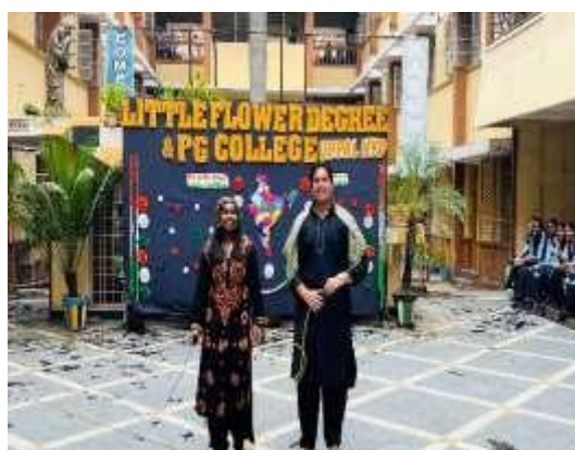
Students representing Kashmir