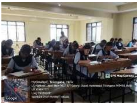
Students writing their poetry

The Faculty of English hosted a Poetry Writing Competition on the 13th of March in room numbers P42 & I41. With 50 students participating, the event aimed to inspire creativity and foster appreciation for poetry. Participants were given 30 minutes to write their poems on any topic, resulting in a diverse range of styles and languages. The competition successfully achieved its objective of promoting creative expression among students.