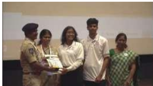
Receiving the certificates & Memento