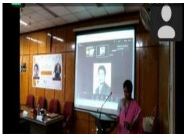
Organisers at St. Anns Degree College