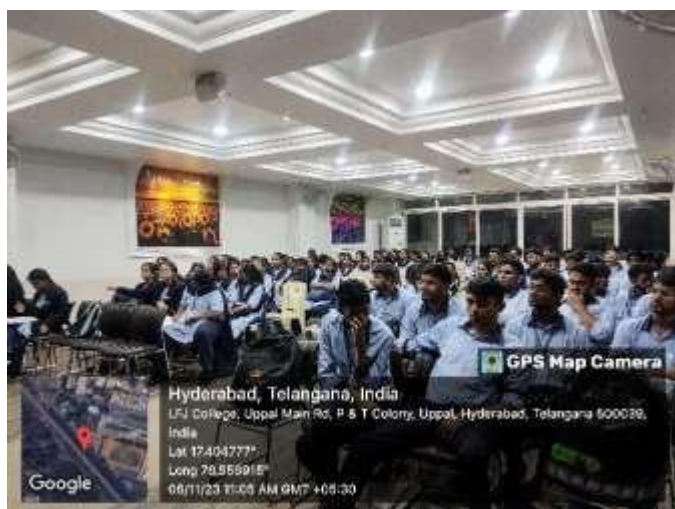
Students at the Montfort Hall