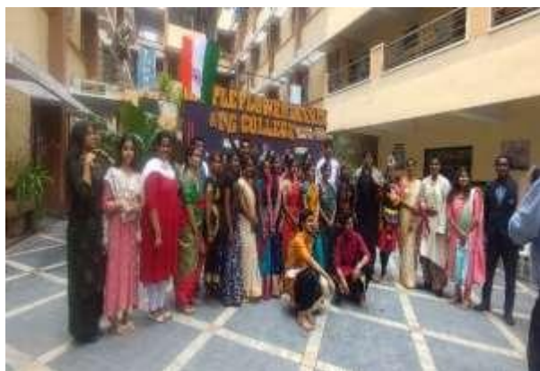
Students participated in Cultural Show

The Cultural Show was a grand success, leaving a positive mark on all attendees' hearts and serving as a reminder of the beauty of diversity. The event concluded with a heartfelt rendition of the National Anthem, fostering a sense of patriotism and unity.