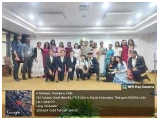
Students at the Valedictory

The faculty of English celebrated English Language Week, to commemorate the birthday of Shakespeare, the literary giant, on 23 rd April. It was a week-long festivity of the language's beauty and significance celebrated from 16 th to 23 rd April 2024. From engaging competitions to cultural presentations, each day was filled with activities that highlighted different aspects of the English language. Students participated enthusiastically, showcasing their language skills, creativity, and cultural appreciation. The week served as a reminder of the importance of English in communication, literature, and global understanding, leaving a lasting impact on all participants.