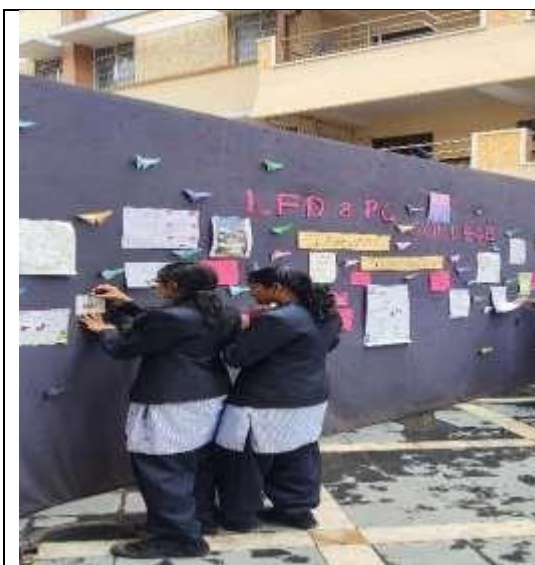
Students pinning their expressions to the screen

The event facilitated open communication and further exchanges of gratitude and experiences, strengthening the bonds within the academic community. Even teachers expressed their heartfelt gratitude, adding to the poignant celebration of Teacher's Day. Overall, "Eloquent Expressions" served as a touching tribute to dedicated educators and highlighted the enduring connections they build with their students.