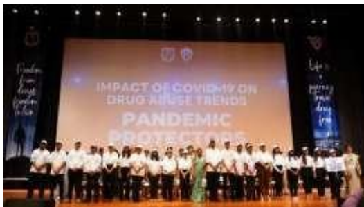
Students on the stage of Bits Hyderabad

The Anti-Drug Summit held at BITS Pilani, Hyderabad on 10th February 2024 aimed to raise awareness about drug abuse among teenagers and young adults. Students of LFDC took part in the summit by presenting their PowerPoint, “Impact of COVID on drug abuse trends - PANDEMIC PROTECTORS”. The objective was to educate participants about the dangers of drug addiction and equip them with knowledge and resources to make informed decisions. Through engaging discussions, presentations, and interactions with experts, the summit provided valuable insights into the changing patterns of drug abuse during the pandemic. The outcome of the event was a strengthened resolve among participants to combat drug addiction in their communities. The summit served as a platform for collaboration between students and law enforcement agencies, contributing significantly to the collective effort to create a drug-free society.