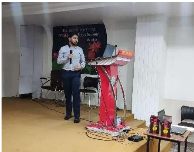
Psychologist addressing the faculty