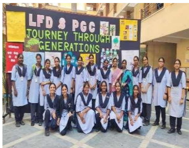
Students at the Karunya Court