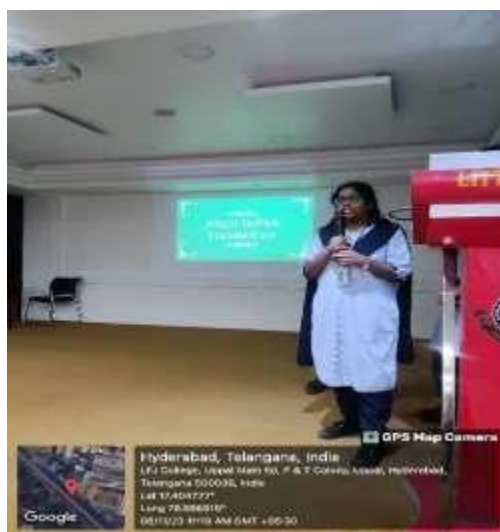
Student presenting the PPT