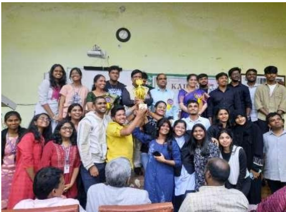
Students of LFDC receiving the Overall Kairos Fest Championship at OU