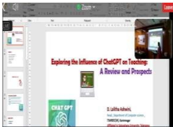
Session by a professor