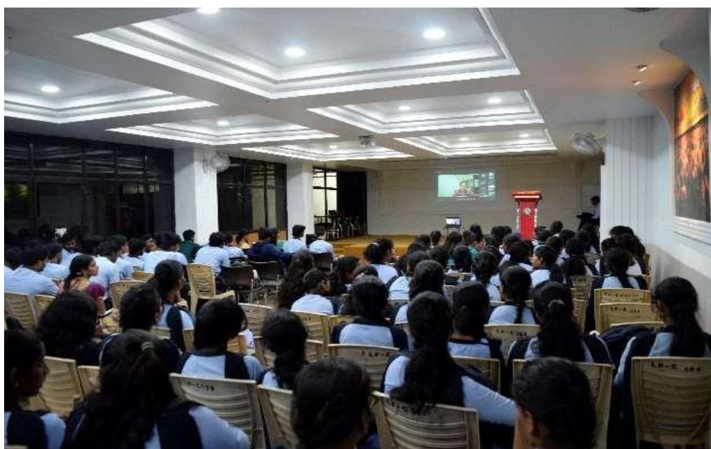
Students paying attention to the lecture