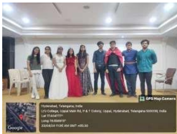
Students after performing 'King Lear' drama