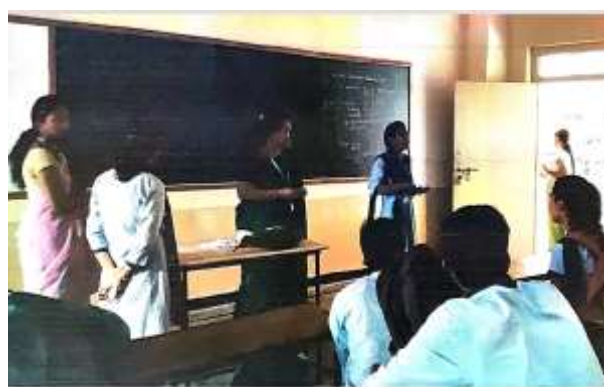
Students actively took part in Jam session