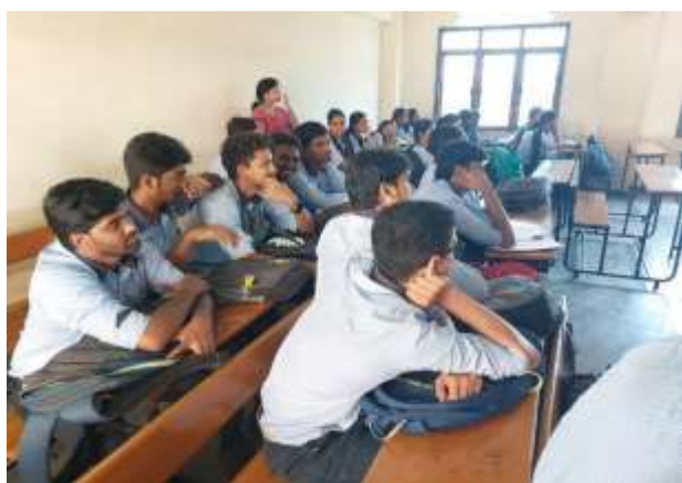
Students interacting with each other

Day 2 explored the role of eye contact and other non-verbal signals. Role-playing scenarios helped students grasp the impact of eye contact in different contexts. Pair and group activities enabled them to practice interpreting non-verbal cues. The workshop ended with a reflective session, highlighting significant improvement in students' non-verbal communication skills.