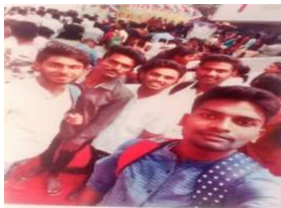
LFDC students participated in various events in Jhankrut 2K19 at Avanthi Degree College.