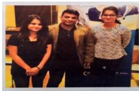
Students of LFDC attended the Global education seminar