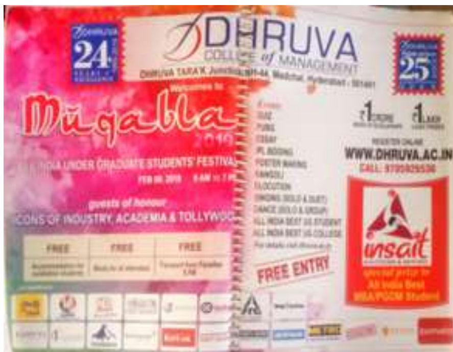
Poster of Muqabla - All India Students' Festival