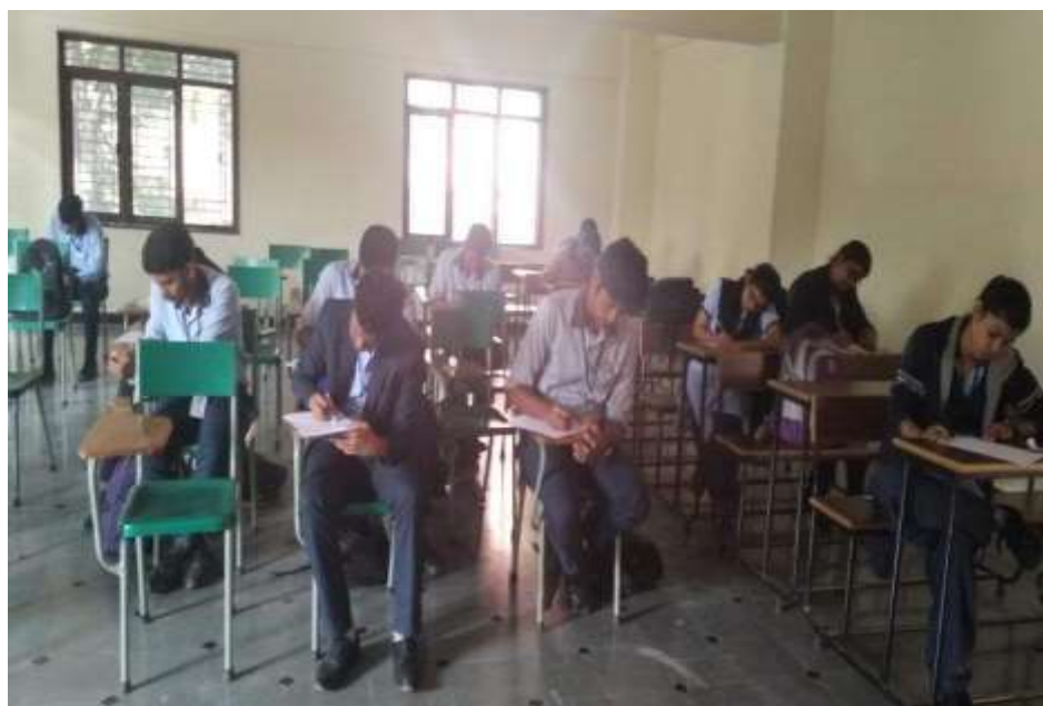
Student participants writing their views on the given prompts

“Sew a Tale”, a writing competition was conducted by the Department of English. Students of I and II years from various courses have participated enthusiastically. They were given the prompts and they had to expand them within the stipulated time. The Prompts were “How should I forget to think about....”; “The best feeling is to know...” and so on.