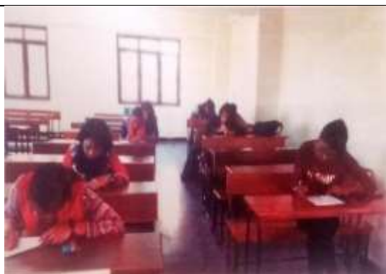
Students of various colleges participating in the Competitions

The event concluded with a Valedictory Ceremony where winners received shields and certificates, while all participants were honoured with participation certificates.