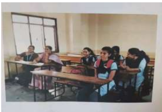
Judges listening to the JAM session