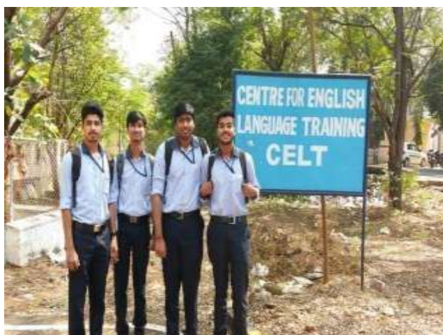
Students visiting the Centre for English Language Training (CELТ)

After interaction with the lecturer, the students were engaged in an activity or game session conducted by the management of the university. This game was a puzzle based on logical thinking which the students were asked to solve. Soon after the activity session, they were called for another interesting session where each one of them was given a computer system and was told about the software that was used for this session. This software was built to learn and improve their pronunciation and grammatical skills. Every student was given headphones and was asked to use the software. This software taught them about the pronunciation of different words and the stress on syllables.