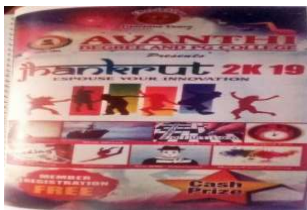
Poster of Jhankrut 2K19 from Avanthi Degree College.

Various Literary and Cultural competitions were held at Avanthi Degree College on 6 th February 2019. The event commenced at 10 am and was wrapped up by 5 pm. The event started with an inaugural consisting of inspiring words from the Principal, Chief Guest and the Guest of Honor. The inaugural was followed by the events held by various departments like Commerce, Arts and Science. Competitions ranging from the 'Courtroom debate' to 'mime' and 'solo singing' were conducted in which many students from various colleges participated to prove and showcase their talents. Many students from Little Flower Degree College also participated in a plethora of events and bagged many prizes.