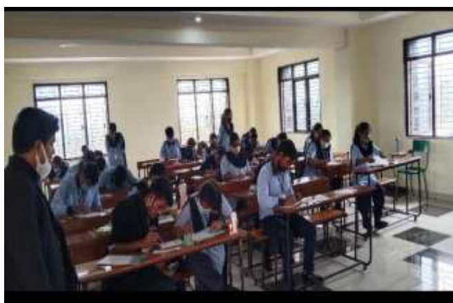
Students working on a given handout