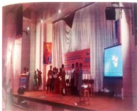
Student receiving prizes at Vivekotsav