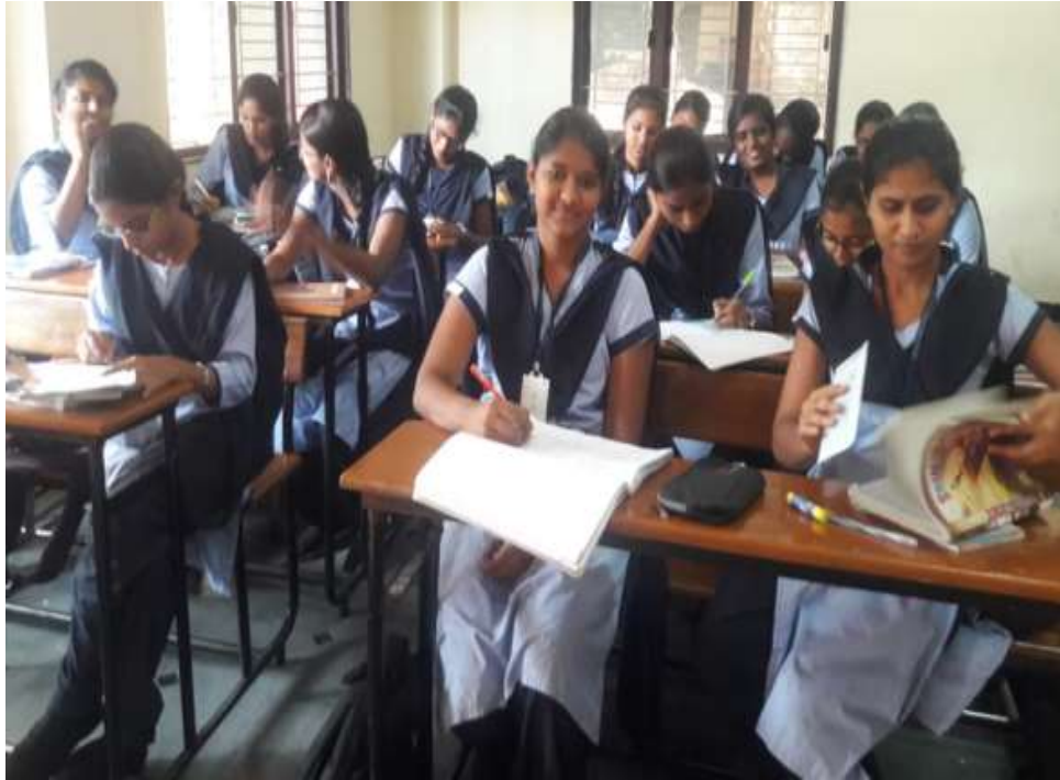
Students are encouraged to write handwritten letters

Managed by Brothers of St. Gabriel Educational Society