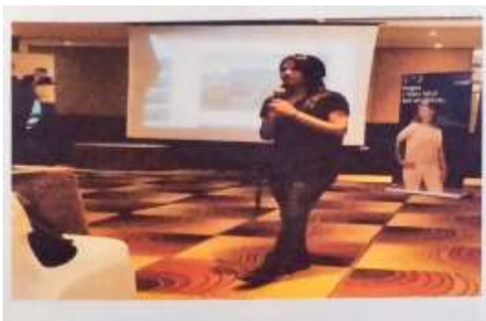
Student expressing ideas on global education