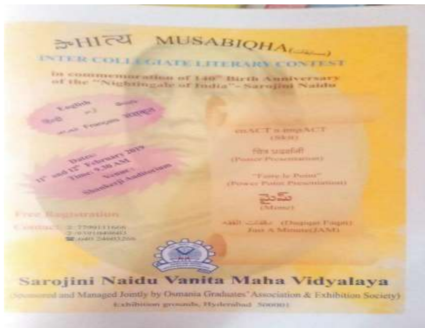
Poster of the event 'Musabiah' at SNVM, Hyderabad