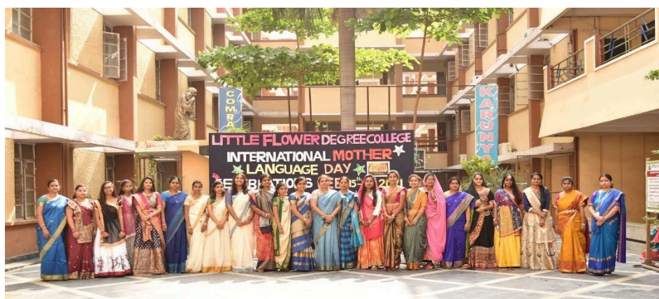
Students wearing traditional dresses of different states on ethnic day as part of international mother language day celebrations