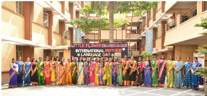
Traditional dresses worn by students on Ethnic day as part of international mother language day celebrations

Managed by Brothers of St. Gabriel Educational Society