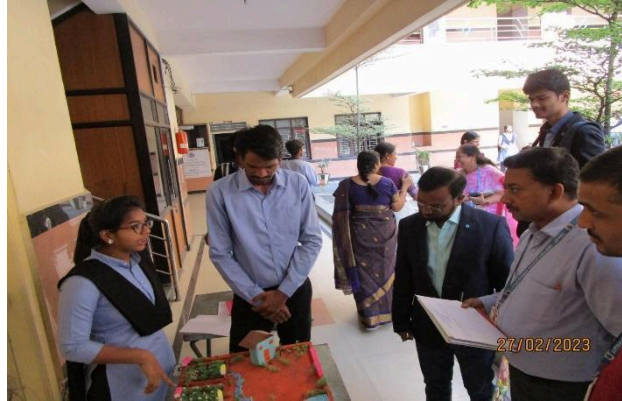
Students explaining their models

Managed by Brothers of St. Gabriel Educational Society