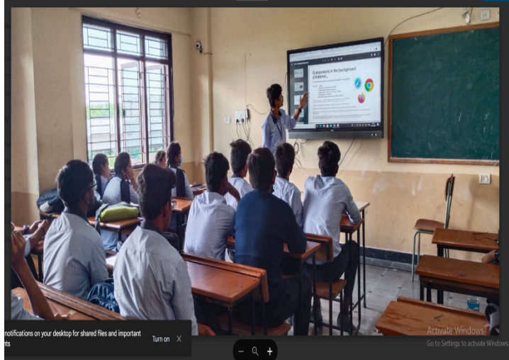
Student teaching about internet and its connection

Managed by Brothers of St. Gabriel Educational Society