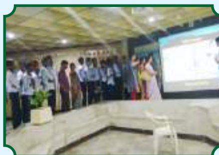
Students at CCMB