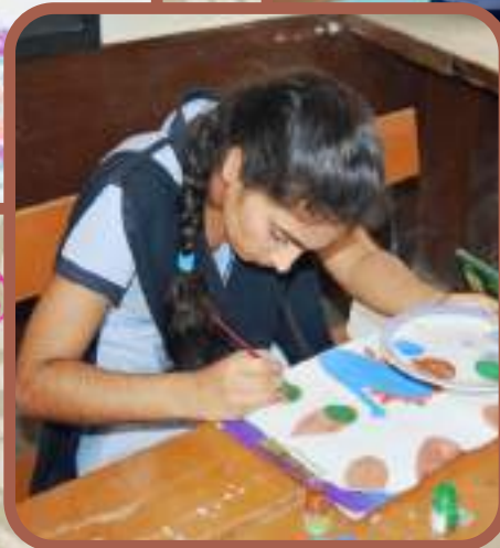
Students displaying their creativity