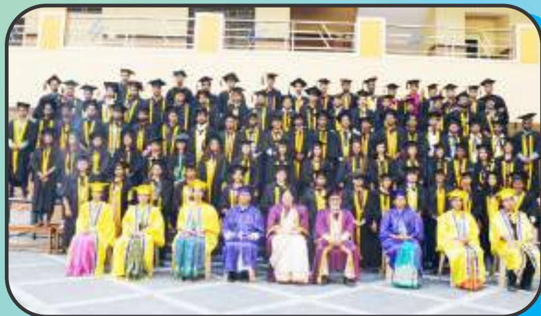
Dignitaries along with the graduates