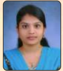
Jyothi III BSC BTMC