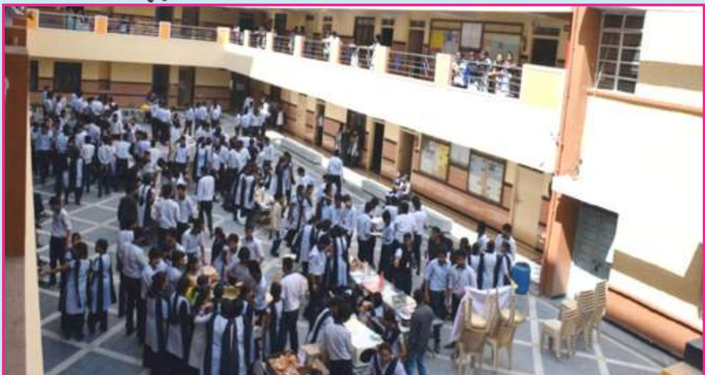
Students Participating in "Learn to Earn"