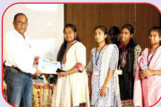
Students Receiving Best poster award and Dr.K.V Rao Scientific Society Cash Prize