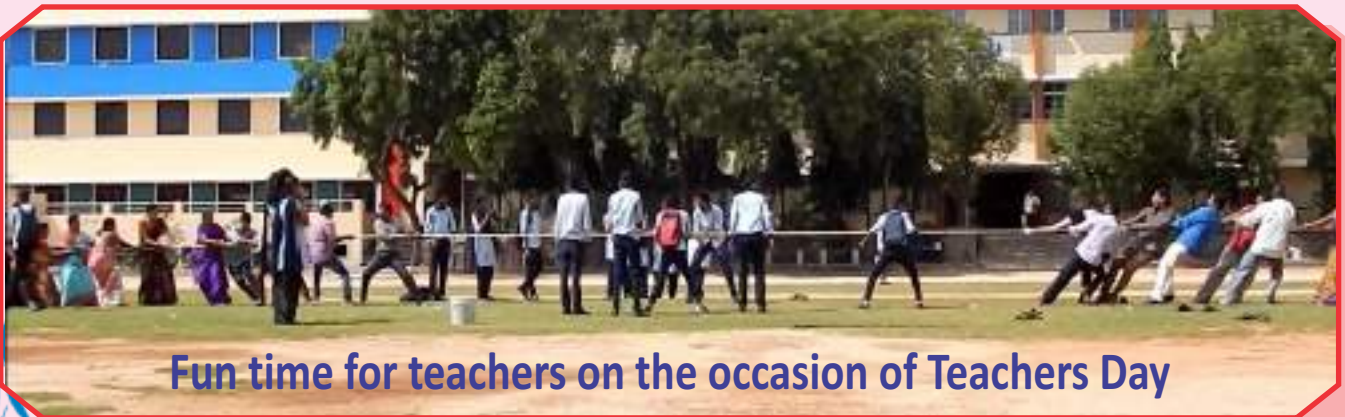
Fun time for teachers on the occasion of Teachers Day

The students of LFDC celebrated Teachers' Day with great fervor and enthusiasm. They arranged a few recreational events like throw ball, tug of war, badminton, tennikoit and musical chairs. The winners of the games were felicitated and gifts were presented to all the teachers for their commendable effort, encouragement and endurance which is always remembered and appreciated.