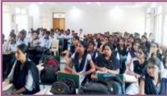
Students listening to the tecture