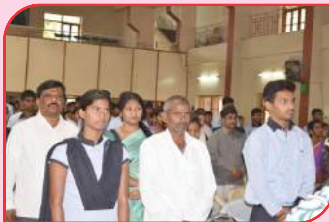
Parents & Students listening to Principal's address.