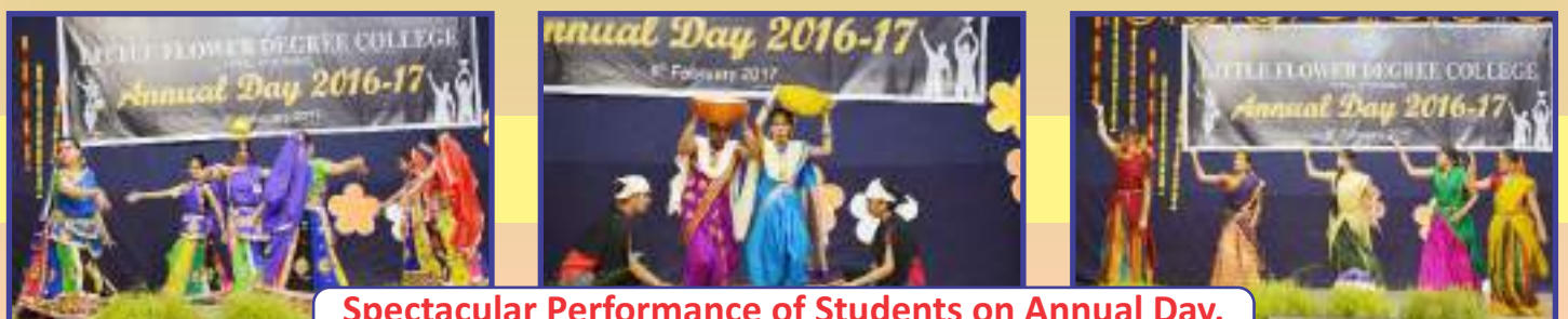
Spectacular Performance of Students on Annual Day.