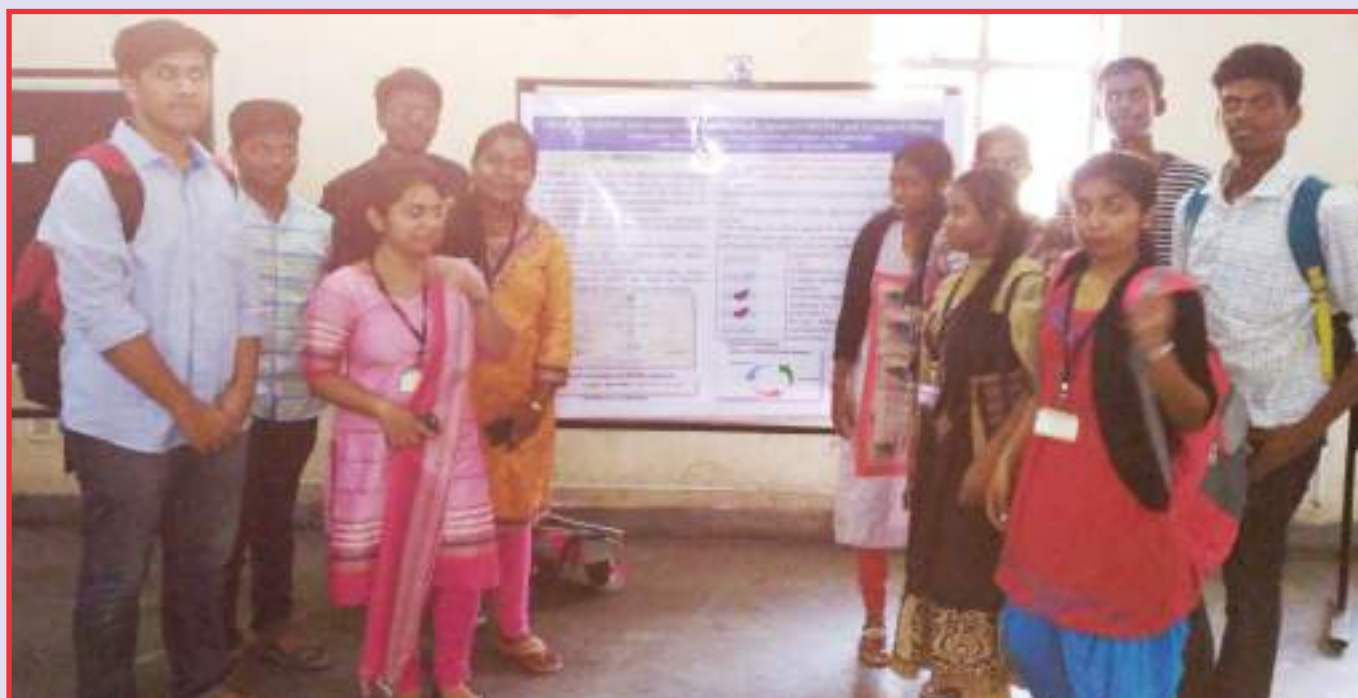
Students displaying their poster at conference venue