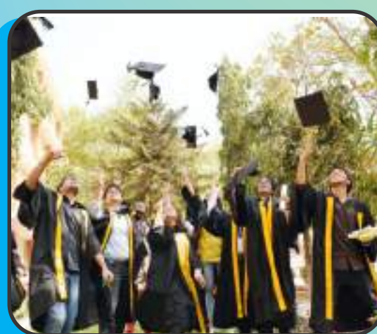
Students celebrating the completion of graduation.