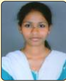
B. Madhuri III BCOM CS