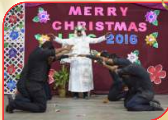
Students performing Skit

The college was attractively decorated to accord due prominence to the occasion – Brightly decorated Christmas tree and the setting up of the Nativity scene which included the manger, and numerous nativity figurines to reflect upon the simplicity and humility of Christ's birth. The entire stage was festooned with colorful streamers and beautiful decorations. Overriding every other emotion, a wave of cheer enveloped the college.