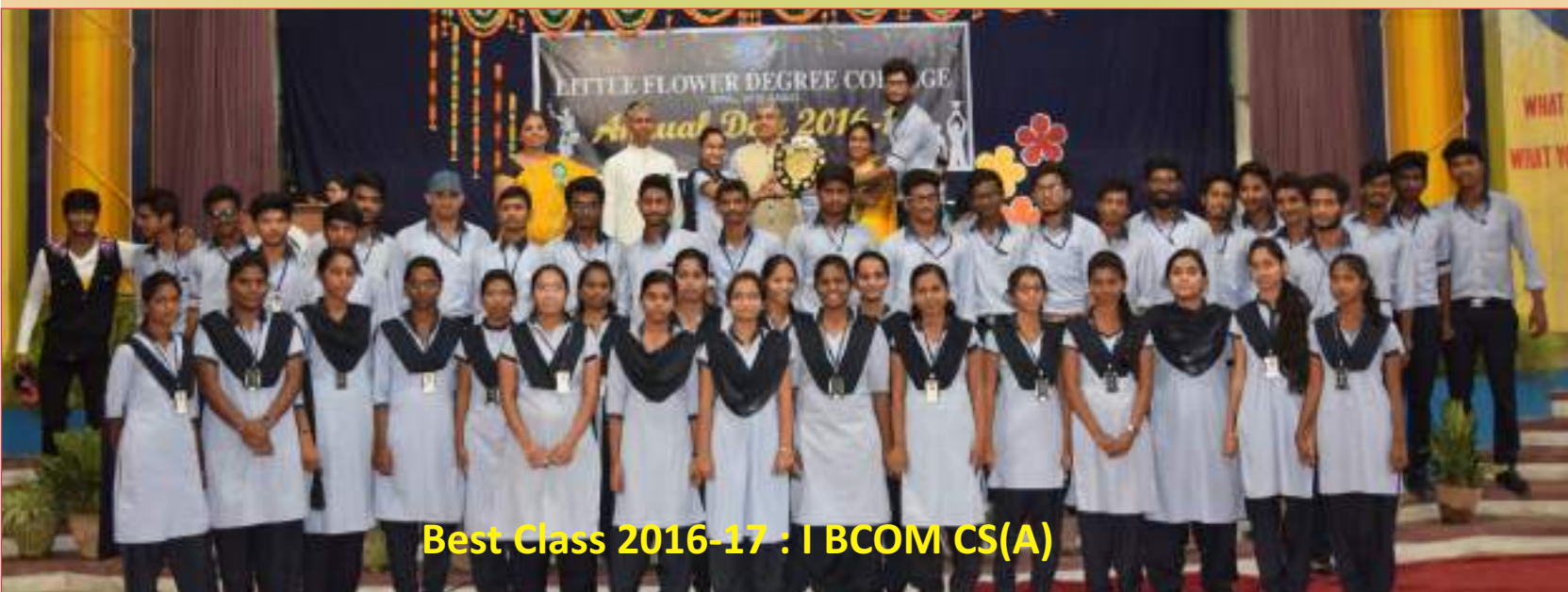
Best Class 2016-17 : I BCOM CS(A)