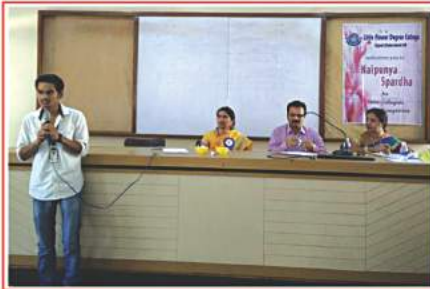
आशुभाषण प्रतियोगिता में अपने विचार प्रकट करता विद्यार्थी

इन प्रतियोगिताओं में लिटिल फ्लावर डिग्री कॉलेज, उप्पल, बद्रुका, भवन्स, सेंट पाइस, प्रगति महाविद्यालय, अरोरा, वेसली, पिन्स्टन, ओमेगा, अवन्ति, श्री साई, सेंट ऐन्स, डेविड मेमोरियल, वसुंधरा और रेल्वे डिग्री कॉलेज के विद्यार्थियों ने बड़े उत्साह के साथ भाग लिया।