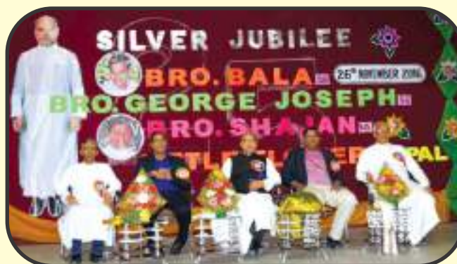
Respected Brothers' on the dais