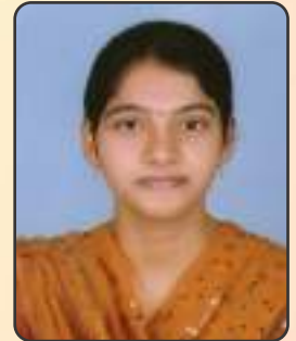
M Bhavana III BSC BTMC