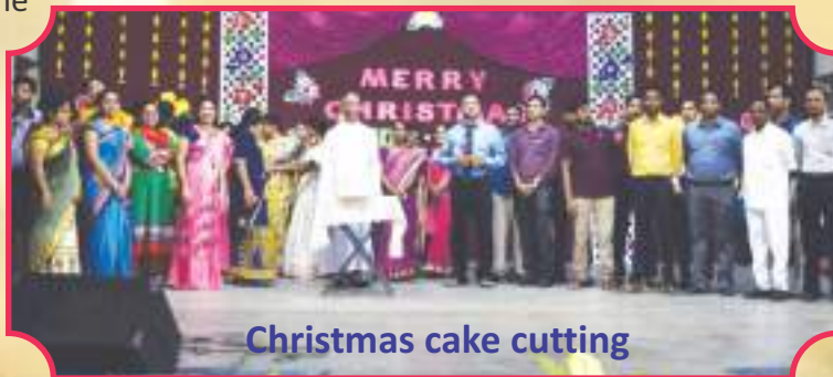
Christmas cake cutting