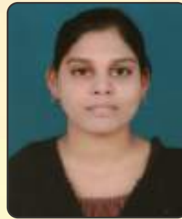
V. Victoria Asservadam III BSC BTMC