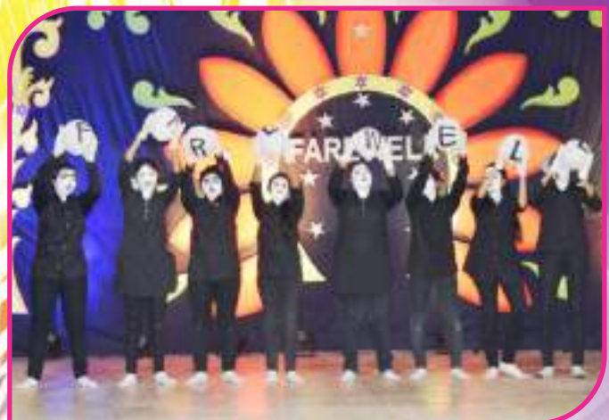
Lively performance by students on farewell day