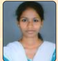
B. Madhuri III BCOM CS