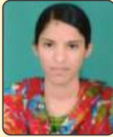
JS Anchana III BCOM CS