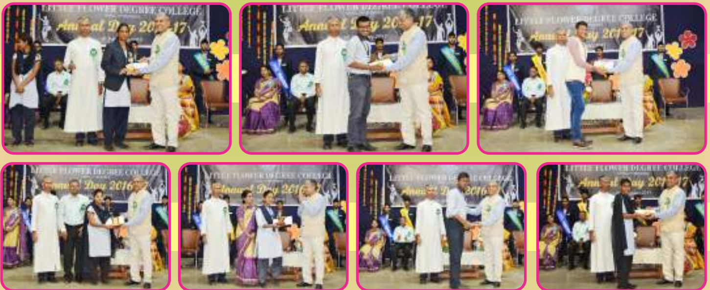
Chief Guest giving special awards to meritorious students.