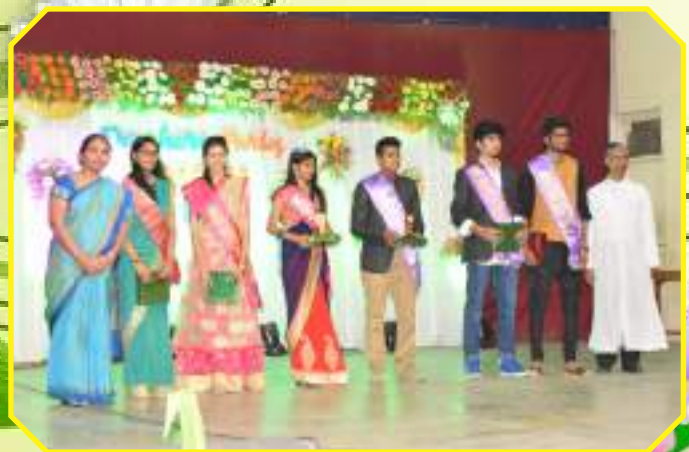
Students having a gala time