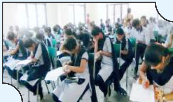
Students writing Aptitude Test and 'Applications of Statistics' on the occasion of National Statistics Day