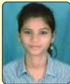
Jhansi III BCOM G