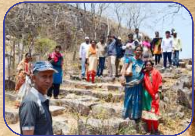
Staff at Medak Cathedral Church & Medak Fort