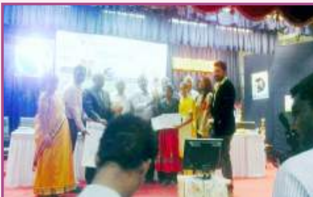
Prize winners of Abacus competition

Ten Students from B Sc – II year & B Com – II year participated in ABACUS competition held at Badruka College. Out of 250 groups our college students bagged the first prize.