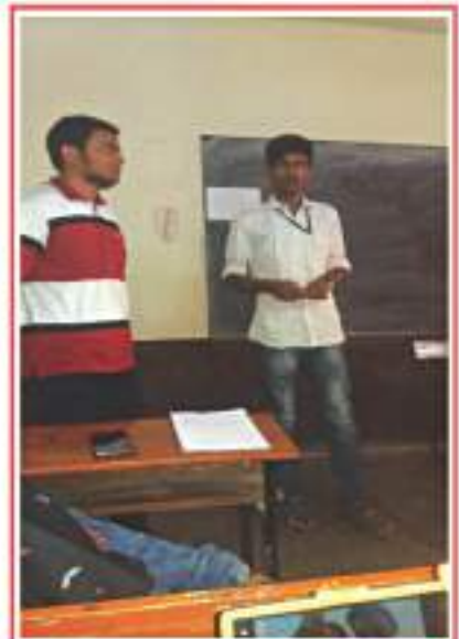
वाद-विवाद प्रतियोगिता में अपने विचार प्रस्तुत करते हुए विद्यार्थी