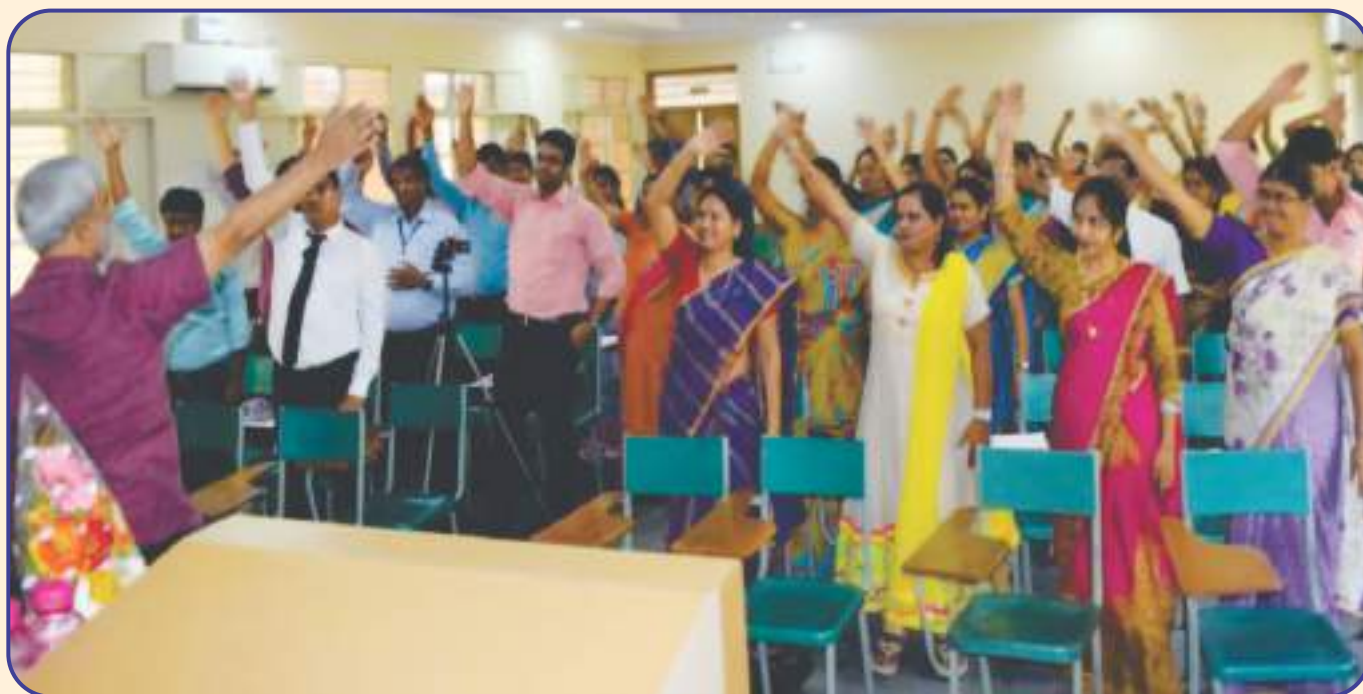
Faculty members involving themselves during the orientation