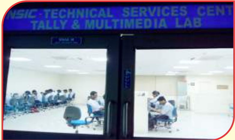
Students practicing Tally in NSIC Lab