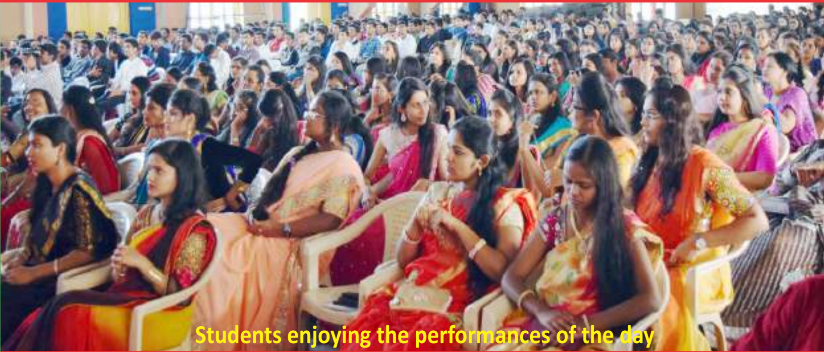
Students enjoying the performances of the day

All the students had a gala time and the programme included an emotional video full of reminiscences of the passing out batch, in the college. The students expressed their gratitude towards all the teachers, feeling blessed and fortunate to have been a part of this institution.