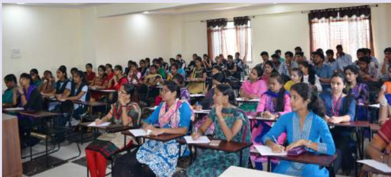
Participants of workshop