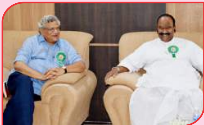
Chief Guests' Honourable Home Minister of Telangana , Shri Naini Narasimha Reddy and CPI(M) Leader, Shri Sitaram Yechuri