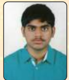
B Himavath III BCOM G