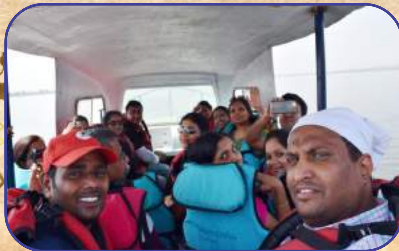
Staff enjoying the boat ride at Medak