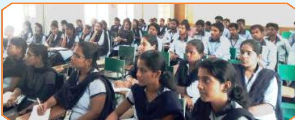
Students participating in seminar