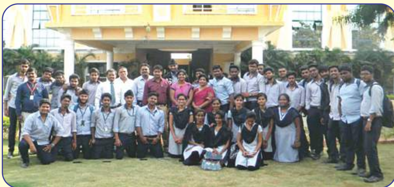
Students and faculty attended educational trip

Students have gained knowledge about the higher educational opportunities available to them immediately after the completion of B.Com, advantages of joining masters programme in Management and career opportunities available after the completion of the Management programme.