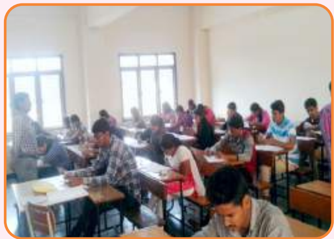
Students attempting Madhava Mathematics exam