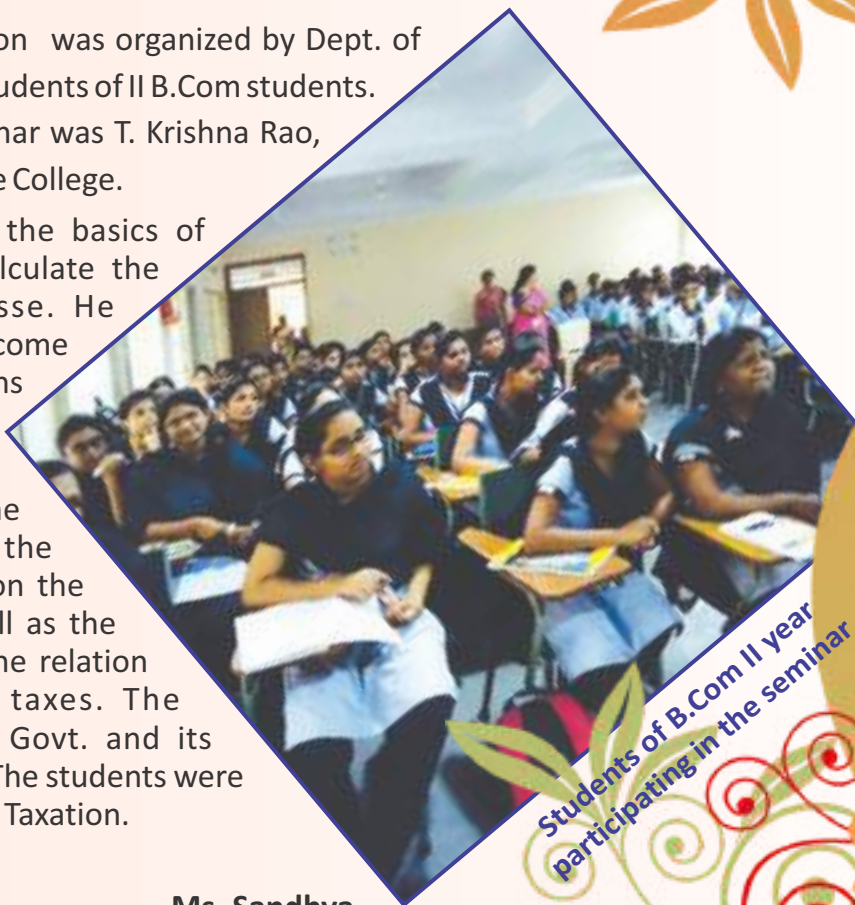
Students of B.Com II year participating in the seminar

He gave insights on the effect of indirect taxes in our daily life. The students were interrogated on the subject to test their knowledge on the effect tax has on business as well as the common man. He spoke about the relation between direct and indirect taxes. The implementation of GST by the Govt. and its implications were also discussed. The students were enlightened on different aspects of Taxation.