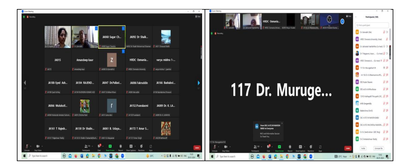
Online session on Skill development

The eight-day curriculum was divided into two sessions per day, each covering a detailed element of each topic. The primary goal of the session is to strengthen leadership, multidisciplinary education, and information and communication technical skills. The sessions resulted in the acquisition of knowledge about the most recent advancements in New Education policy, as well as the development of technical skills in ICT comprehension, the centric pedagogical model, and the ability to build information and communication technology. Overall, the event was an instructive and interesting experience for the researchers and other academicians from various colleges. The lessons helped to improve a variety of teaching skills.