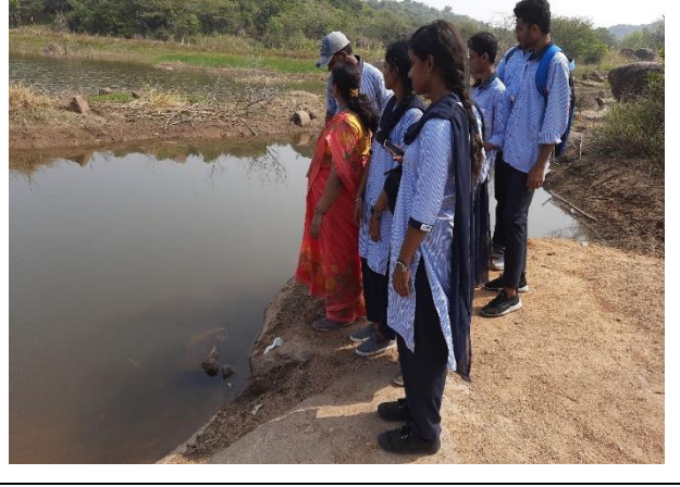
Students in the Forestrek park