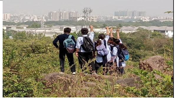
Exploring the trekking area and the urban park