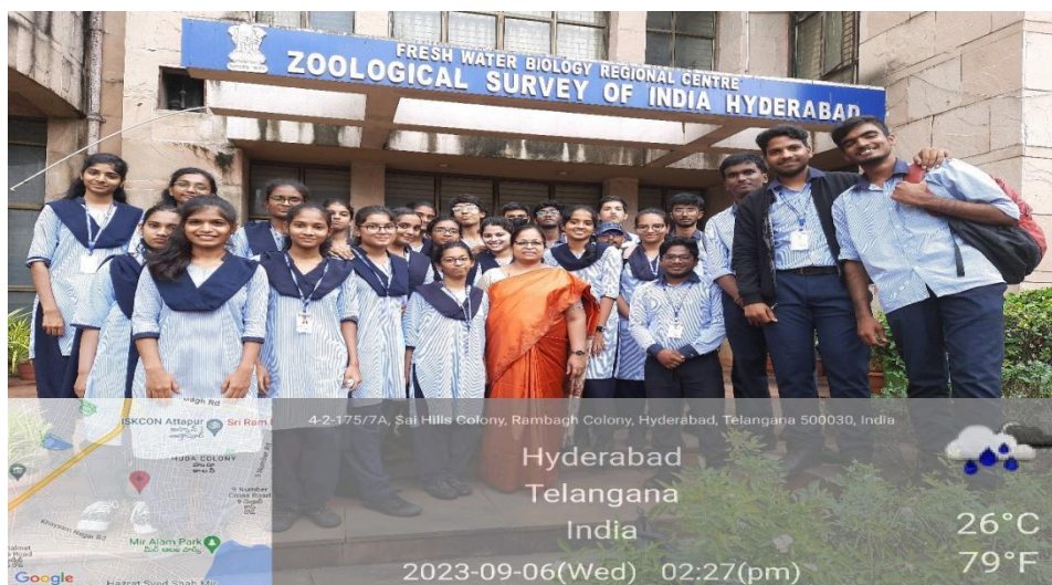
Zoology Faculty & Students attending Ozone Day celebration at ZSI

The overall outcome of the program emphasized on the pivotal role of the Montreal Protocol in not only protecting the ozone layer but also mitigating climate change.