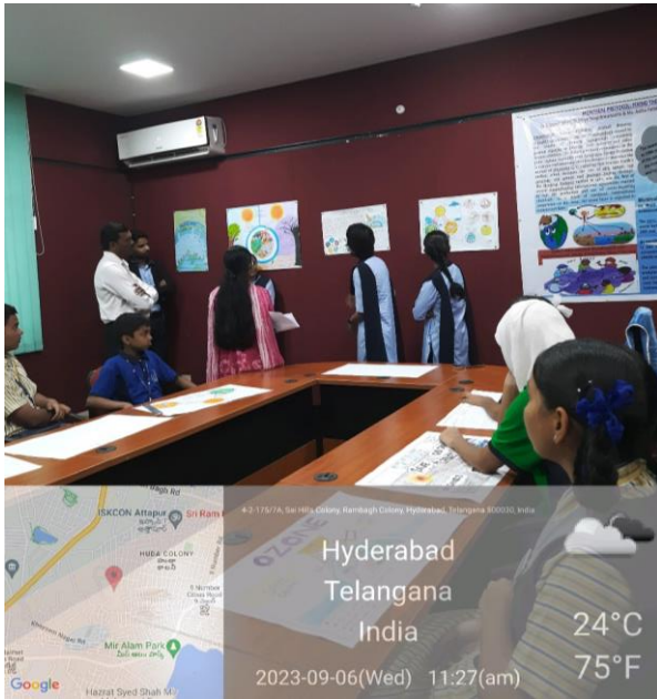
Students presenting posters at Ozone day celebration, ZSI