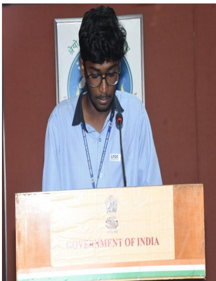
Student of LFDC Presenting at ZSI