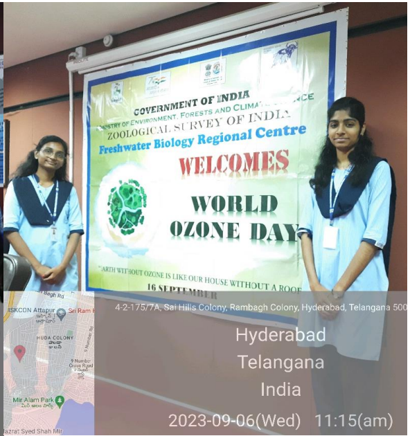
Attending Ozone Day celebration at ZSI