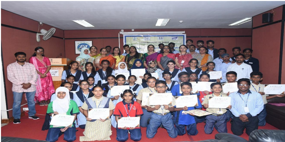
Participants with the ZSI team