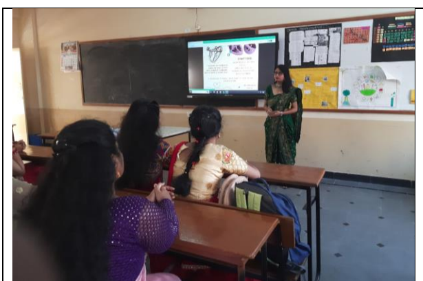
Presentation on structure of heart

The overall outcome of the session was the students learned about the healthy lifestyle, stress management and physical fitness to control the effect of cardiovascular diseases.