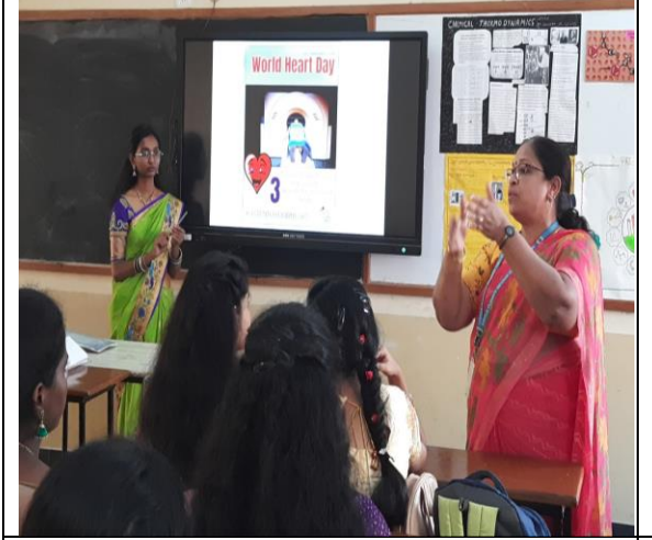
Discussion on recent advances in Cardiology