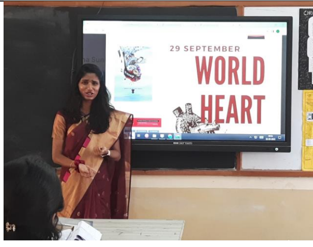
Student talking about world heart day