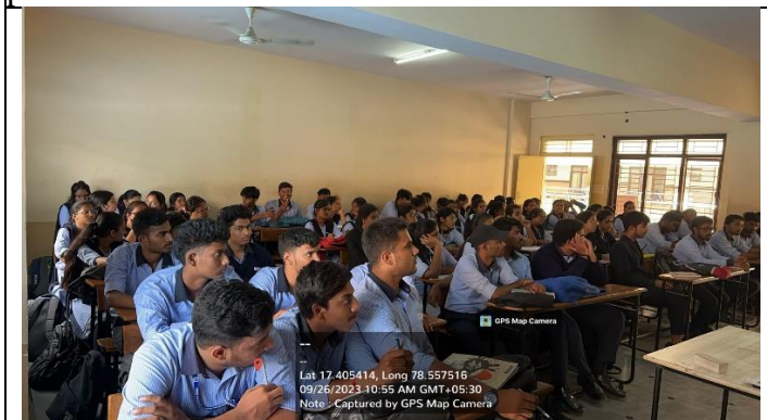
Students attentively listening to the lecture