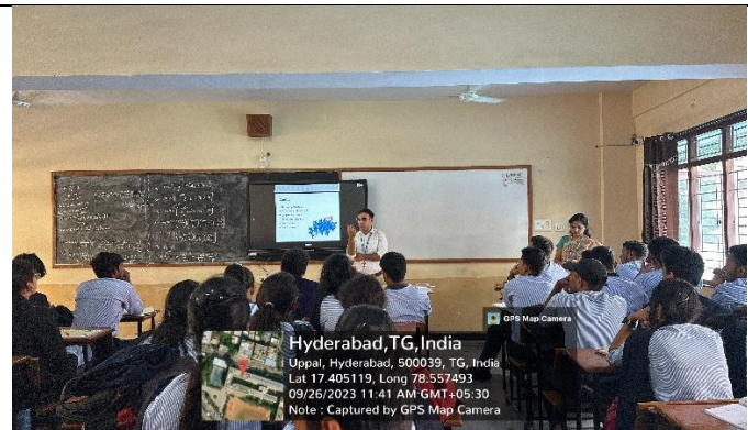
Sir attending to students queries