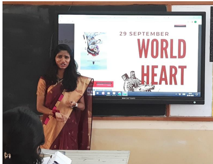
E- poster on Heart diseases

The Department of Zoology organized an awareness programme on Advances in Parasitic Diseases: A Power Point Presentation on August 30 and September 1, 2023, in Room No. P24 at 12.30 pm. Recent advancements in the diagnosis and treatment of parasitic diseases have become an inevitable topic after the pandemic attack of the Corona virus. The aim of this programme was keep the students informed of the recent trends and scientific advancements in diseases. Students of BSC BZC, BTMC, and MZC I, II, and III years prepared PowerPoint presentations on various parasitic diseases, the causative factors, and diagnosis, which were followed by an active interactive session. They also discussed the preventive measures to keep themselves healthy. The overall outcome of the session was to provide information about the early signs and symptoms and how to take appropriate action to avoid complications. Students learned about the importance of a healthy lifestyle and the preventive and presumed treatments for various parasitic diseases.