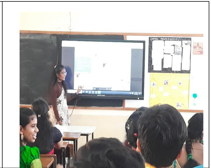
Student presenting on CT scan diagnosis