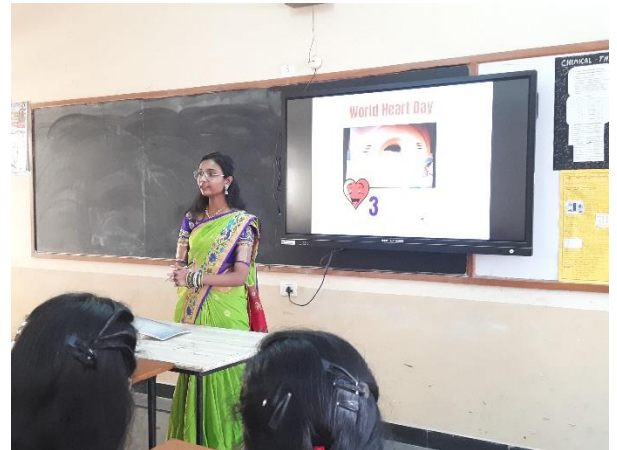
E- poster presentation on Pace makers