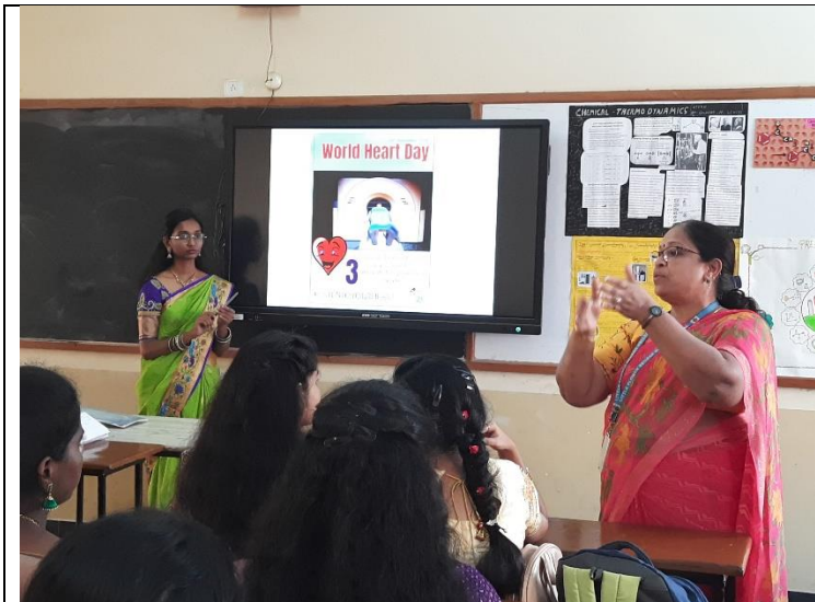
E-poster presentation & interactive session