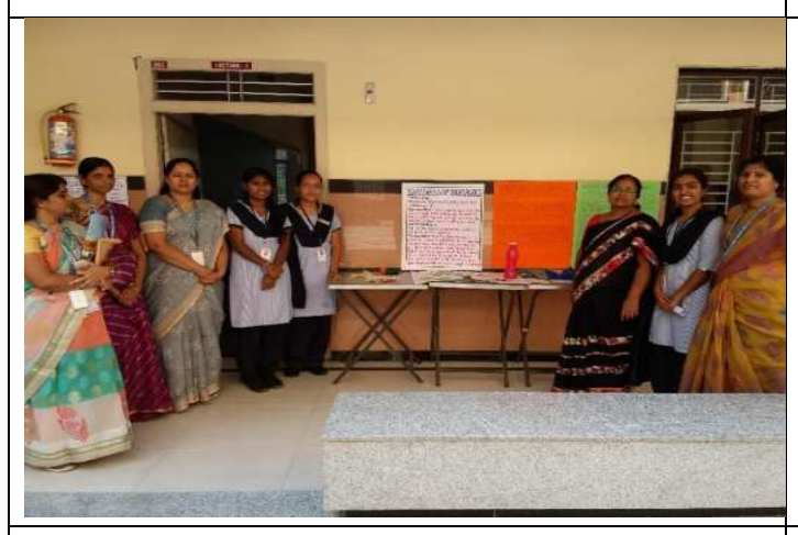
LENVIN Team organising Demo on bioplastics