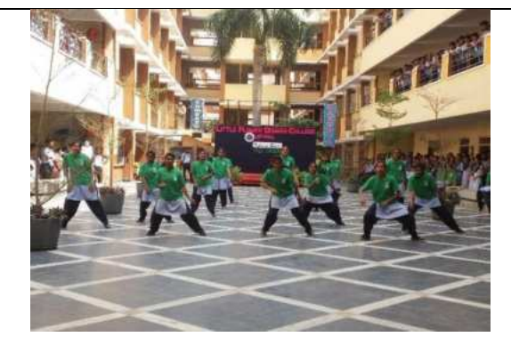
Flash mob displaying Save Earth