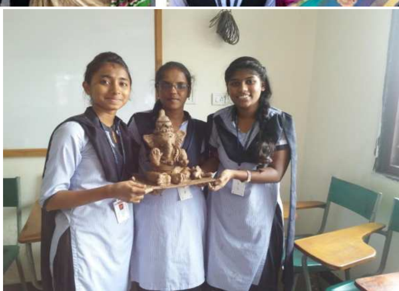
Ecofriendly star Ganesha at display