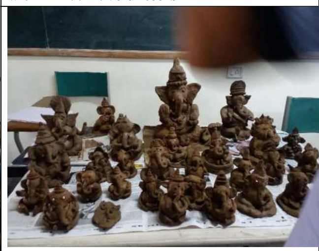
Ecofriendly Ganesha at display for Ganesh Chaturthi