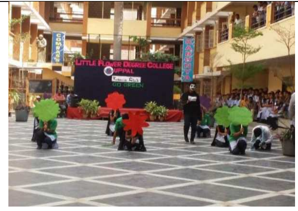
Flash mob on theme Go green