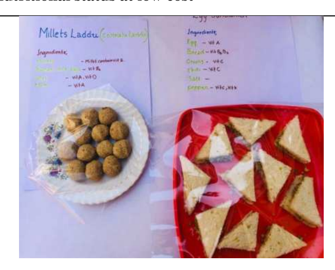
Nutritious food at low cost on display