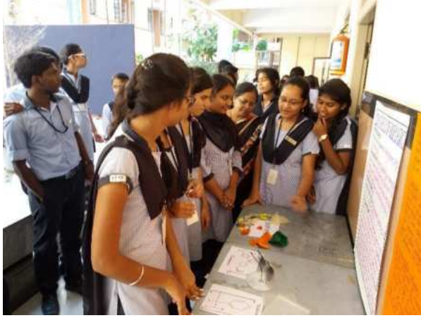
Demo on Bioplastics as an alternative to plastic pollution