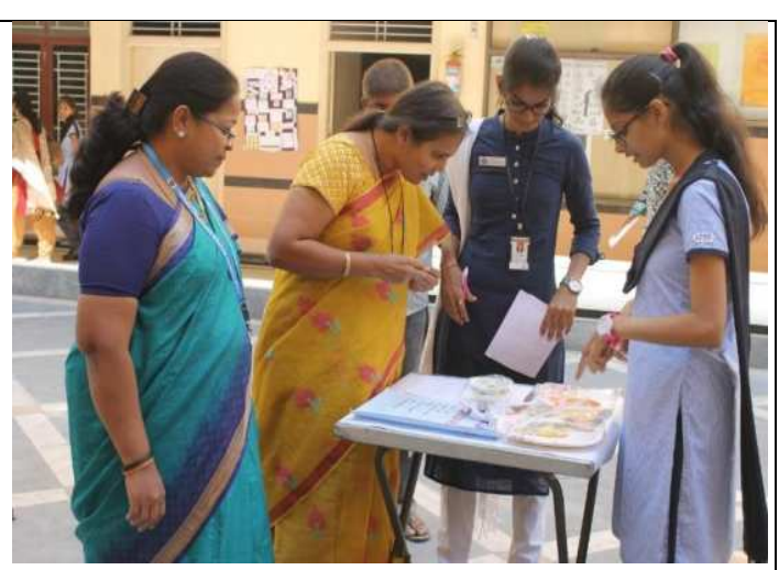
Ala carte Food Recipes-Food Stalls with high nutritional status at low cost