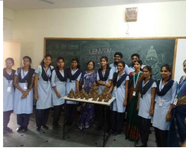
Making of Ecofriendly Ganesha