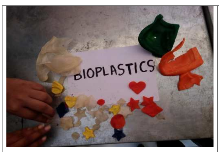
Preparation of bioplastics

Event 3: Demonstration on Use of Bioplastics and No to Use of Plastics Venue: Karunya Court, LFDC, Uppal Date:21st February 2019