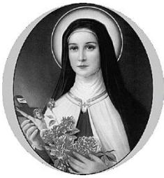
St. Therese of Lisieux Our Patroness

Saint Louis-Marie Grignon de Montfort (31 January 1673 – 28 April 1716) was a French Roman Catholic priest and Confessor. From the beginning of his priestly ministry in December 1700, Louis-Marie envisioned a Congregation ready to go anywhere to teach catechism to the peasants, the poor, and the children. “God Alone” was his motto and the source of his unending spring of love was always God. The Roman Catholic Church, under the pontificate of Pope Pius XII, canonized Montfort on July 20, 1947. Three congregations trace their foundation to St. Louis de Montfort: Daughters of Wisdom, Company of Mary, Brothers of St. Gabriel. Though the Montfortian Society was founded in the 18 th century, it is only in 1903 that the Brothers came to India.