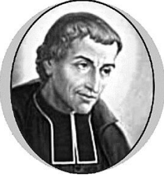
St. Louis Marie De Montfort Our Founder