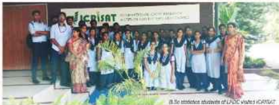
B.Sc statistics students of LPDC visited ICRISAT