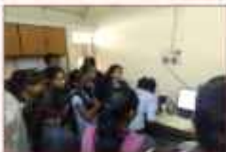
STUDENTS AT CELL BIOLOGY LABORATORY