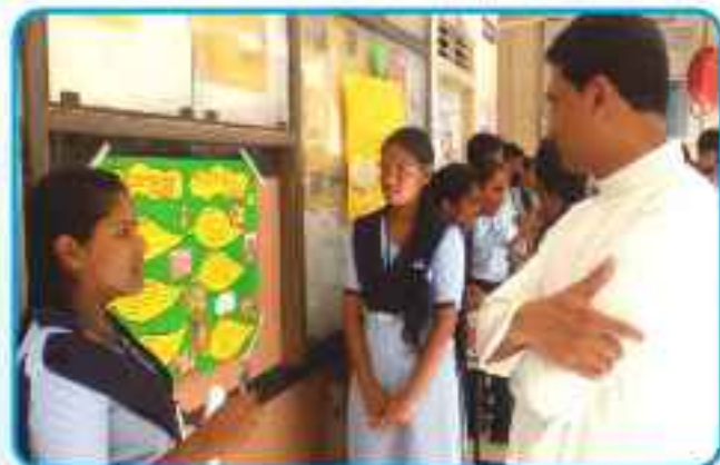
Botany students explaining about carnivorous plants