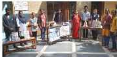
Students of St. Pious observing the models

The second languages department has organized Model and Charts Exhibition based on the theme "Languages and their Diversity" on 1st February 2019. The students have made models and charts like Les Monuments – La Tour Eiffel, Le Château de Versailles, Une Église; A boutique showing about French fashion; Le Théâtre – about French movies; models of different types of cheese and wines; La salle de classe – Le système éducatif en France; La Rue – les directions et les magasins français; La maison française; Les Bandes – Dessines – Les Smurfs, L'Asterix et Obelix. The students prepared the models and charts very enthusiastically in groups and by this activity they learned new vocabulary, culture and civilisation of France. The students of the college, Vice-principal and Principal visited and appreciated the works done by the students. Other College "St Pious Degree and PG College" lecturers and students have visited the exhibition and appreciated the work and were inspired by the work done by the students. They had an interactive session with the students also.