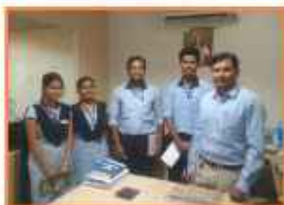
Students in the Bank

To enable the students of Commerce to understand the working of banking sector, Department of Commerce, Little Flower Degree College conducted off campus teaching programme in a tie up with South Indian Bank, Habsiguda Branch, Hyderabad from 24th -26th September, 2018. This helped the students to gain knowledge in real time banking.