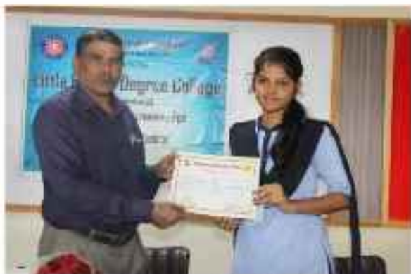
Student Participated in Orientation Programme