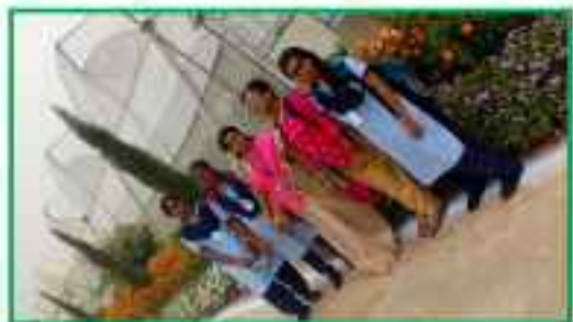
Poly house at Jeedimetla