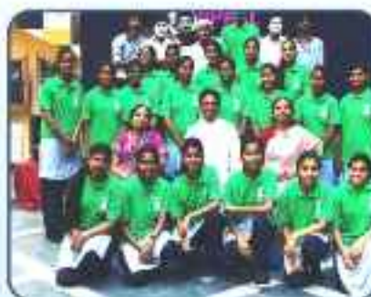
Members of the club

The members of the club enacted a flash mob in Karunya court depicting the significance of green environment and hazardous effect of pollution. The volunteers danced and enacted how the green ecosystem is affected by pollution. The entire college witnessed the performance of the group and was welcomed by everyone.