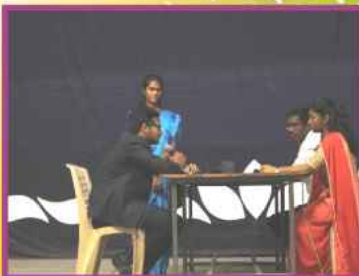
A drama skit