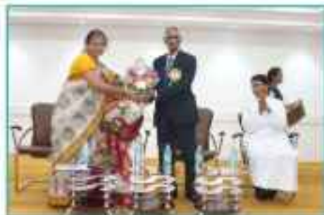
Felicitation of Chief Guest at National seminar