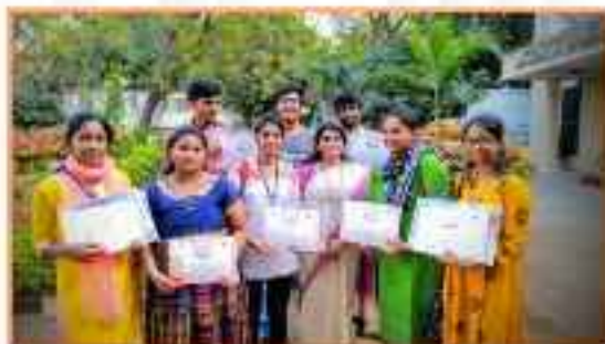
State Level Seminar