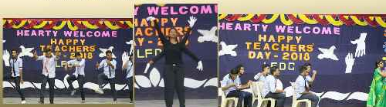
Students regaling the teachers