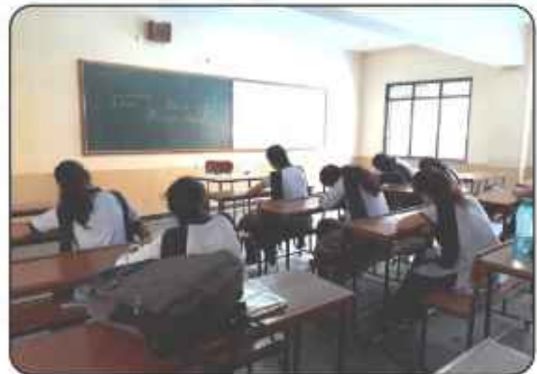
Students participating in picture recognition