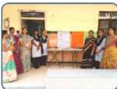
Members of the club