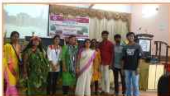
State Level Seminar at AMS