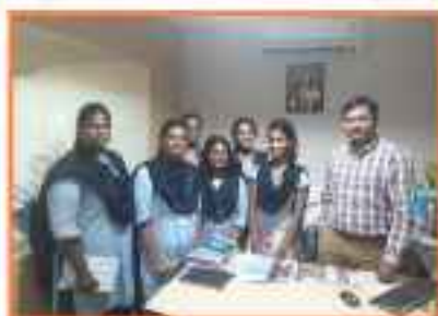
Students with Bank Manager