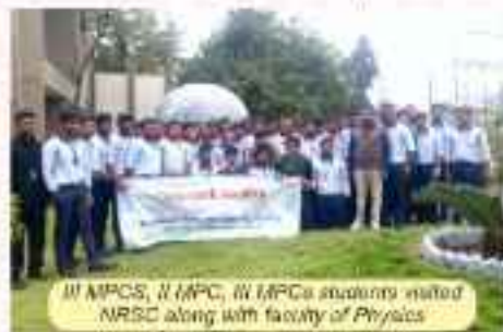
III MPCs, II MPC, I MPCs students visited NRSC along with faculty of Physics

Finally, students were allowed to observe various models of satellites and digital pictures sent by satellites in the gallery of NRSC. Students gained the knowledge about remote sensing devices and its applications.