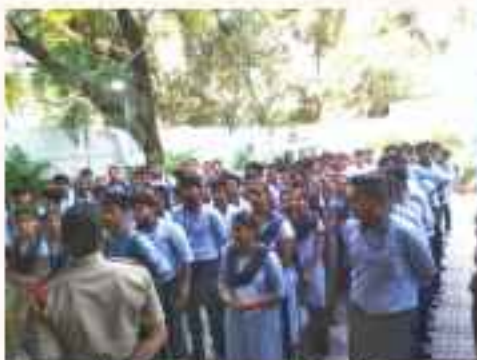
Students of II BSC at Panjagutta police station for a field trip

Students were quite enthusiastic and keenly observed the various stages of the manufacturing of the equipment.