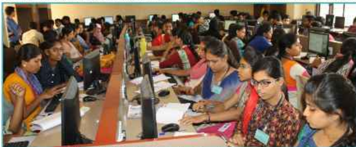
Students actively participating in two day workshop on data science