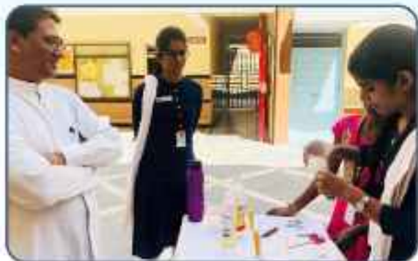
A Demo on adulteration of food

World food day was celebrated in the college by the club members on 27 October 2018. They displayed varieties of food items at low cost and high nutritive value. Prizes were given to the best food item and also to posters showing nutritional deficiencies. Adulteration in common food items were displayed demonstrated to the spectators.