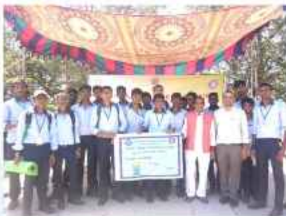
Our students at Inauguration of International Yoga Day