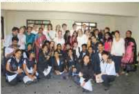
Group Photo with the France Students