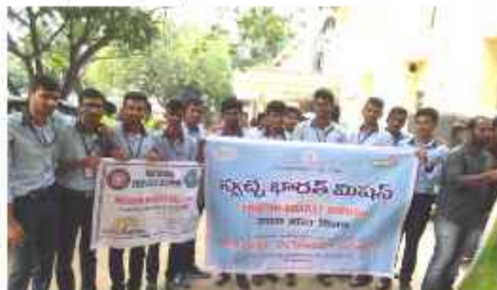
NSS Volunteers participated in Swach Bharath Abiyan Rally

Our NSS Unit volunteers participated in Swachh Bharath Rally program on 18th August, 2018 from GHMC Uppal office to Mekala Bharathi Gardens, NSS Volunteers gave slogans of Swachh Bharath, the Chief Guest for this program was GHMC officers, they spoke about the Segregation of waste, winners in Essay Writing competition were awarded.