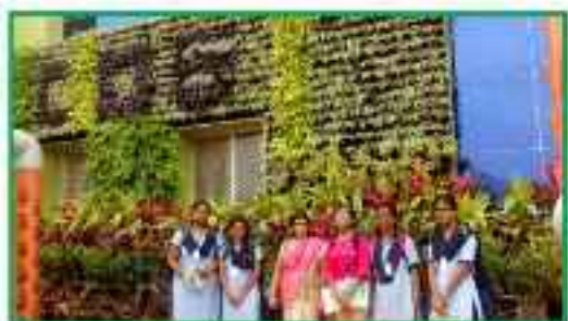
Vertical Gardening Model

The first state level workshop on Urban Farming and Vertical Gardening was organized by Department of Horticulture, Government of Telangana, Hyderabad; Students of BZC and BTMC attended workshop. The speakers talked about aims and advantages of Urban Farming and Vertical Gardening to promote urban vegetables cultivation on rooftops, back yards and balconies. Vertical Gardening is a good option to cultivate vegetables where the availability of place is very less. Students saw different types of vertical gardening on walls, pipes, plastic drums, and small earthen pots and so on.