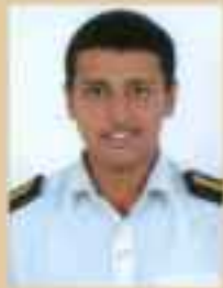
Pavan III BA