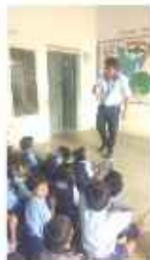
Awareness Program away students