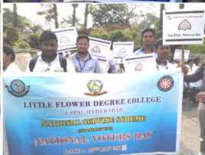
Students Participated at the Awareness Rally