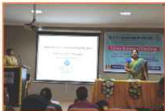
Oral presentation on Nano Materials through the ages from Ayurveda to Alopathy