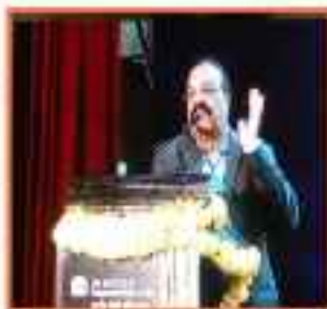
Resource person addressing the gathering

The faculty and students of Department of Commerce attended a seminar on "Churning Corporate Laws for Effective Academic World" on 3rd July, 2018 at Tagore Auditorium Osmania University from 2.00P.M. To 5.00P.M. The session imparted insights into the amendments made in the companies act and explained the need and scope of companies Act-2017. The Need for GST and its impact on today's economy was also discussed.