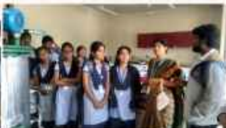
Students visited Environmental Biotechnology Lab, Fermentation