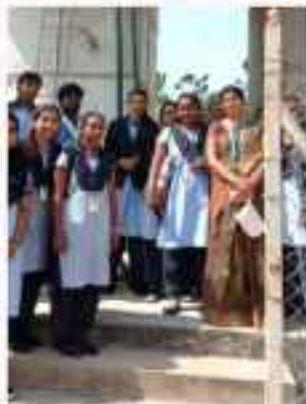
Students visited Methane Gas production Unit in BITS

Later, students visited Central Analytical Facility. These facilities include HPLC, water de-ionization/purification system, visible and UV spectrophotometers; advanced PCR machines, gel documentation system, flow Cytometer, servers for computational work, GC-MS AAS, spectro-fluorimeter, LC-MS, FTIR, and DSC etc. The visit assisted in gaining knowledge on conducting research in interdisciplinary biology.