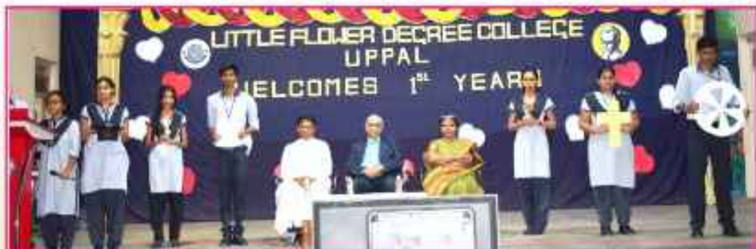
Presentation of college Logo by students