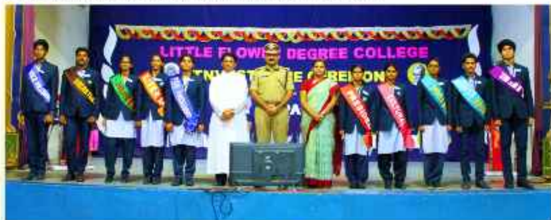
Elected Secretaries of Various Clubs

The office bearers consist of the College President, Vice-Presidents, General Secretary, Literary Secretary, Cultural Secretary, Sports Secretaries, LENVIN (Little Flower Environment Initiative) Secretary, LIFE (Little Flower Extension) Secretary, Discipline Committee and two representatives from each class. To extend the horizon of their learning, the Student's Council also consists of Secretaries of clubs working under different Departments such as Alan Turing Club (Physical Science), Johann Mendel Club (Life Science), Luca Pacioli Club (Commerce), Peter Drucker Club (Management), Regnant Club (Current Affairs), Aristotle Club (Political Science and Psychology), HORIZON Club (English Literature), Vernacular Voices Club (Languages) and NSS Club. The Chief Guest administered the oath to the newly elected office bearers, conferred on them badges and sashes and handed over their respected flags. The members took the pledge to hold the college motto of "Lead to illuminate" in high regard.