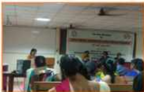
Lecturers from Dept. of Statistics attending the Workshop in OU