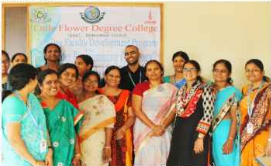
Faculty from various subject backgrounds took part actively in the Faculty Development Program