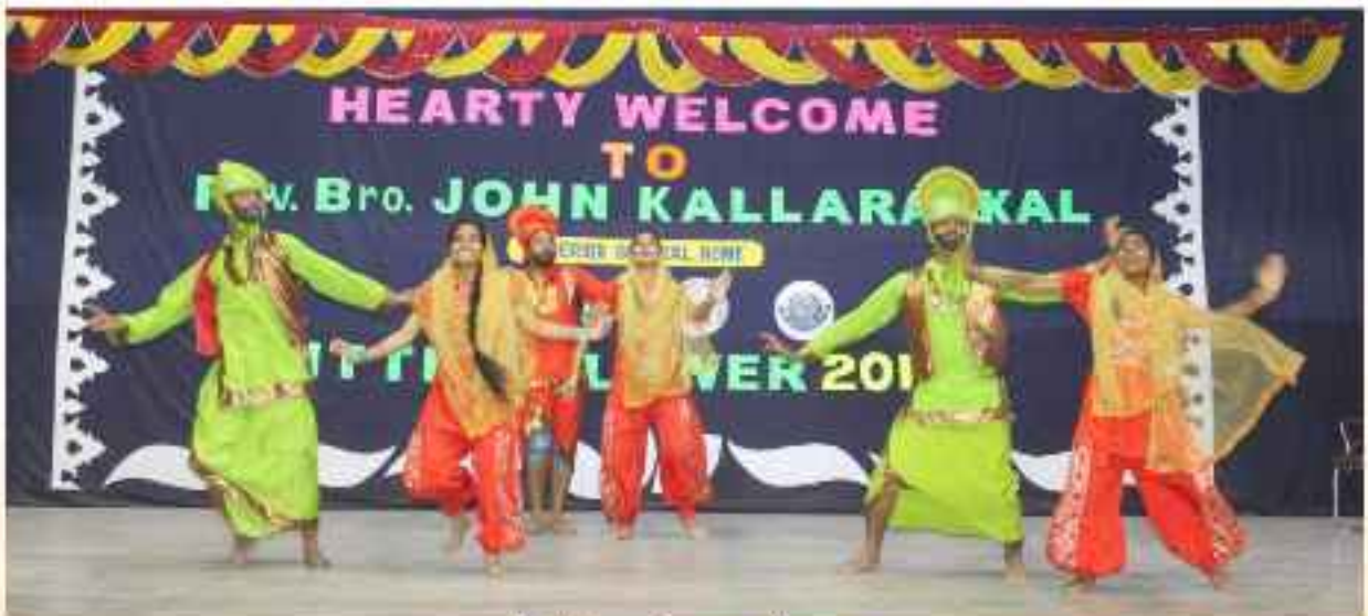
Student performances Bhangra