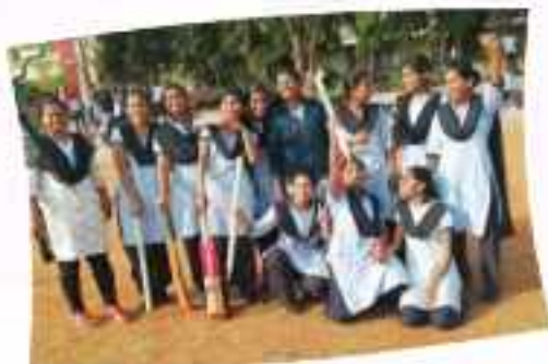
Intra Mural Cricket Competition