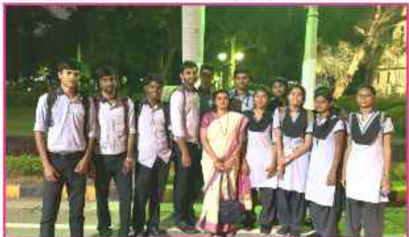
BZC II year students at IICT