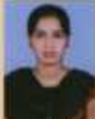
Akhila III B.Com CS