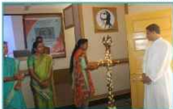
Data science workshop was inaugurated with lighting of lamp

The workshop was conducted from 9:00 AM to 5:00 PM and at the end students were provided with the certificate of participation in collaboration with Integrum Litera Pvt. Ltd.