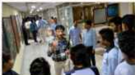
Research scientist explaining about E.coli CCMB

Department of Botany organized a field trip to Centre for Cellular and Molecular Biology (CCMB) for 1st B.Sc. (BZC) students on the foundation day of CCMB (26th September). Students were given an opportunity to interact with scholars, scientists and entrepreneurs. They gained insight on the principles and application of analytical tools and techniques including electron microscope, High Performance Liquid Chromatography (HPLC), Mass Spectrometry (MS), Gas Chromatography (GC) and DNA Sequencing machines etc. Thus, facilitated the young minds with the current innovations and research advancements in the frontier areas of Biology research.