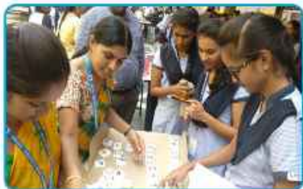
National Science Day-5