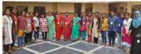
Group photo with the students & lecturer of St. Pious Degree College