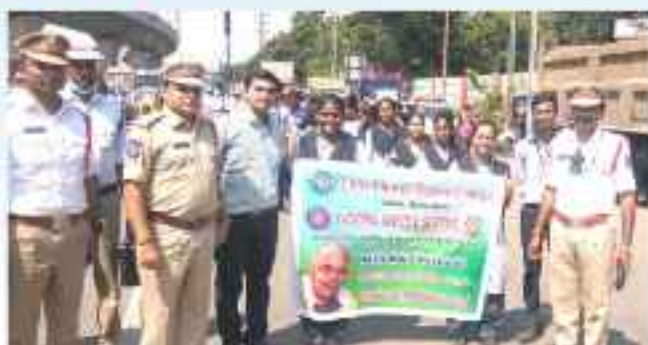
Members of NSS Participated in Rashtriya Ektha Diwas