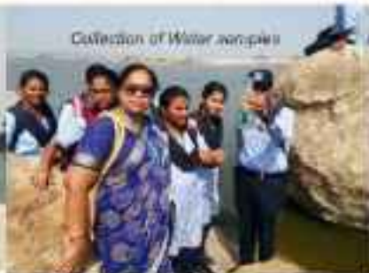
Collection of Water samples