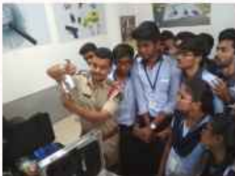
Students were given the exposure towards finger print technology