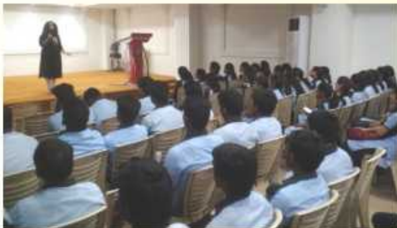
Induction for Placements