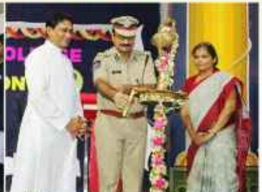
Lighting of the lamp by the chief guest