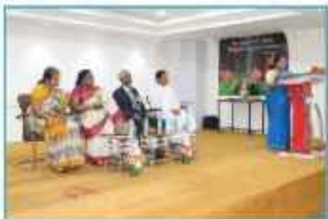
Inauguration of National Seminar