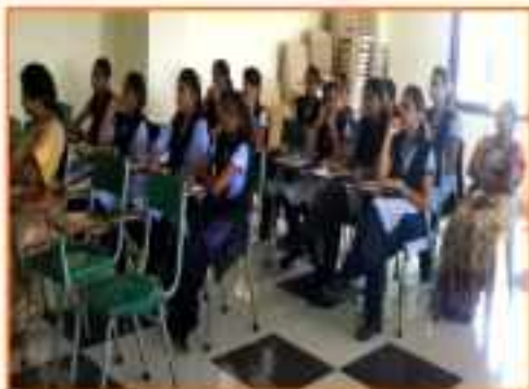
B.Sc (MBCS) - II attending the Seminar