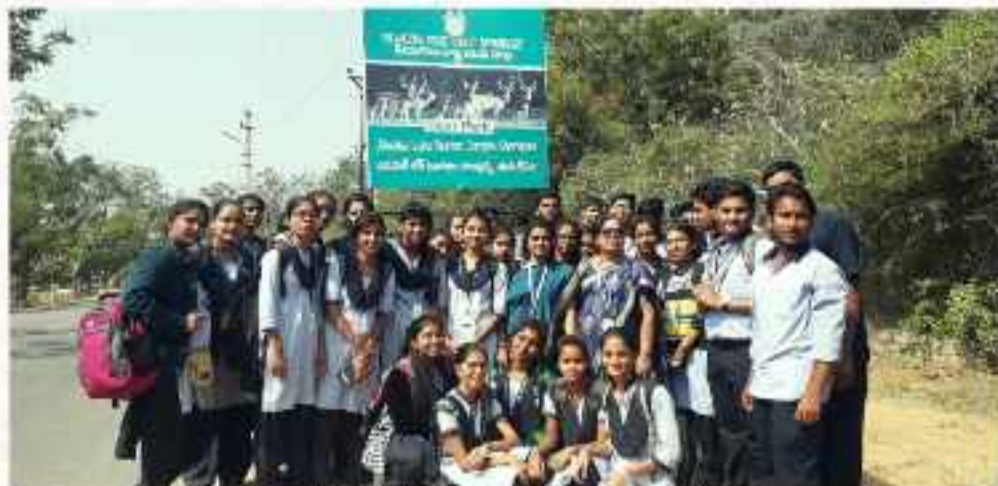
BZC I & II year students at Deer park