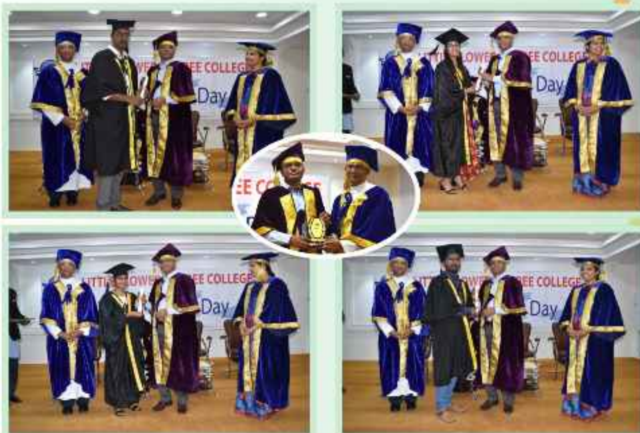
Students receiving Certificates on Graduation Day