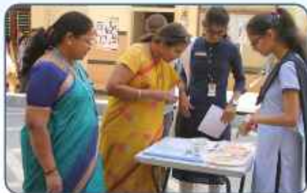
Nutrition at low cost