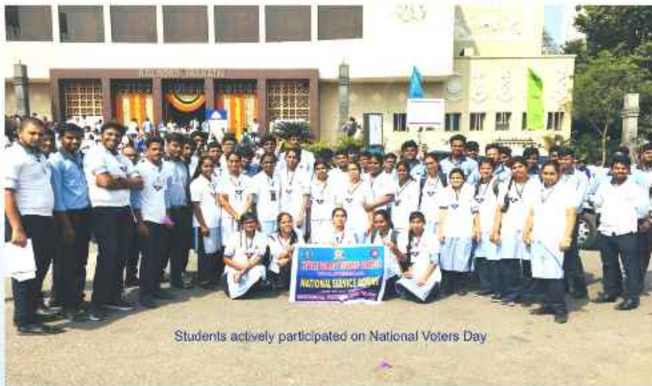
Students actively participated on National Voters Day