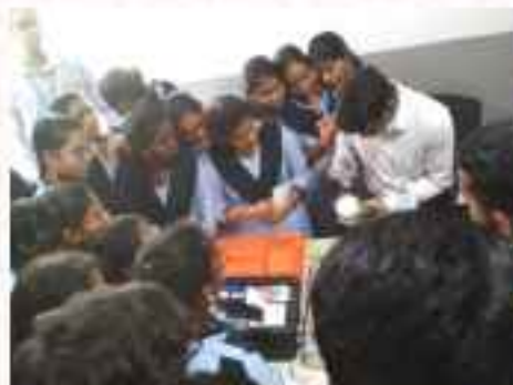
The procedure of taking finger prints is being explained to 2nd years B.Sc.