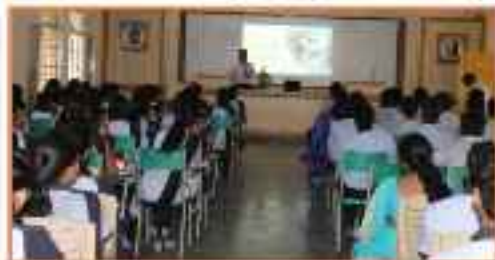
Lecture on Mass Spectroscopy and its application