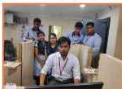
Students Learning Transactions