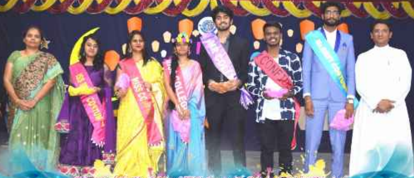
Winners of Mr. & Mrs. Gift & FOC along with Principal & Vice Principal