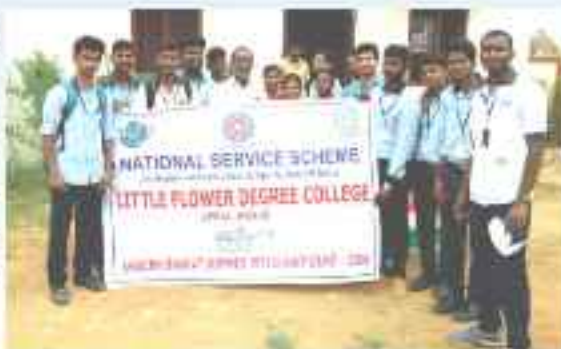
Inauguration of Internship Programme.

On 23-06-18, the Swach Bharath summer internship camp as ended with a small closing ceremony.