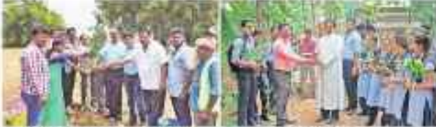
ప్రస్తుత పాఠశాలలలో మొక్కలు నాటుతుంటే... ఉన్నతలో మొక్కలు నాటి ఉద్యోగం పని కారణం కార్యక్రమం..

ప్రస్తుత పాఠశాలలలో పాఠశాలకు మొక్కలు నాటుతుంటే... మొక్కలనాటి పాఠశాలలో మొక్కలు నాటి ప్రకృతి సామ్రాజ్యం... ఉన్నతలో మొక్కలు నాటి ఉద్యోగం పని కారణం కార్యక్రమం..