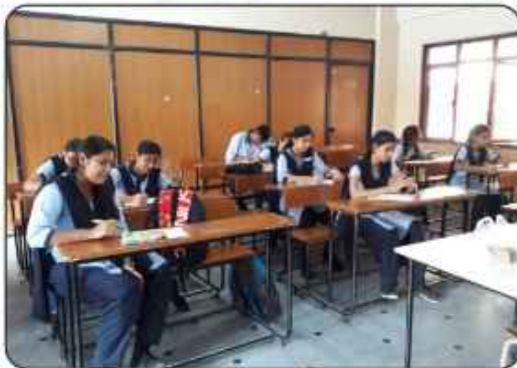
Students participating in memory grid