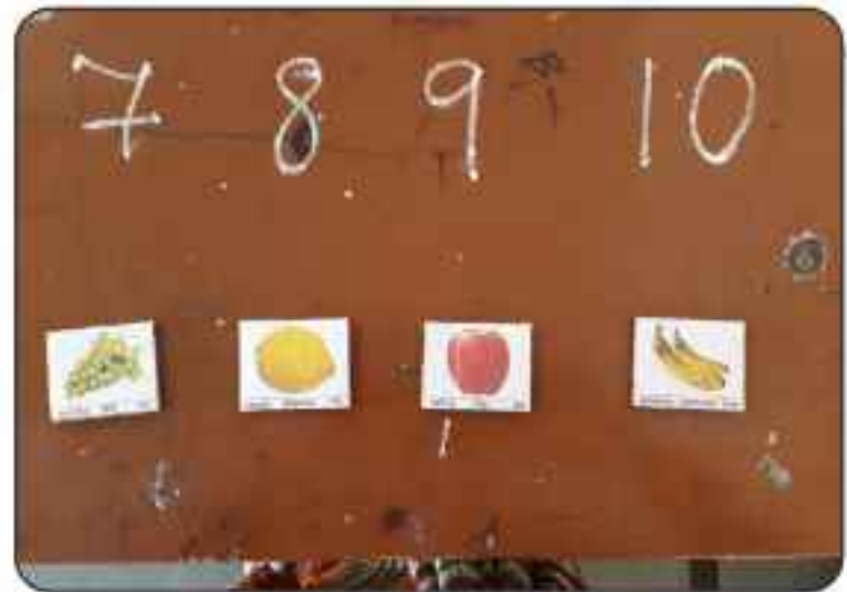
Objects displayed for picture recognition competition