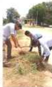
Helping to dig to plant