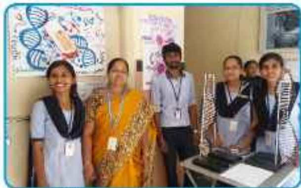
Science day celebrations- Gene editing