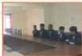
Students delivering their project