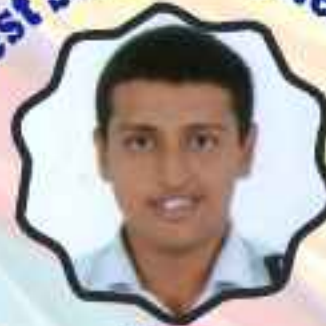
Pavan III BA