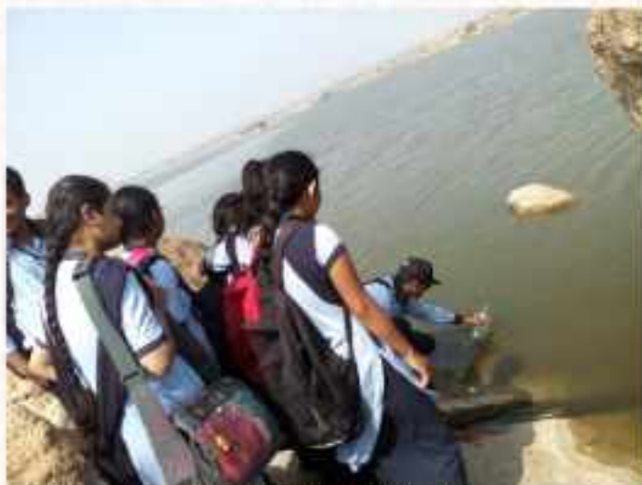
Collecting water sample at Shamirpet lake

Department of Botany has organized a botanical field trip to Shamirpet Lake and Deer park for BZC 1st and 2nd year students. Students collected the water sample from lake and studied about the algal flora of lake in the Botany laboratory later. Students found filamentous algae and blue green algae in the lake water. They also visited deer park to observe the vegetation pattern. There students could see the detail forest canopy with herbs, shrubs and trees. Herbs like Boerhaavia to trees like Pongamia were seen in the forest.