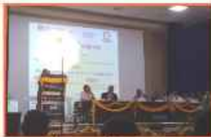
Dellegates of the Session