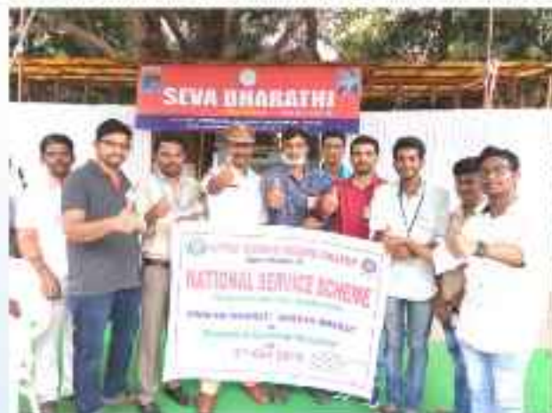
Volunteers participated along with Seva Bharathi

Our NSS Unit volunteers participated in Swachh Bharath –Arogya Bharath program at Osmania General Hospital on 2nd October, 2018. This event was organised by State NSS Cell, NSS Cell O.U in collaboration with Seva Bharathi as a part of Gandhiji's 150th Birth Anniversary. They divided volunteers into groups each group were given cleaning materials. LFDC Volunteers participated in Swachh Bharath at Osmania Hospital from 9AM to 2PM, and made program a grand successes.