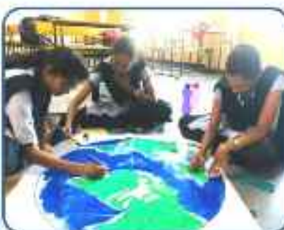
Students preparing the models and awareness