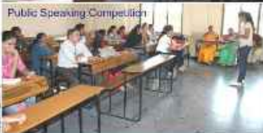
Public Speaking Competition