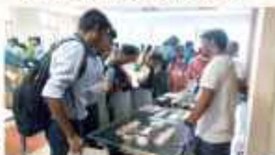
Centre for DNA finger printing and diagnostics