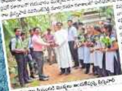
కళాశాల నిర్వహణ కమిటీలు ఆధ్వర్యంలో మొక్కలు నాటిన ప్రెస్టిజియస్