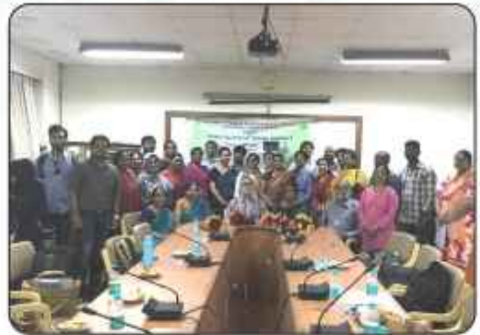
Group photo of the workshop attendees