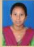
Jayadurga III B.Sc BTMC