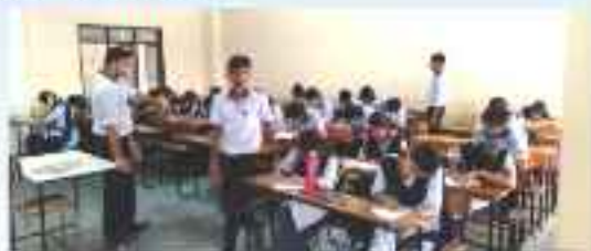
Students writing about Swach Bharath

Our NSS Unit volunteers participated in Swach Bharath Essay writing competition program at Little Flower Degree College, Uppal on 17th September, 2018. Winners of this event awarded in the GHMC Uppal office.