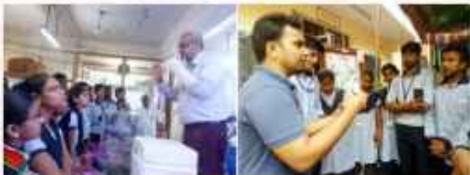
Scientist demo to students at CCMB

The 2nd year BZC students visited CCMB on CSIR Foundation day celebrated as Open Day on 26th September 2018. The students were taken to various research laboratories and they had the opportunity to see the advanced instruments like the Scanning Electron microscope, Real Time PCR, Chromatography, Electrophoresis units, Analytical ultracentrifuge, Fluorimeter, Mass spectrometers, HPLC, Freeze-drying etc. Models to show the transmission of various diseases like Dengue, Malaria and importance of Drosophila as a research object were displayed. Animal behaviour and stress was also displayed with simple test and importance of liquid Nitrogen was demonstrated. The students gained immense knowledge and had an opportunity to get appraised with the latest trends.