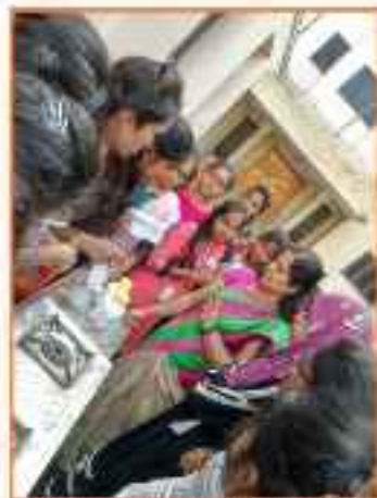
Explanation of Cosmetic Preparation