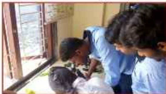
Students engaged in observation