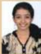
GSS Sindhuja III B.Com CS