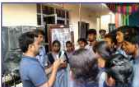
YOUNG RESEARCHER EXPLAINING ABOUT ADVANCED DENGUE VIRUS