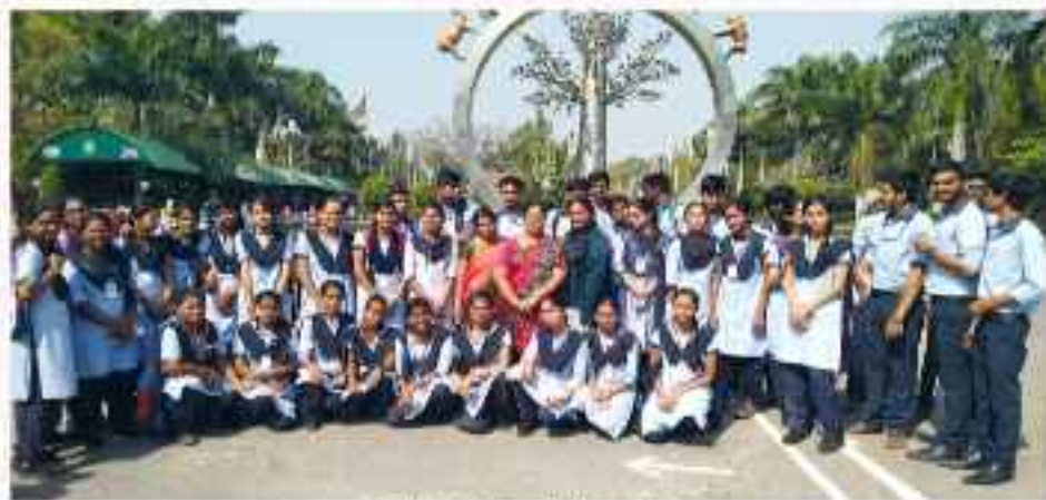
Field trip to Nehru Zoological Park