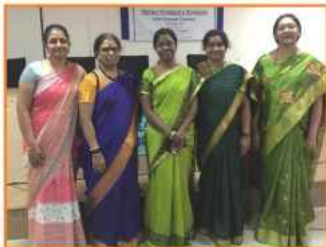
Group photo with the language lecturers of Bhavans College