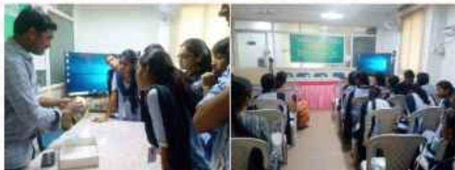
Field trip to NEERI to attend 61st Foundation Day