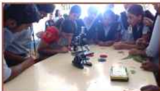
Demonstration of sectioning given by Lecturer

Department of Botany has organized an activity based programme for various courses for Non science and Non Botany students. Numerous practical techniques were taught, among them one is sectioning of any part of plant like root, stem and leaves. BZC II year students demonstrated the sectioning technique to other interested students from Commerce and Arts streams. They observed the sections under microscope. They were amazed by seeing the internal world of plant cells. The response shown by the students was thunderous.