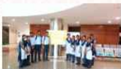
Centre for DNA finger printing and diagnostics

Students also witnessed the hybrid varieties of rice, 23 pairs of chromosomes under microscope, organs of rat, DNA fingerprinting by using gel electrophoresis method. It was very informative and a great learning experience.