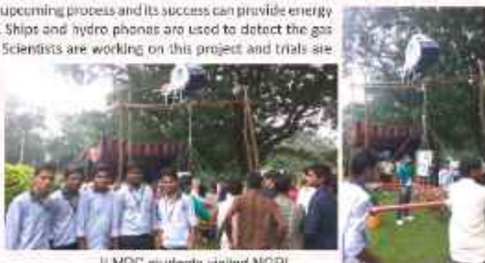
II MPC students visited NGRI

Gas hydrate project is an upcoming process and its success can provide energy for the coming 20 years. Ships and hydro phones are used to detect the gas hydrates using air guns. Scientists are working on this project and trials are made in China which gave a bitter result but eventually it might turn out well. Visit to NGRI was informative and gave loads of knowledge. Altogether we had fun and had a very good learning experience.