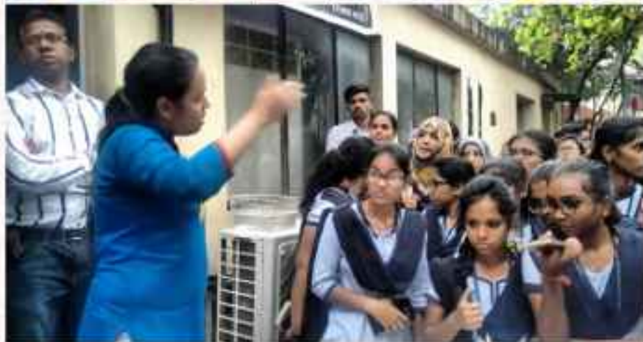
Zebra fish shown as model organism to students in CCMB