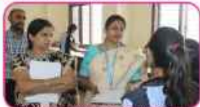
INTERVIEW SESSION ABOUT STUDENT INTERESTS AND JUDGES