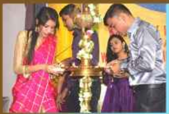
Students Lighting the Lamp