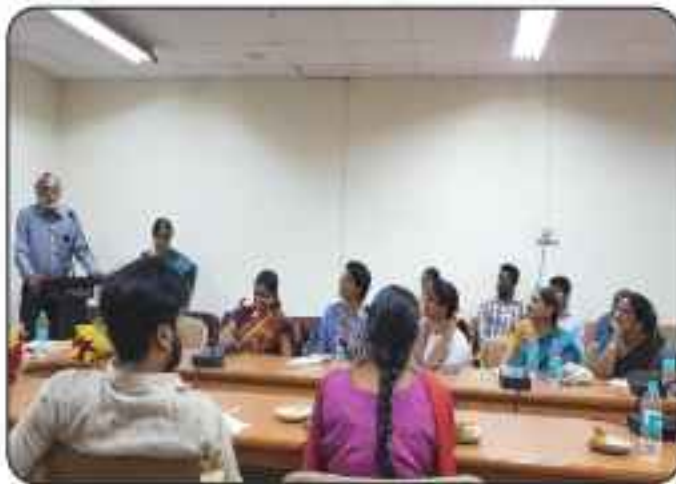
The French lecturers distening to the workshop topic