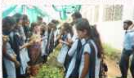
Research scientist explaining about medicinal plants CIMAP

Department of Botany organized a botanical tour for B.Sc., (Botany, Zoology and Chemistry) 1st and 2nd year students to the Central Institute of Medicinal and Aromatic Plants (CIMAP), Boduppal, Hyderabad. CIMAP is frontier research laboratory under Council of Scientific and Industrial Research (CSIR). As a part of the visit, students were exposed to farmer- friendly, sustainable, production-orientation technologies and high yielding varieties of economically important medicinal and aromatic plants (MAPs). Concepts such as eco- friendly and profitable green herbal farms were also demonstrated during the tour. Further, knowledge on "ex situ conservation" of rare, endangered and endemic MAPs of Eastern Ghats, maintaining Germplasm of plants such as Ocimum, Mucuna, Clitorin etc. were dealt. Overall, students were delighted with the knowledge sharing experience and inspired by the research activities that were demonstrated during the visit.