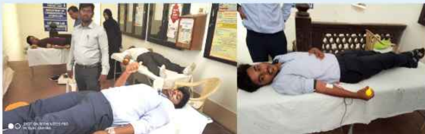
Students of NSS Club Donating Blood