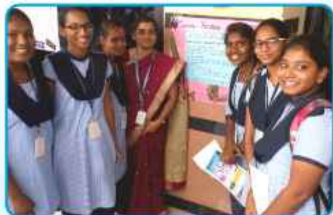
National Science Day Botany students with Oxygen yielding indoor plants