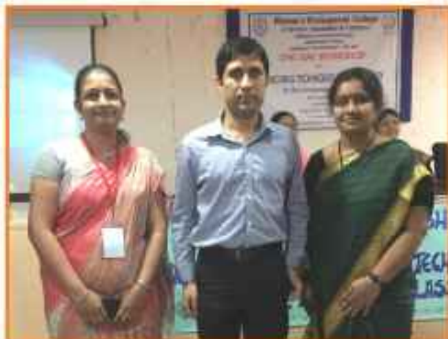
A click with the Resource Person