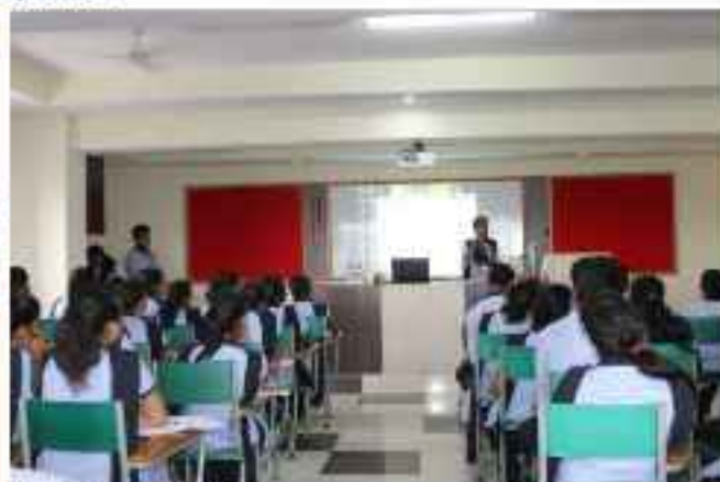
Students actively participated