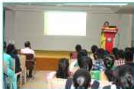
Key note speakers address at National Seminar