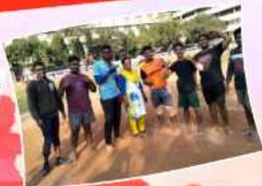
Intra Mural Kabaddi Competition