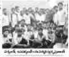
పాఠశాలల మొక్కలు పనిచేసే... ఉన్నతలో మొక్కలు నాటుతుంటే... ఉన్నతలో మొక్కలు నాటి ఉద్యోగం పని కారణం కార్యక్రమం..

సైపర్ క్యాంప్ కార్యక్రమం... ఉన్నతలో మొక్కలు నాటుతుంటే... ఉన్నతలో మొక్కలు నాటి ఉద్యోగం పని కారణం కార్యక్రమం..