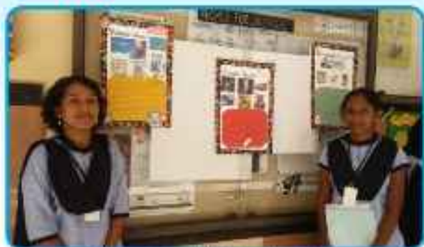
Science day celebrations- Inventions

The National Science Day was celebrated on the theme "People for Science and Science for People" on 28th February 2019 in Karunya court in the college campus by Department of Physical Sciences & Life Sciences. Students came up with posters of scientists with their contributions to the society as well as displayed models. Each and every class presented a model and a poster.