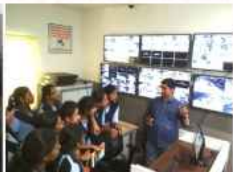
Students were given the exposure about the technology used in traffic control