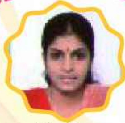
A Jyothsna III BSC MECS