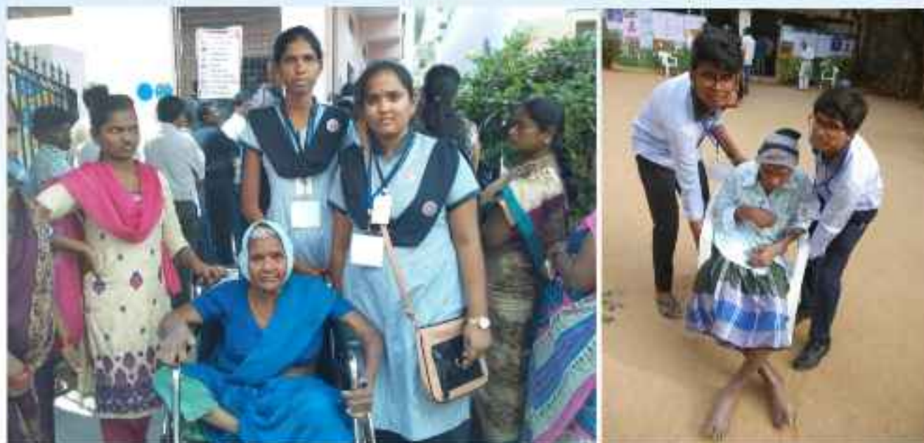
Volunteers actively helping in PWD General Assembly Elections