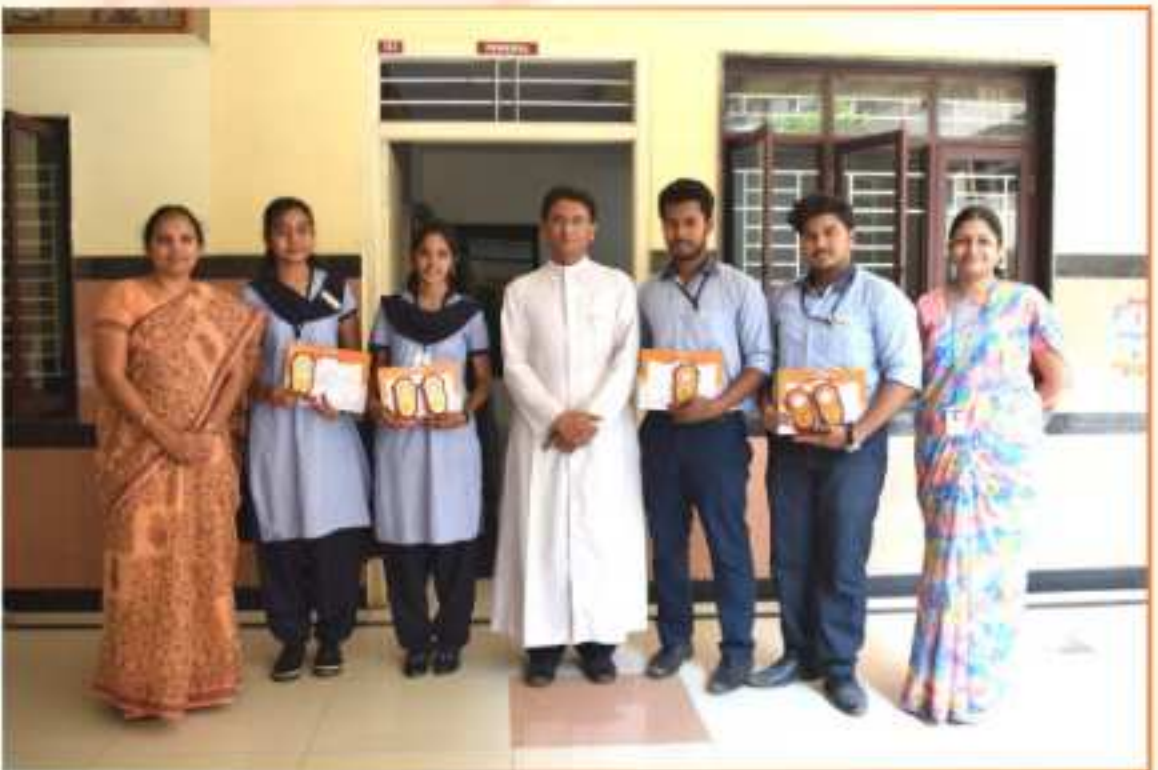
Winners of Inter Collegiate Competitions French at Avinash Degree College

The Management Club has conducted intra collegiate competitions like Cross Word, Logo Presentation on 19th September 2018 and World Summit on 24th September 2018. These competitions enhance the time management and communication skills of the students. Students from all the streams have enthusiastically participated in these competitions.