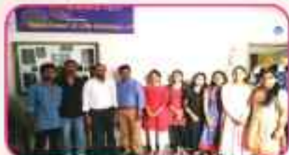
1st Year B.Tech students with faculty members Dilshuknagar - Hyderabad