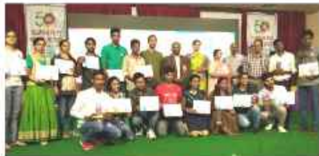
Students participated in Election Awareness Programme

to cast their vote. The questionnaire was held by Deputy Commissioner at the end to which students gave answers with perfection and confidence. He advised the students how to be a responsible citizen. Overall it was an extremely informative and good learning process thoroughly.