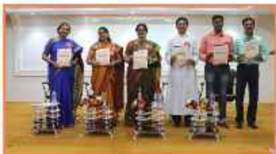
The Esteemed Guests Released proceedings.