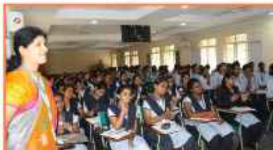
Seminar on Introduction to Costing