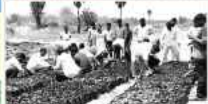
పాఠశాలల మొక్కలు పనిచేసే... ఉన్నతలో మొక్కలు నాటుతుంటే... ఉన్నతలో మొక్కలు నాటి ఉద్యోగం పని కారణం కార్యక్రమం..