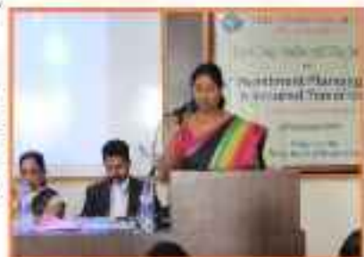
Faculty introducing the Chief Guest

Little Flower Degree College, Dept. of Commerce organized a one day National Workshop on "Investment Planning for a Secured Tomorrow" on 10th November, 2018 in collaboration with South Indian Bank, Habsiguda. Eminent personalities from various walks of life interacted with the faculty and participants.