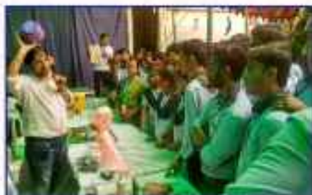
A YOUNG RESEARCHER EXPLAINING ABOUT ADVANCED DENGUE VIRUS

A field trip was conducted to CSIR-CCMB, Habsiguda, Hyderabad commemorating the foundation day of CSIR. Students and faculty of various life sciences departments attended that event. Visit started with the process of registration and went on very well. Young researchers in the various fields of biological sciences exhibited and explained their works to the students and visitors. They focussed on how their research work is going to help the society and what applications and uses can be taken out of their works.