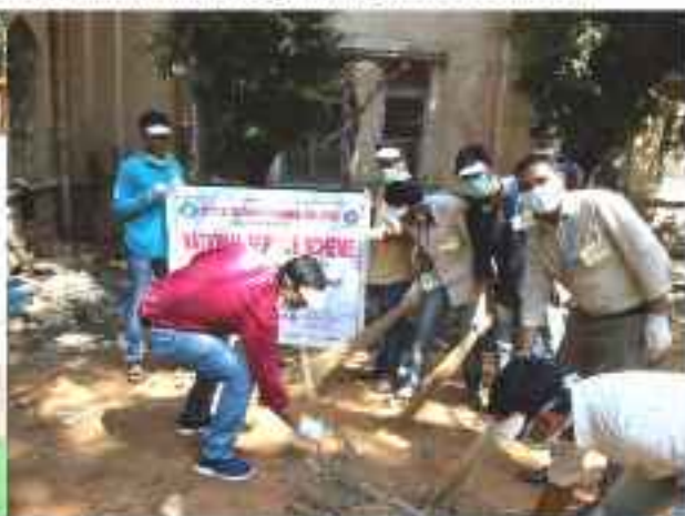
Volunteers at Osmania Hospital