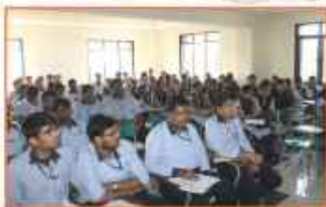
Students participating in the guest lecture

To save time in competitive exams and for faster calculations he has explained some tricks in Vedic mathematics for the multiplication and division of larger numbers. He also explained tricks to find square root, cube root, n th root of larger numbers by spending very less time on calculations. He created enthusiasm in the students to learn Vedic mathematics to do calculations easily and fast.