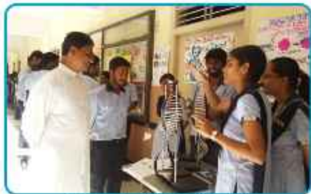
Science day celebration: DNA model