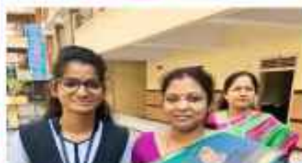
Volunteers go Ecofriendly