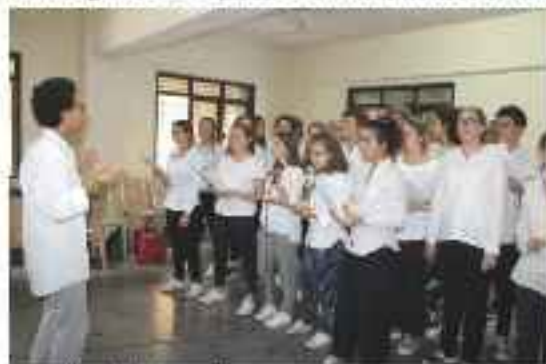
Students from France singing a group song