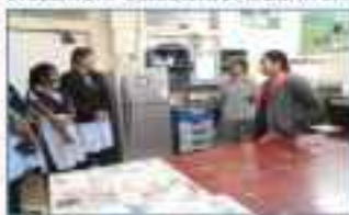
STUDENTS AT MOLECULAR BIOLOGY LABORATORY