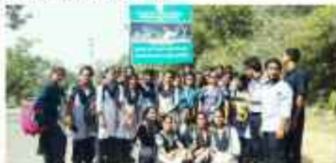
Field trip Jawahar Deer Park at Shamirpet

The students of 1st year BZC visited Shamirpet Lake and Jawahar Deer Park on 12th January 2019, to study fresh water ecosystem and terrestrial ecosystem. The park is called as Shamirpet Deer Park due to its close vicinity to the Shamirpet Lake, an artificial manmade lake. The park is spread over 55 acres and is also home to 15 different species of birds. It also exhibits a Butterfly Park, which is a treat to watch. Chital and Blackbucks living in its natural habitat are the main residents here and are found in large numbers.