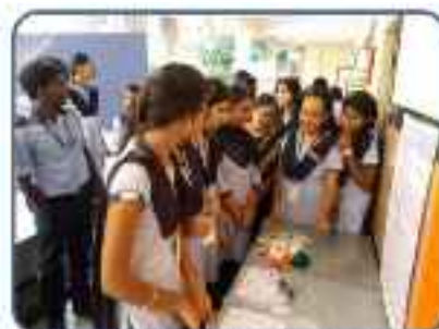
Ban Plastics, Use Bio Plastics