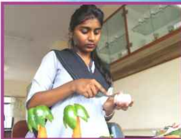
Vegetable carving by Miss. Thabitha