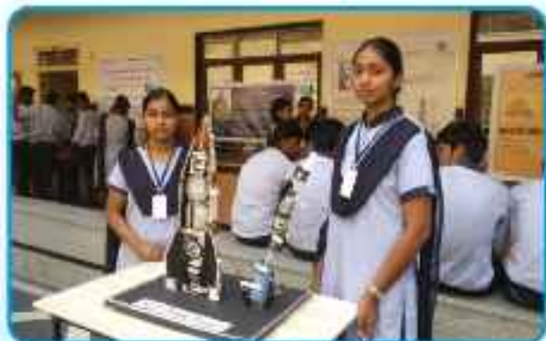
National Science Day-8