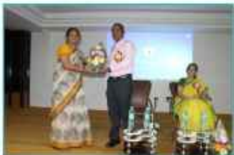
National Seminar felicitation of Resource Person