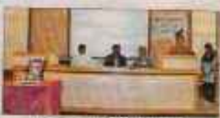
పాఠశాలల మొక్కలు పనిచేసే... ఉన్నతలో మొక్కలు నాటుతుంటే... ఉన్నతలో మొక్కలు నాటి ఉద్యోగం పని కారణం కార్యక్రమం..

పాఠశాలలు అన్ని భాషలను వేర్వేరు చేయాల... ఉన్నతలో మొక్కలు నాటుతుంటే... ఉన్నతలో మొక్కలు నాటి ఉద్యోగం పని కారణం కార్యక్రమం..