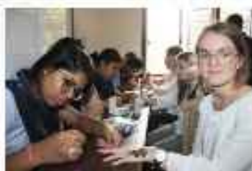
The students from France applying Mehendi and Nail art

Little Flower Degree College had invited and welcomed a batch of students who had come from France on 2nd November 2018 at 10: 30 AM. With warm greetings and love the students welcomed them and entertained the guests with a plethora of events like traditional dance, singing and fun games. The event started with a prayer song and a prayer in French. Later on, a traditional folk dance was displayed to the guests. Moving on, few songs were sung by the students in regional languages which were applauded by the guests. After that, many fun and challenging games were conducted by the students to entertain and also, to test the capabilities of students. The students had a brief interactive session with guests about the culture and diversity of respective nations. Finally, the female guests were provided with mehendi and nail art of Indian origin.