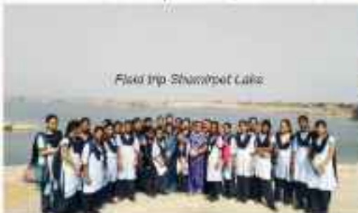
Field trip Shamirpet Lake

The entire Shamirpet Lake can be seen from the Observational Tower. Once was a hunting ground for Nizam, this park is now maintained by the Government of Telangana under the supervision of State Forest Department. Students collected water samples randomly from different locations to study the different life forms such as the planktons, aquatic organisms and the water quality. The BOD, chlorides and carbonates were analysed and aquatic fauna were identified.