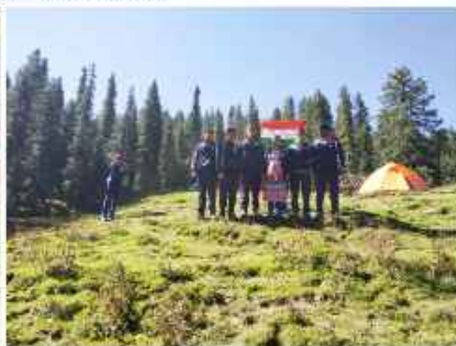
T. Nagarjuna at Himachal Pradesh