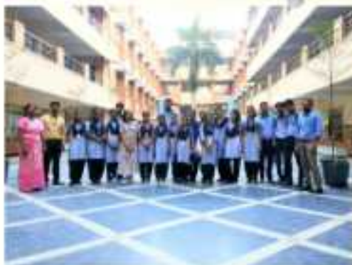
Students Selected for Prudential ICICI