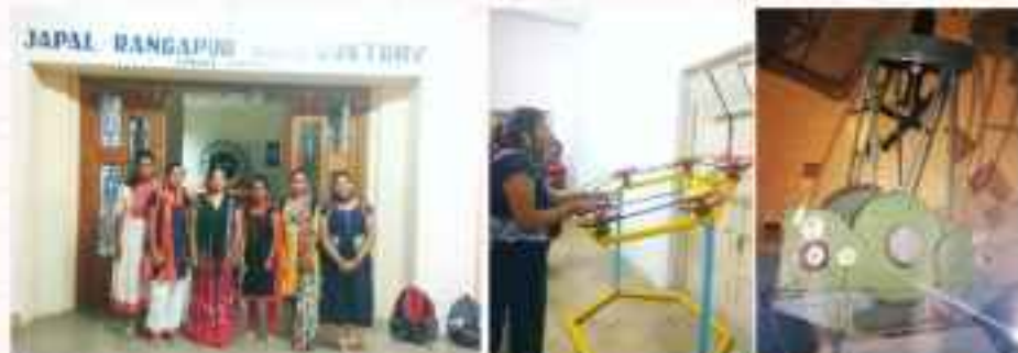
Students observing Telescope various model at Japal Observatory