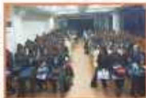
Model United Nation

The Department of Management conducted the event Model United Nation on 23rd August, 2018 in Heritage Hall of Little Flower College. The main object of the event is to know about the economic policies of various countries, their military power and how the countries depend on each other in the Instance of war and its Impact on the globe. Various streams of students participated as representatives of each country and explained the geographical, economical conditions of the armed force, its position in the world & their latest innovations.