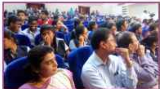
Endowment lecture by TAS at IICT