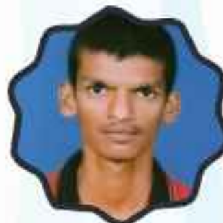
Shiva III BCOM CS