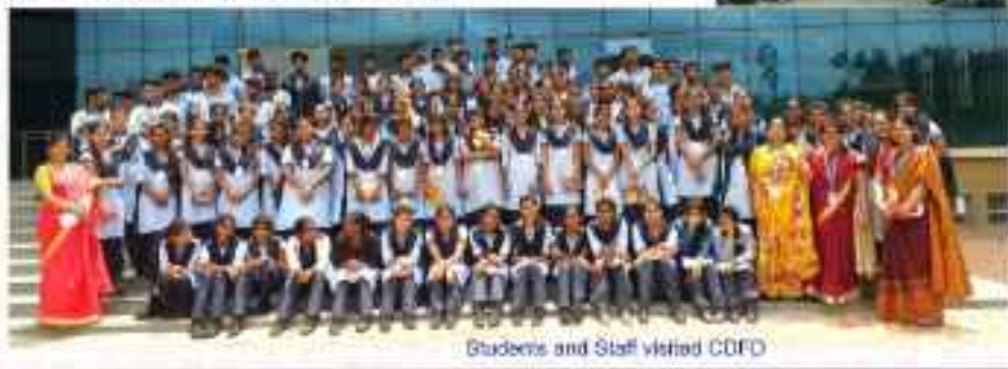
Students and Staff visited CDFD