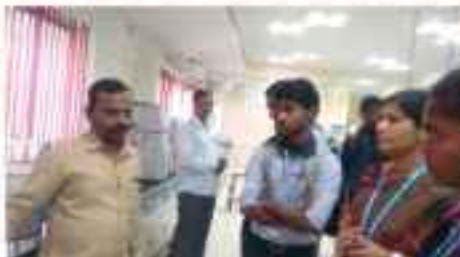
BITS technical staff explaining students instrumentation