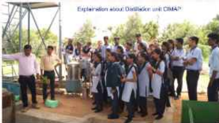
Explanation about Distillation unit CIMAP