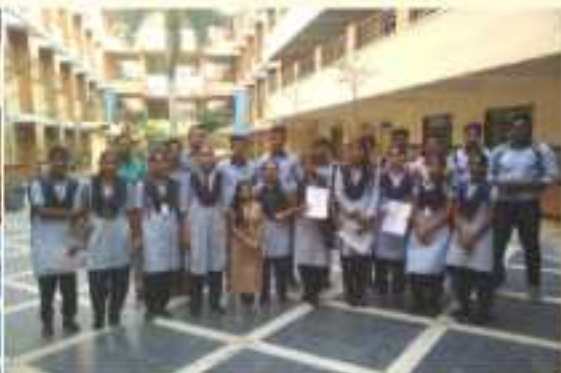
Students with offer letter from Sutherland