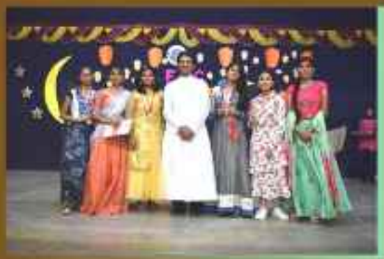
Winners of the Award Function along with Principal