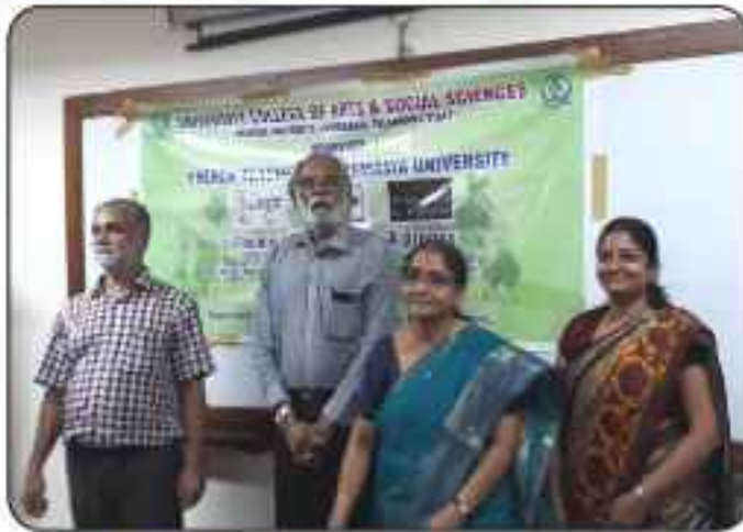
A Pic with the resource person and OU Professors