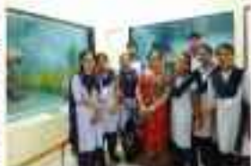
Museum of Zoological Park

The Students of 1st and 2nd year BZC visited the Nehru zoological park, Hyderabad on 16th February 2019. The zoo hosts many indigenous as well as exotic breeds. The lion and tiger safari is the main attraction, which shows the animals in their natural habitat. The students observed the butterfly park, Reptile Park and aquarium which helped them understand animal behaviour. They had an opportunity to observe the caretakers feeding the animals and they even interacted with them. They were able to collect information on the diet and amount of food to the animals. The Zoo has a museum, which has an excellent collection of stuffed wild animals, Paintings with 3D visual images and preserved fortuses of wild animals like Lion, Tiger, Langur, etc. This introduced the concept for preservation and conservation of wild animals. The main objective of this visit was to learn about animal behaviour, management, conservation and breeding of animals. The students gained knowledge and experience on all these parameters.