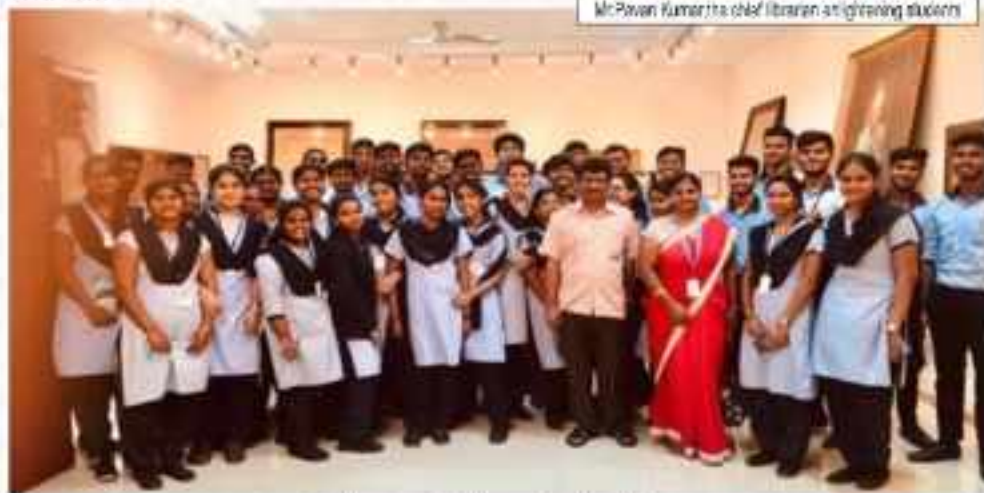
Students enlightened to visit library