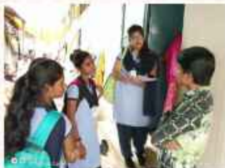
Rohingya Refugee Camp