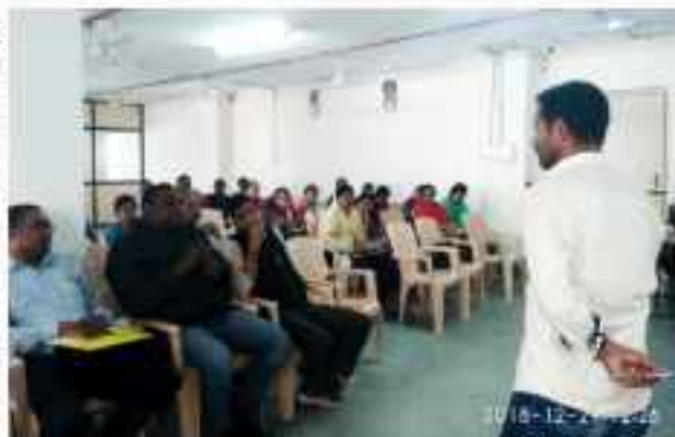
Evolution Technologies in Telecommunication