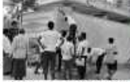
శ్రీ శంకరస్వామి ఆలయంలో రంగులు వేసిన కుద్యార్థులు

పరిశోధనా కేంద్రం, ఉమ్మళ్ కమిటీ ఆఫ్ టీఎంసీఎస్ కార్యకర్తలు, ఉమ్మళ్ కమిటీ ఆఫ్ టీఎంసీఎస్ కార్యకర్తలు, ఉమ్మళ్ కమిటీ ఆఫ్ టీఎంసీఎస్ కార్యకర్తలు, ఉమ్మళ్ కమిటీ ఆఫ్ టీఎంసీఎస్ కార్యకర్తలు.