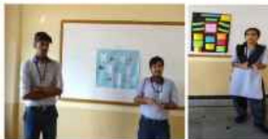
Students with Presentations

Poster presentation was conducted on 12th November, 2018 on "Life of Abdul Kalam and his contributions towards science and technology". Students enthusiastically participated in the event and presented posters on his life, quotations, inspiration drawn from his speeches, contribution to the field of nuclear science, artificial limbs manufacturing.