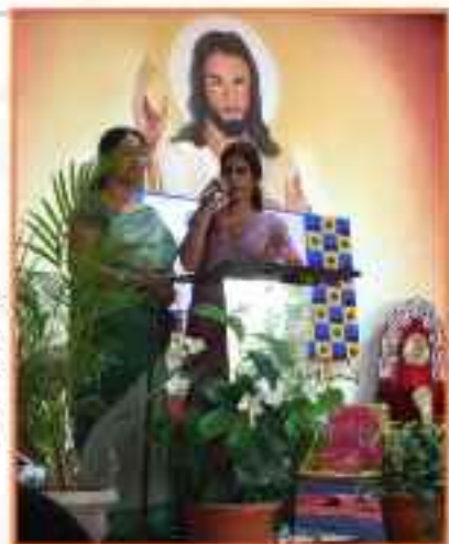
Presentation of Paper in National Seminar