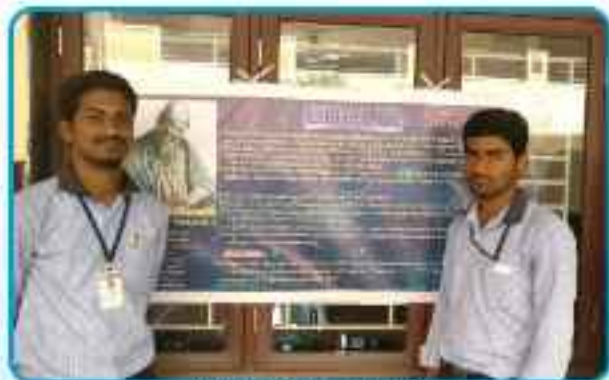
National Science Day-2