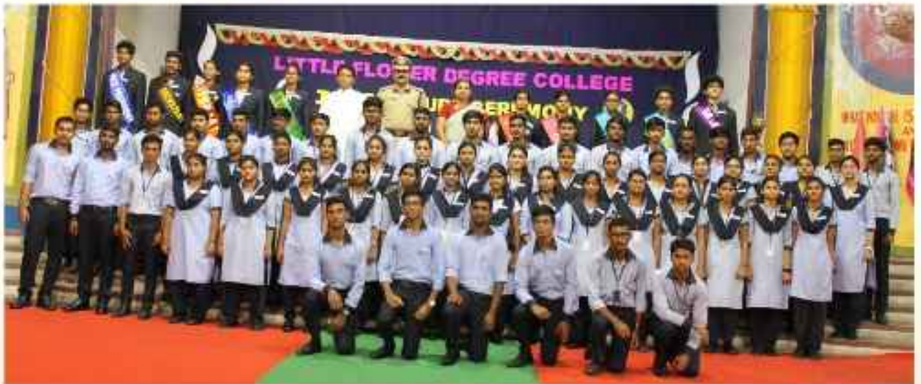
The Elected Student Council