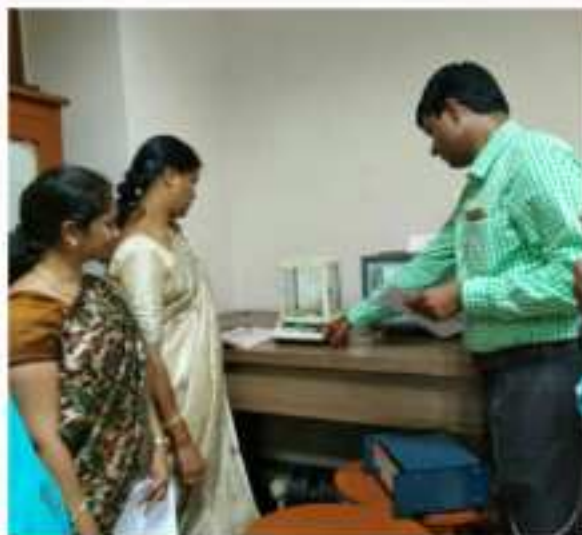
Faculty observing various experiments in OU lab

The sessions provided many insights about new developments in Physics curriculum for Degree students.