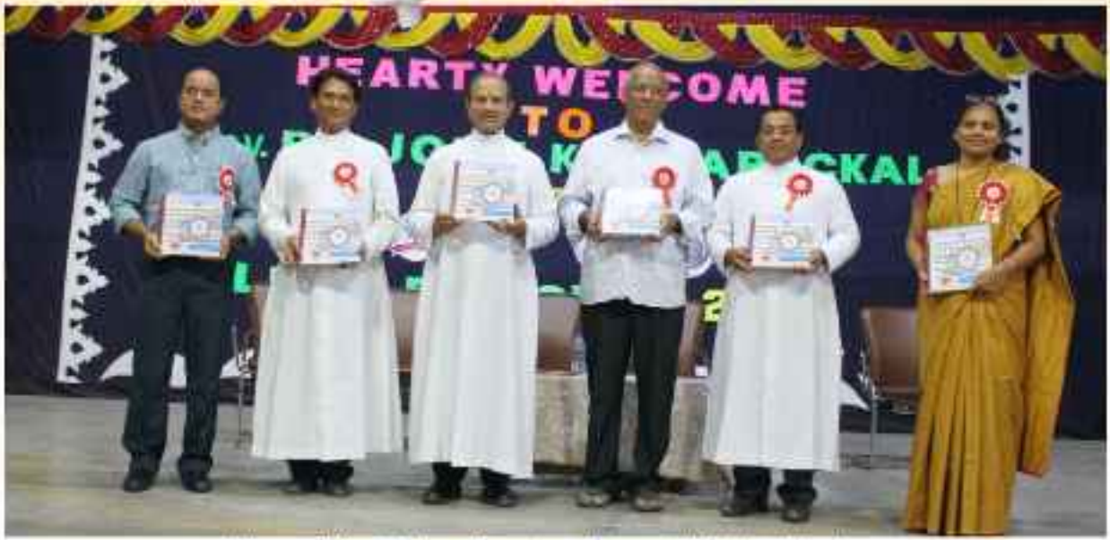
Release of the College Magazine - Decennial Celebration Issue