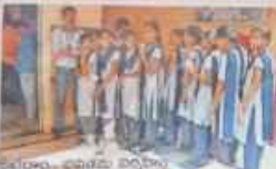
పాఠశాలల మొక్కలు పనిచేసే... ఉన్నతలో మొక్కలు నాటుతుంటే... ఉన్నతలో మొక్కలు నాటి ఉద్యోగం పని కారణం కార్యక్రమం..

మాతృభాషను విప్లవం చెయ్యాలి... ఉన్నతలో మొక్కలు నాటుతుంటే... ఉన్నతలో మొక్కలు నాటి ఉద్యోగం పని కారణం కార్యక్రమం..