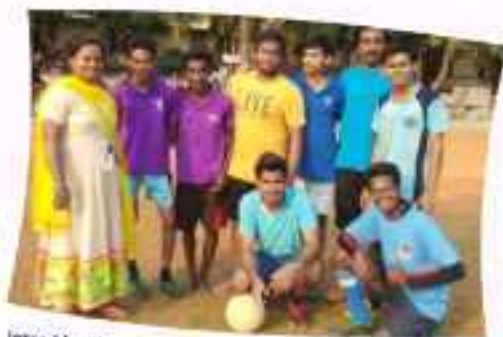
Intra Mural Football Competition

From 10.9.2018 – 19.9.2018 LFDC had conducted Intra mural competition for sports & games of sports week. The programme had been scheduled and the result of the competition are as follows:-