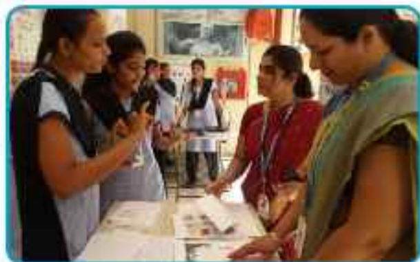
Science Day celebrations- brain games